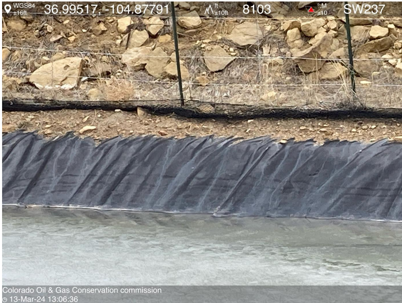
PHOTO 4: NETTING IS TORN. Such fencing and netting or other CPW-approved exclusion device will be installed within 5 days after the cessation of active drilling and completion activities and maintained until the Pit is removed from service and dried or closed pursuant to the Commission's 900 AND 1202 Series Rules CA DATE 5-22-24.