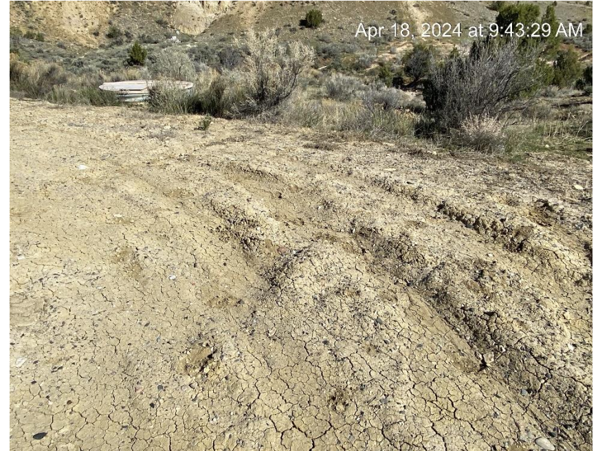
Erosion and sediment migration