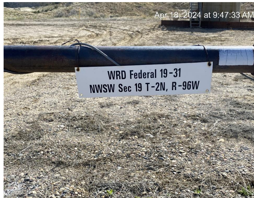
Well sign missing required information