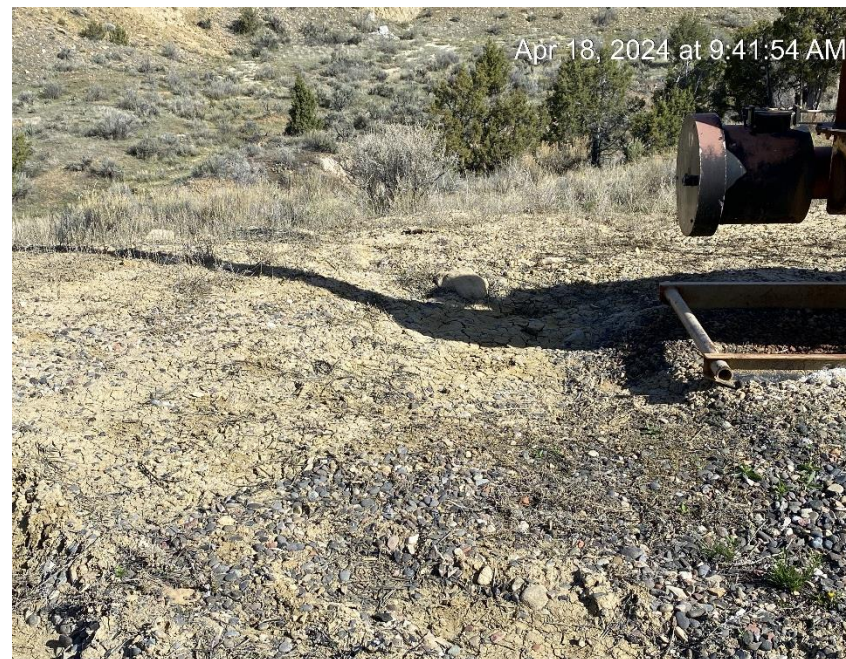
Erosion and sediment migration