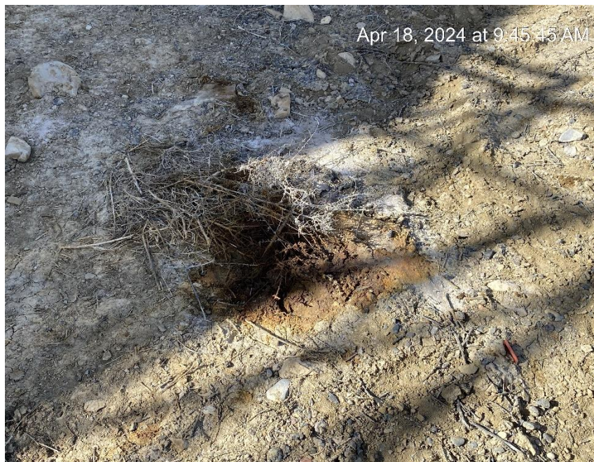
Stained soil outside of berm