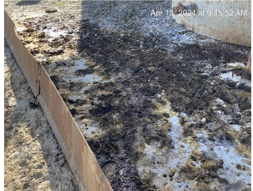
Oil spill cleanup incomplete. Cattle in the area.