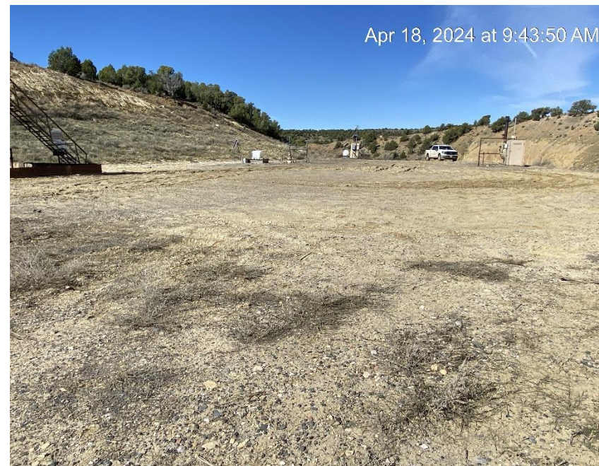
Location from Northeast corner