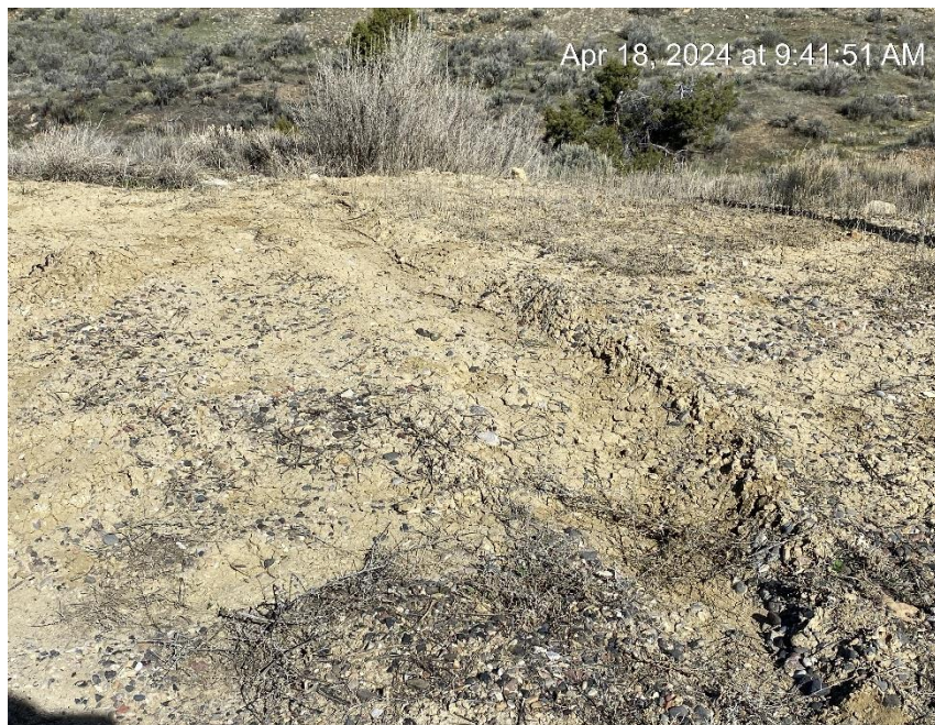
Erosion and sediment migration