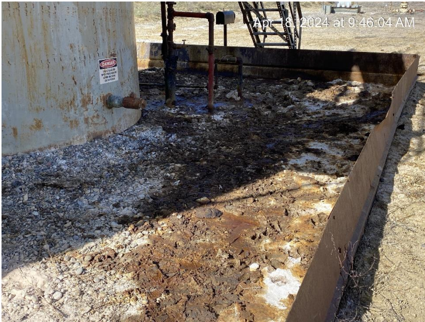
Oil spill cleanup incomplete. Cattle in the area.