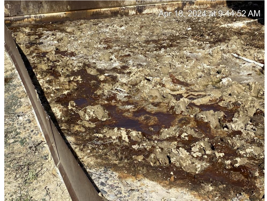
Oil spill cleanup incomplete. Cattle in the area.