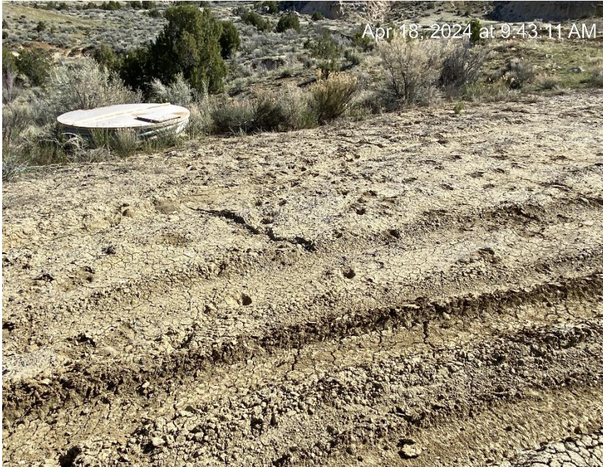
Erosion and sediment migration