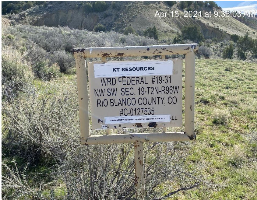
When replaced additional information is required