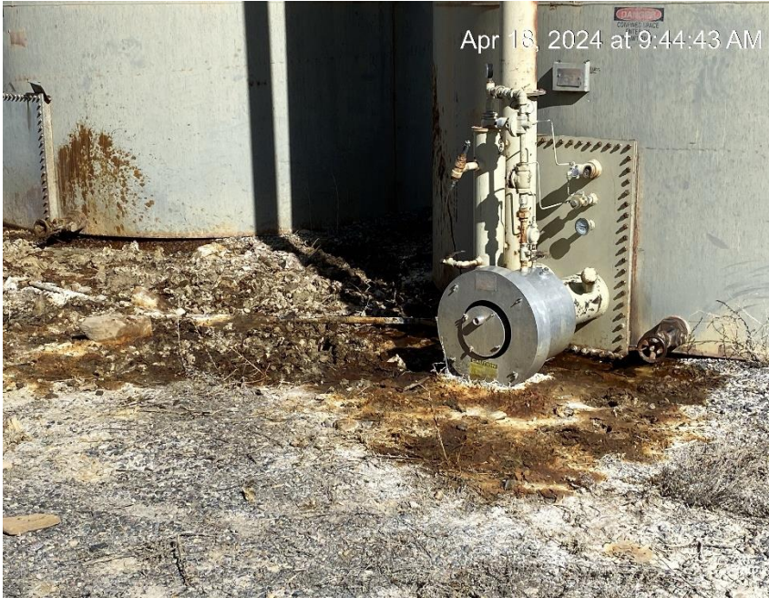
Incomplete cleanup of previous spill