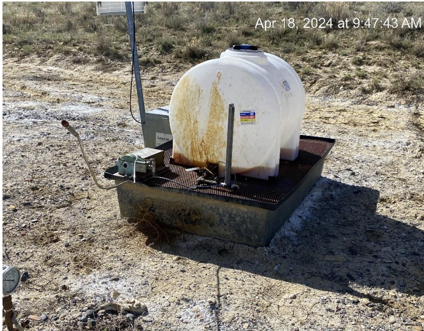
Unused equipment storage