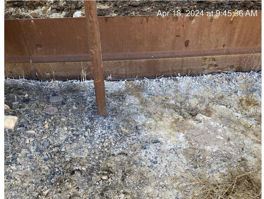
Metal berm leakage