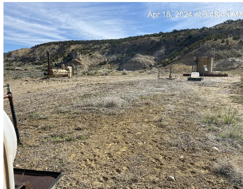
Location from Southwest corner