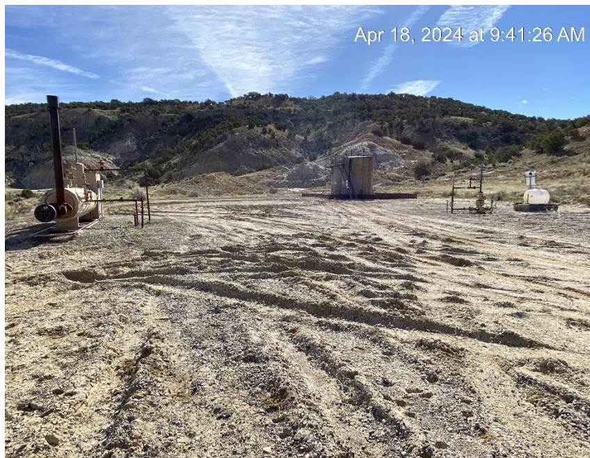
Location from Northwest corner