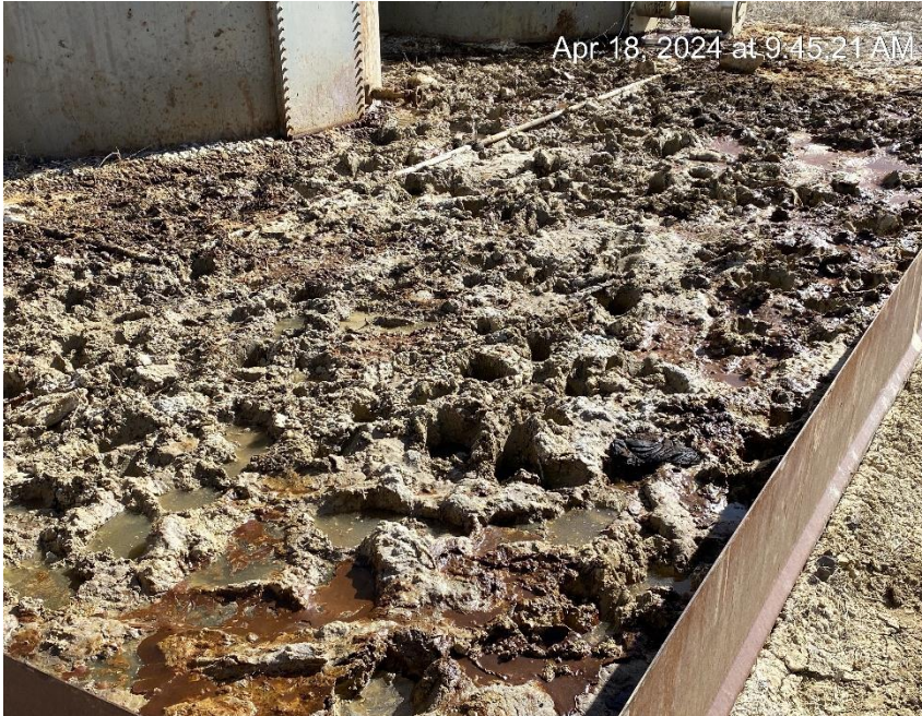
Oil spill cleanup incomplete. Cattle in the area.