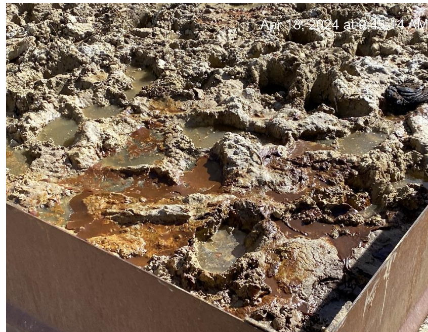
Oil spill cleanup incomplete. Cattle in the area.