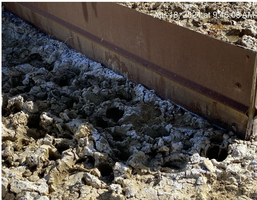
Metal berm seepage