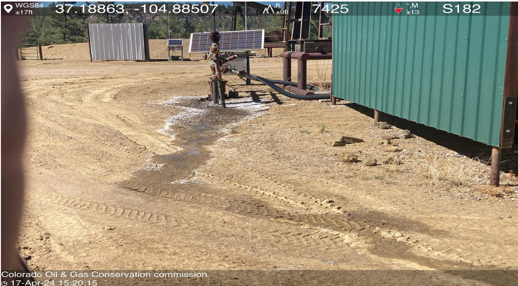
PHOTO 5 PACKING IS LEAKING ON R WELLHEAD, Produced water spill from the wellhead has left a salt impacted area around the wellhead. Securely fasten all valves, pipes, fittings, and Production Facilities to ensure good mechanical condition, inspect at regular intervals and maintain in good mechanical condition remove and dispose of impacted material per Rule 608.e. 24 HOURS TO STOP LEAK 5 DAYS TO DISPOSE OF IMPACTED MATERIAL. 4-23-2024.