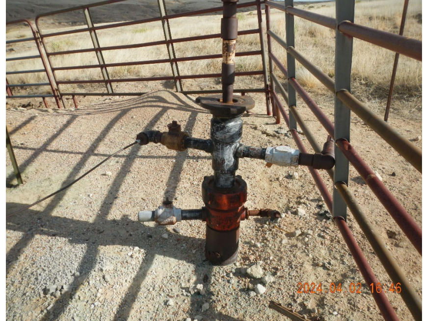
2. View of wellhead.