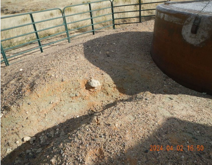
7. Erosion cut from meter shed and produced water tank.