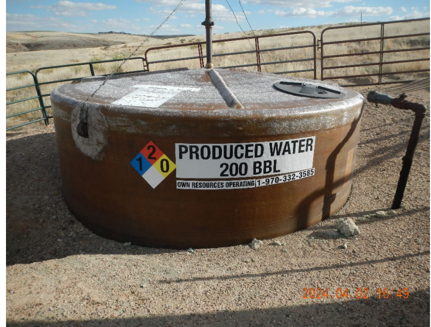
4. Produced water tank.