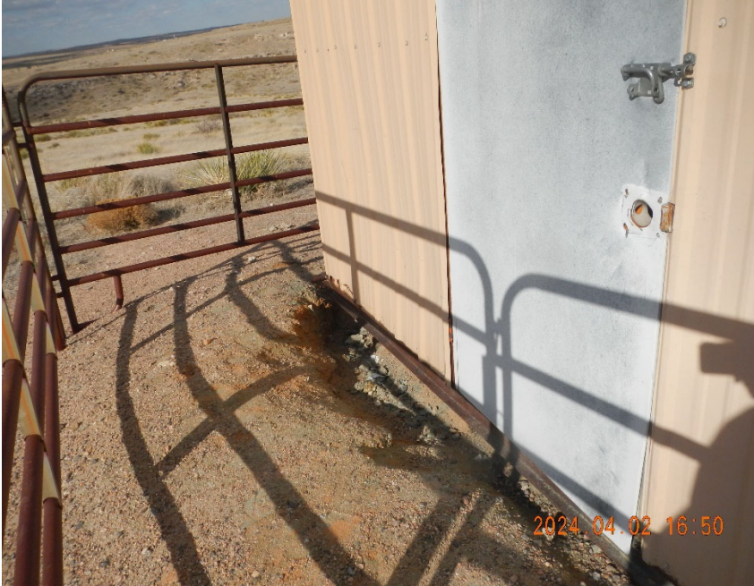
5. Soil erosion around meter shed.