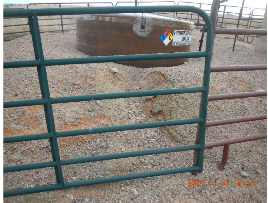
8. Erosion channel looking up the grade towards produced water tank.