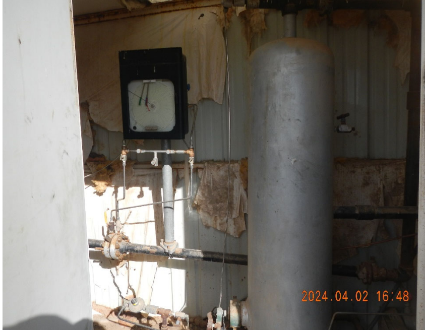
3. Vertical separator and gas meter inside shed.