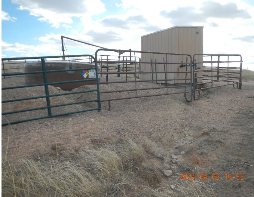
9. Erosion channels coming off location through fencing.