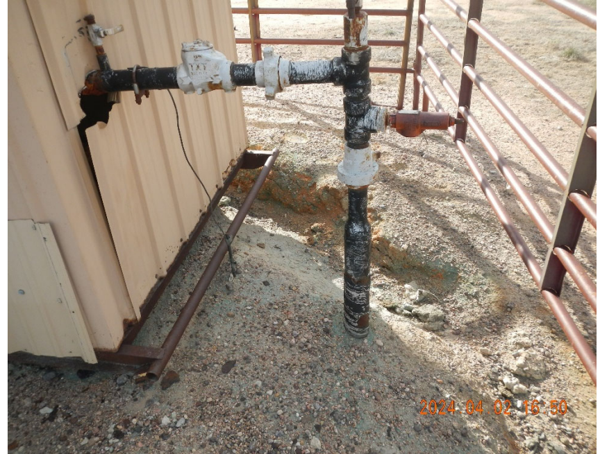
6. Erosion channel heading down grader from meter shed.