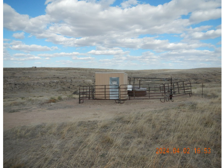
10. Location overview.