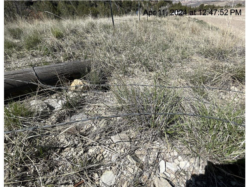
Photo # 3693 Fencing needs maintenance - post & barbed wire laying on the ground/wildlife hazard