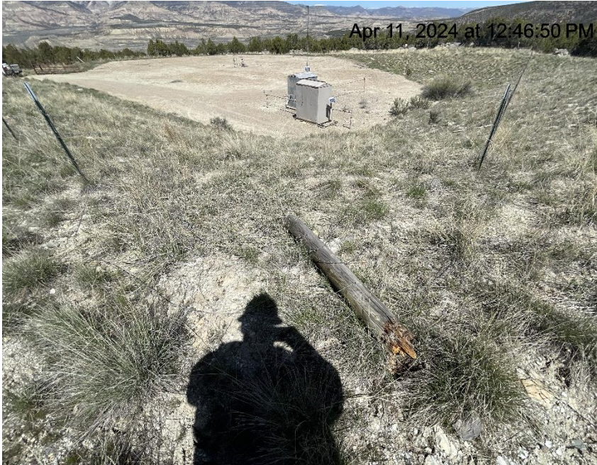
Photo # 3690 Fencing needs maintenance - post & barbed wire laying on the ground/wildlife hazard