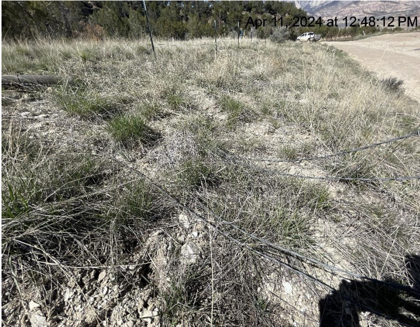
Photo # 3692 Fencing needs maintenance - post & barbed wire laying on the ground/wildlife hazard