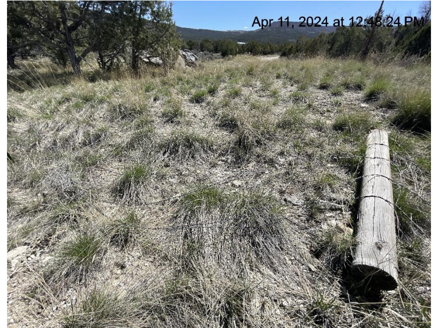
Photo # 3691 Fencing needs maintenance - post & barbed wire laying on the ground/wildlife hazard