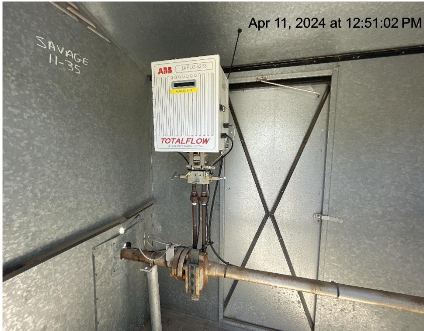
Photo # 3694 Gas meter calibration record for SAVAGE 11-35-6-94 W well not conspicuously displayed at meter