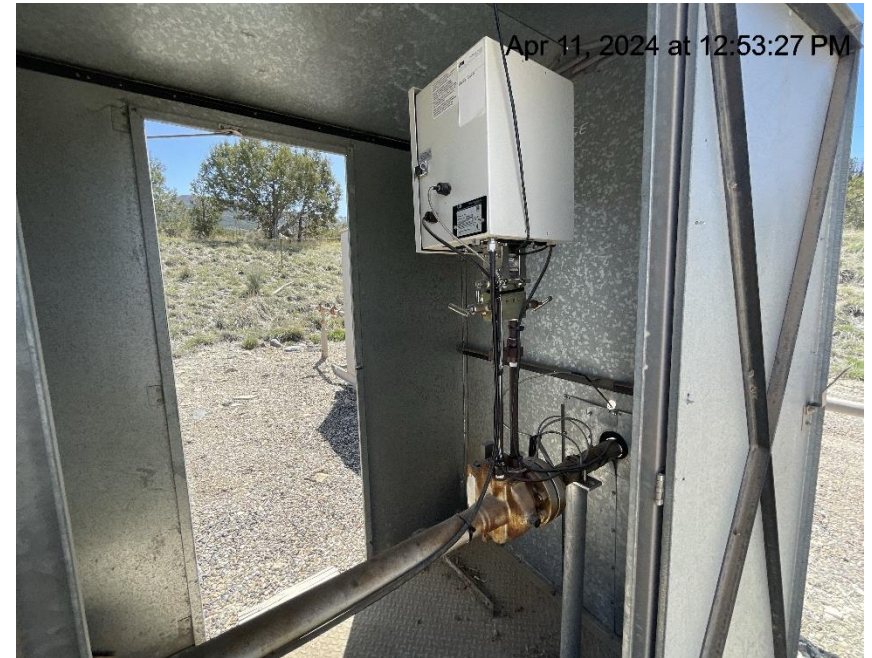
Photo # 3695 Gas meter calibration record for SAVAGE 11-35-6-94 W well not conspicuously displayed at meter