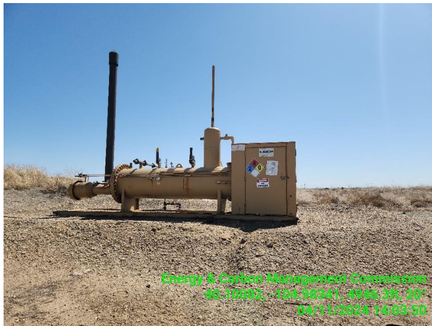
Photo 7 Horizontal Heated Separator.