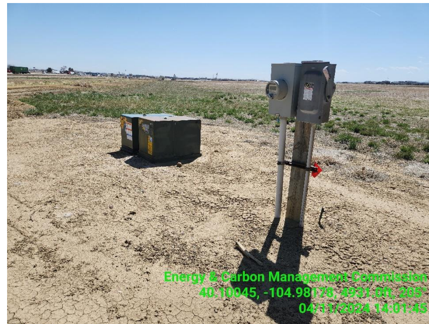
Photo 4 Ancillary equipment.