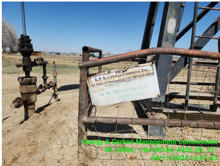
Photo 3 WH sign.