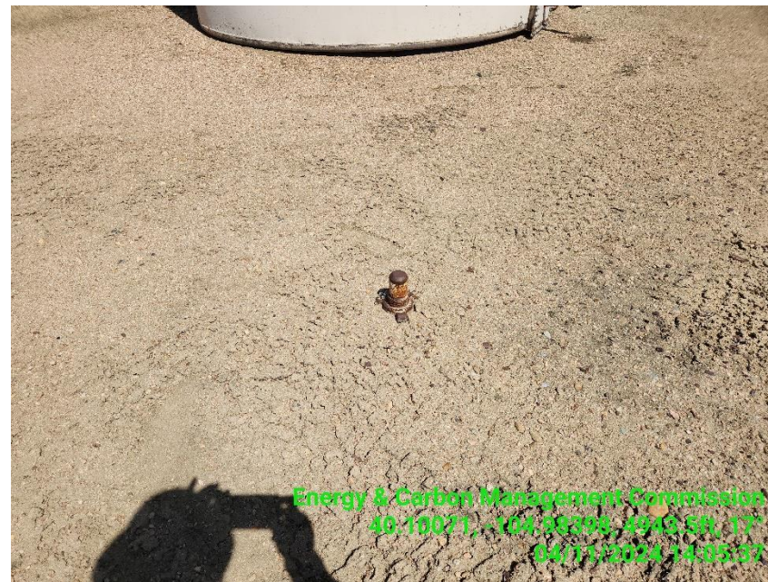
Photo 12 Capped flow line needs retagged.