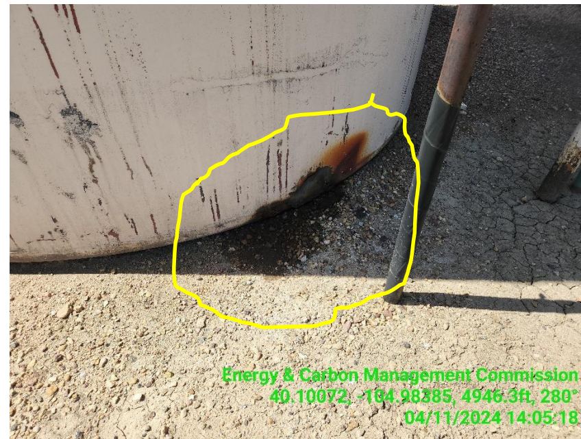
Photo 14 Stained soil at the base of the crude tank where it is rusted & pitted.