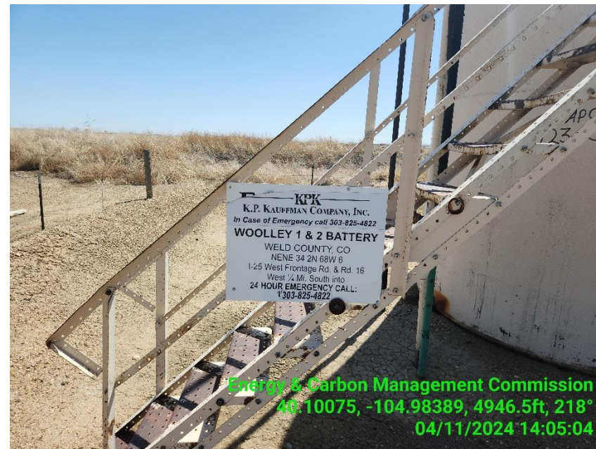
Photo 10 TB sign.