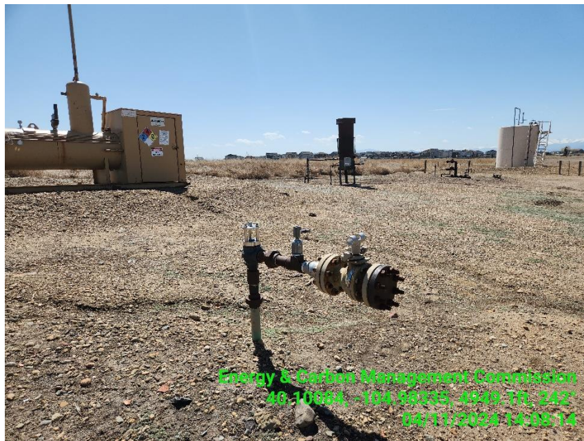
Photo 13 Flow line needs to be retagged.