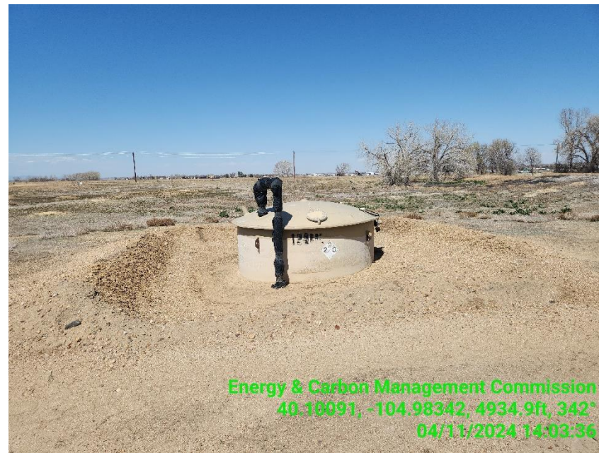
Photo 6 tank.