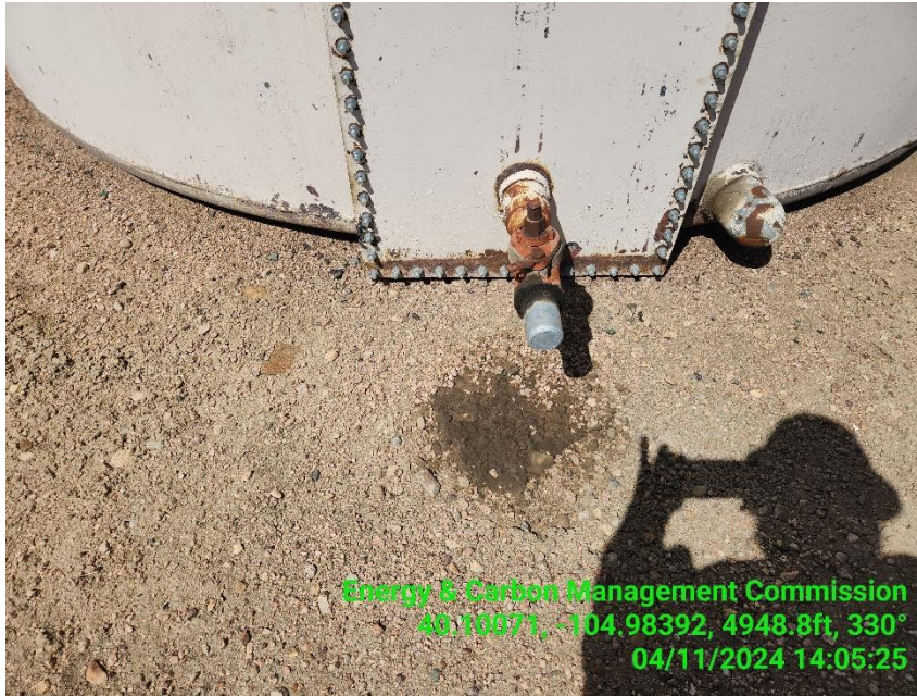
Photo 15 Stained soil by a capped leaking valve on the crude tank.