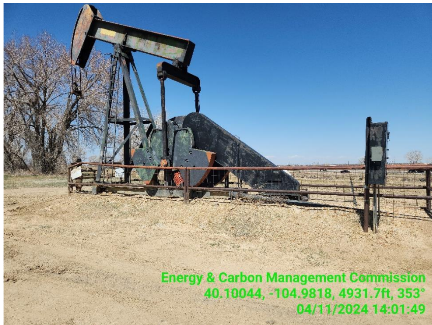
Photo 5 Pump jack.