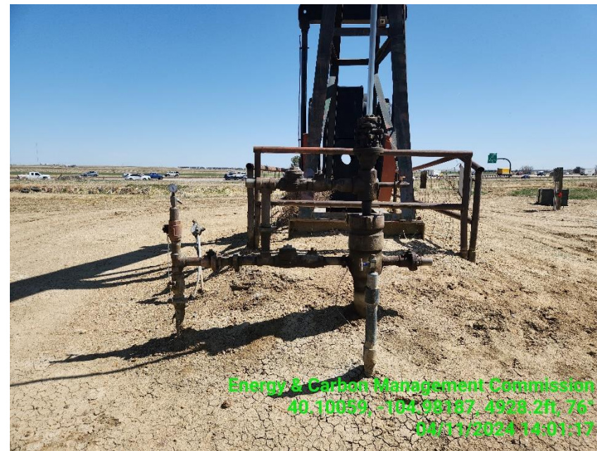
Photo 2 WH.