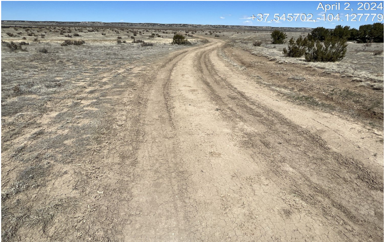
Photo 1. Facing north along the access road. The road needs to be built and stabilized with BMP's.