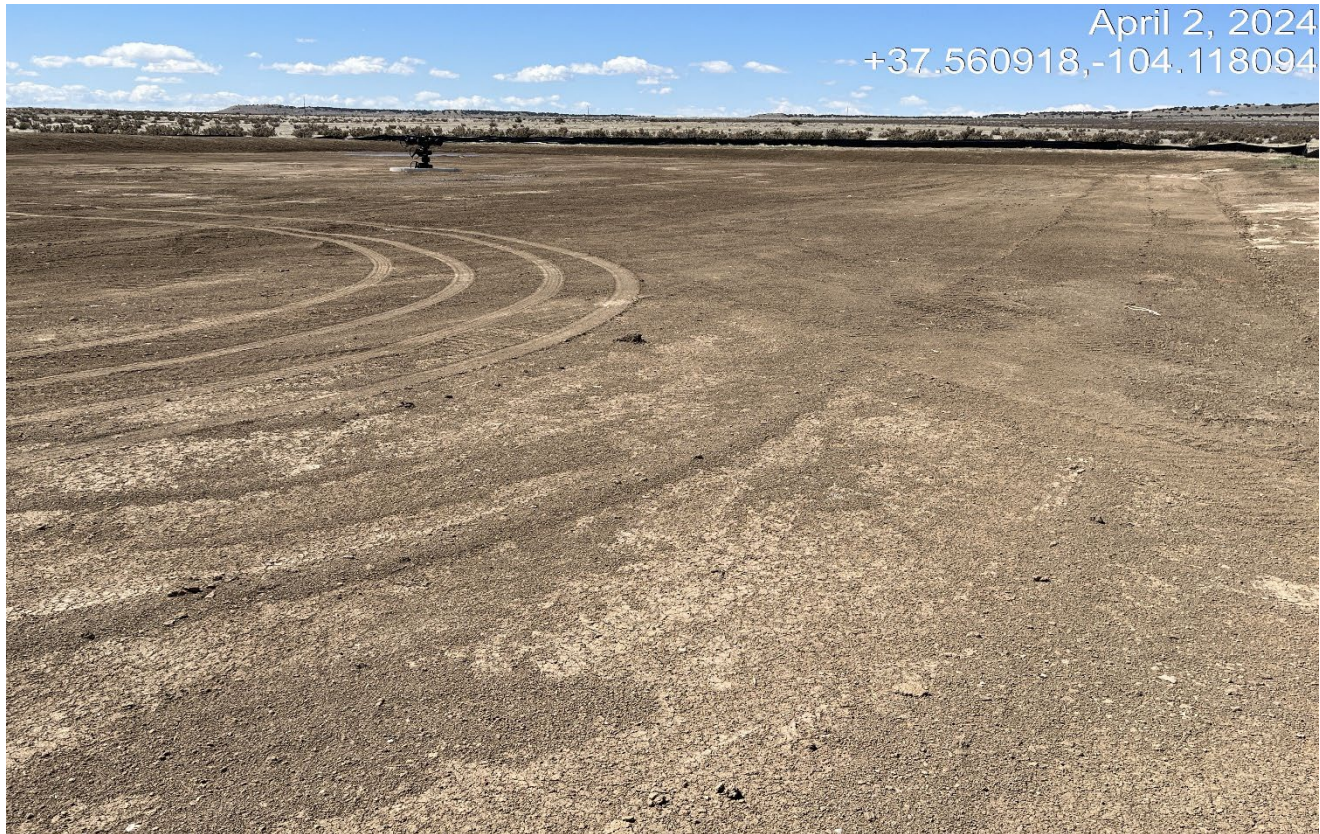
Photo 9. Facing northwest at the corner of the location. Unused areas of the location will need to be recontoured and reclaimed with 6 months of drilling.