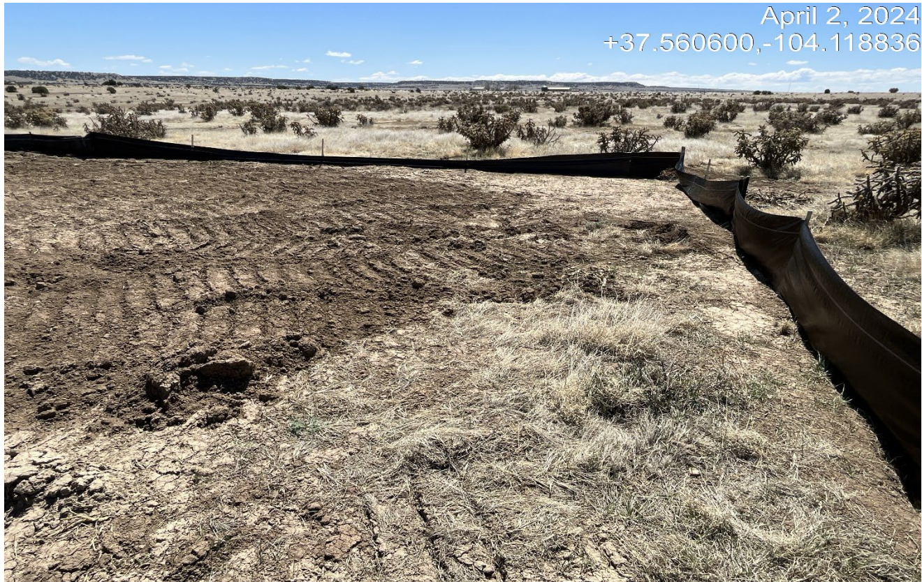
Photo 8. There are several areas where the silt fence is not maintained.