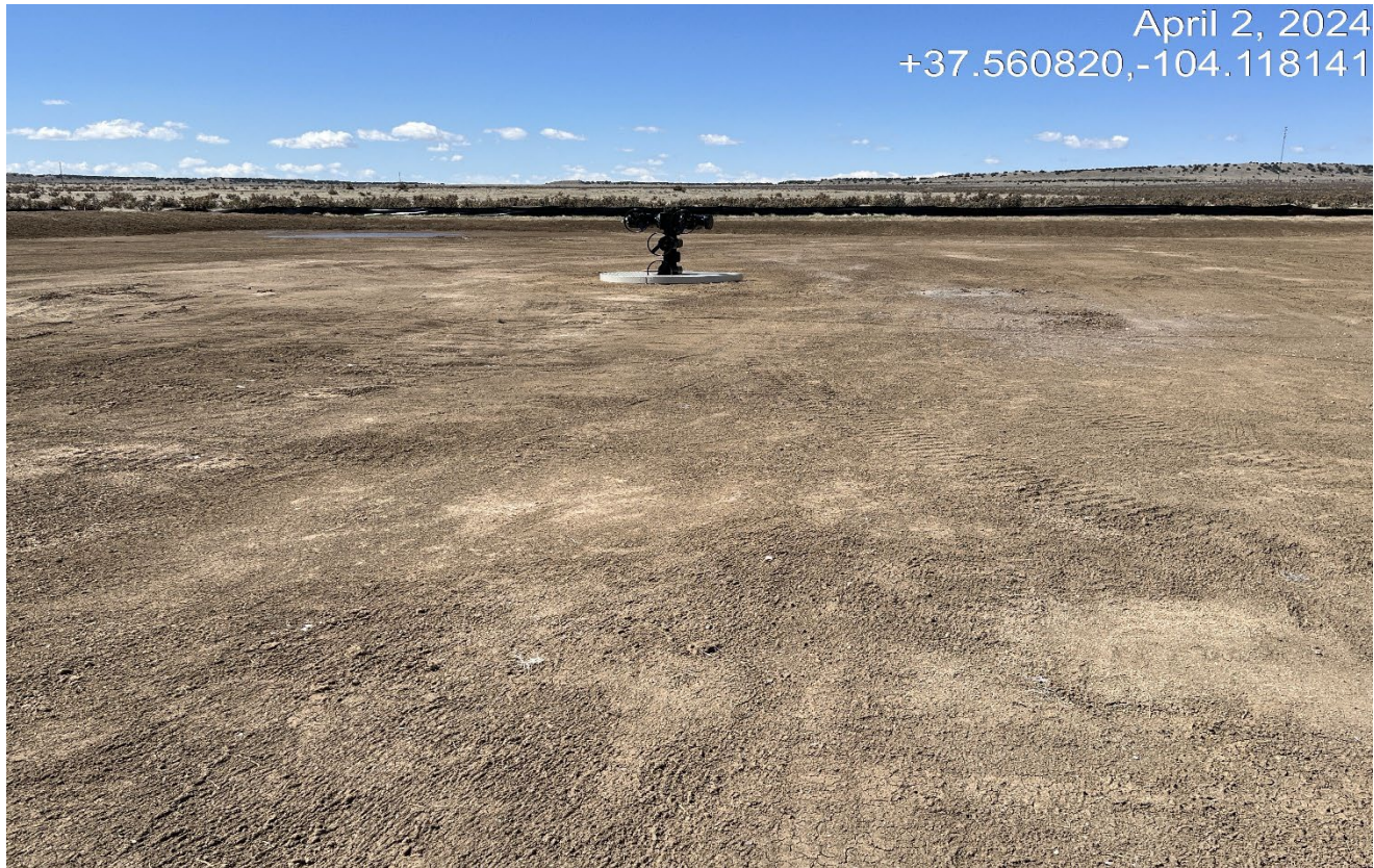
Photo 6. Facing toward the drilled well. The drill cuttings have been removed.