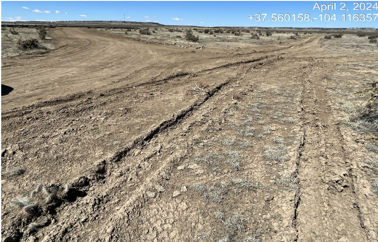
Photo 4. The vehicle ruts that went outside of the road will need to be raked and seeded. Previous corrective action was not completed.