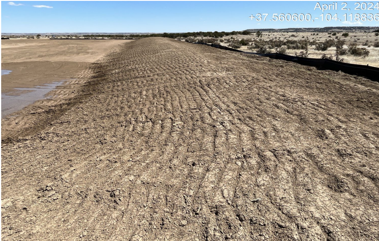
Photo 7. Facing toward the soil stock pile. The stock pile will need to be seeded before the growing season unless it will be re-spread for reclamation before that time.