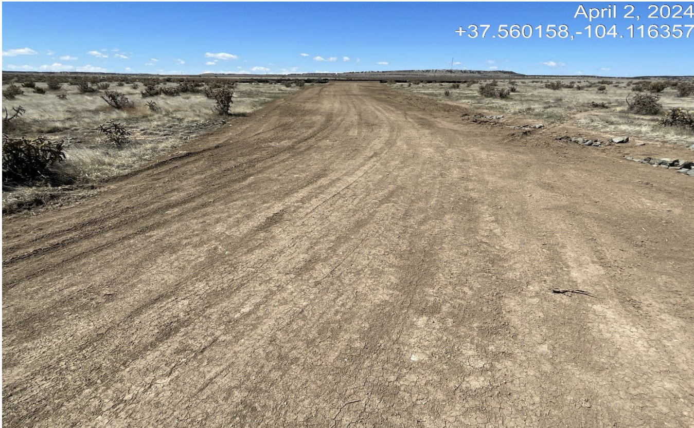
Photo 3. Facing northwest toward the access road. The side of the road needs to be seeded and stabilized and the road needs to be crowned and graveled if the well is developed. Previous corrective action was not completed.