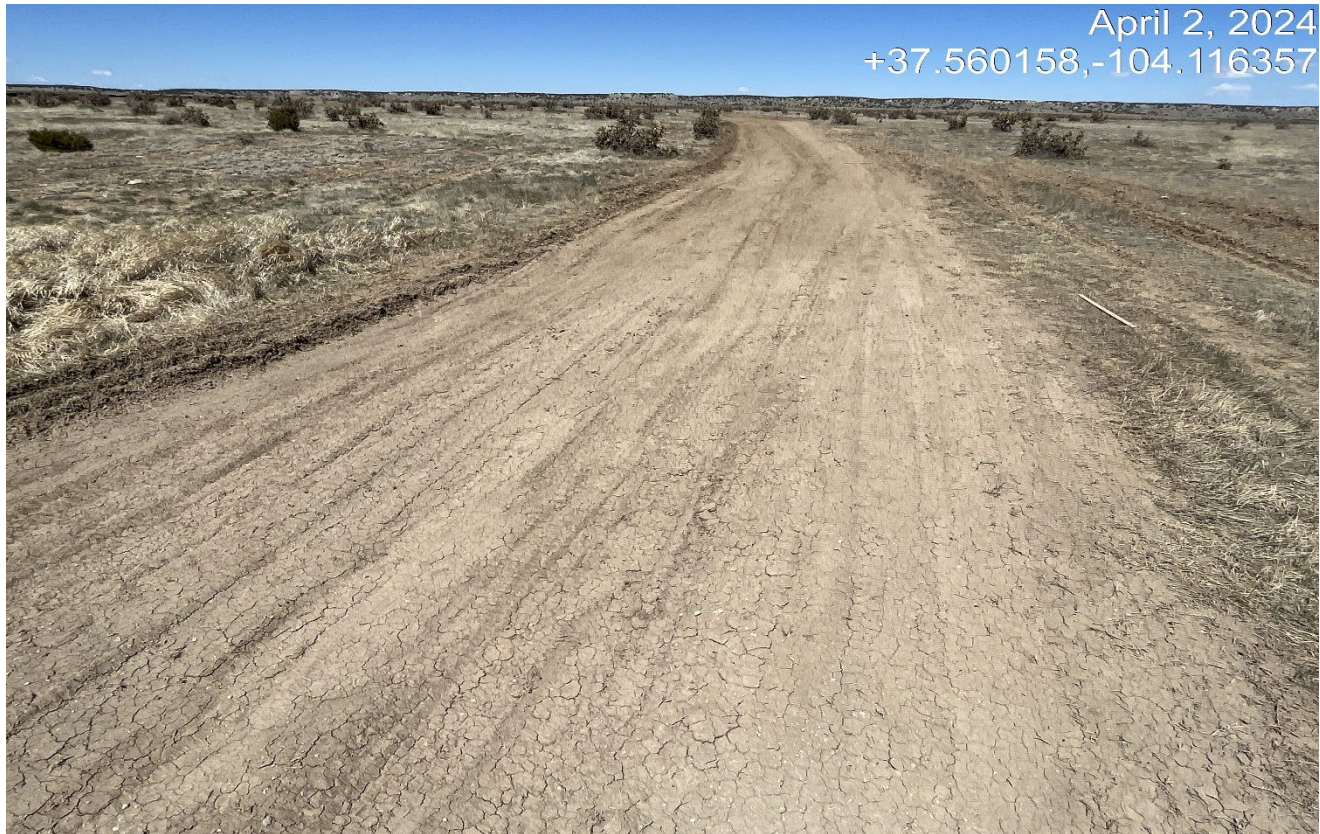
Photo 2. Facing north along the road. There is vehicle rutting that needs to be repaired and stabilized to prevent rutting and road damage. Previous corrective action was not completed.