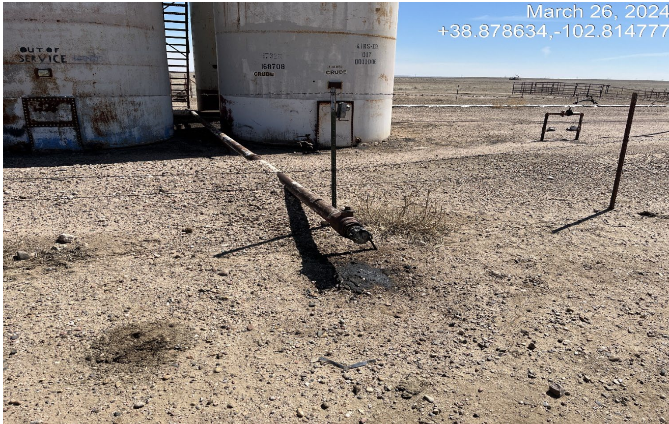
Photo 2. There is oily sludge that has leaked out of the tank load out pipe. Secondary containment needs to be installed and the stained material must be cleaned up.