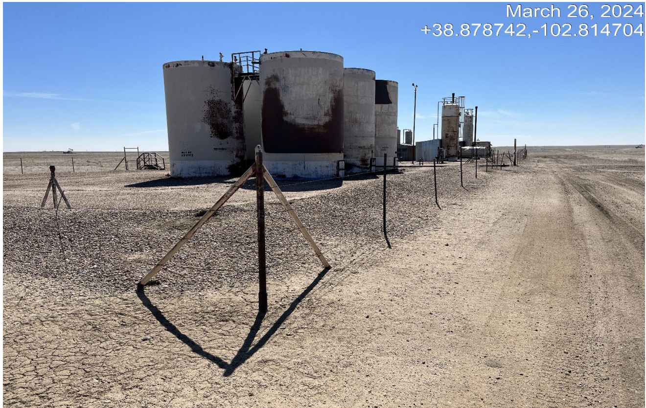
Photo 1. Facing southeast toward the tank battery,