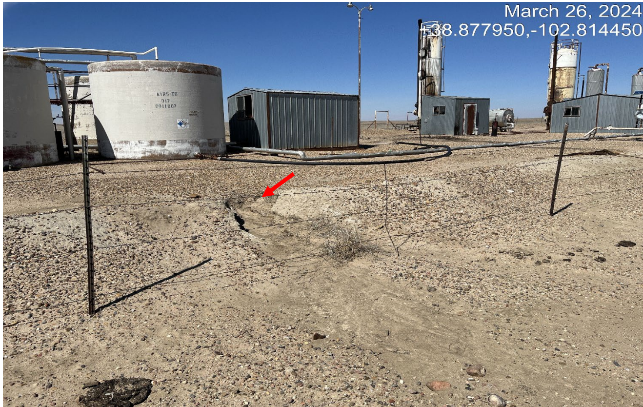
Photo 4. Southeast side of the location facing northwest, The secondary containment has been eroded and needs to be rebuilt in this area.