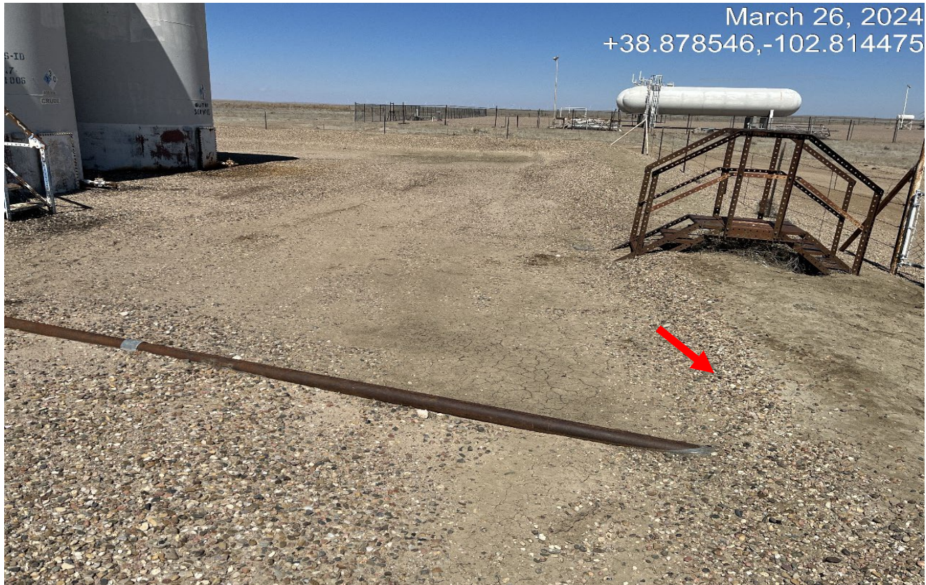
Photo 6. Facing toward the northeast side of the tank battery. The berm along the area is worn down and needs to be built up better for containmat.