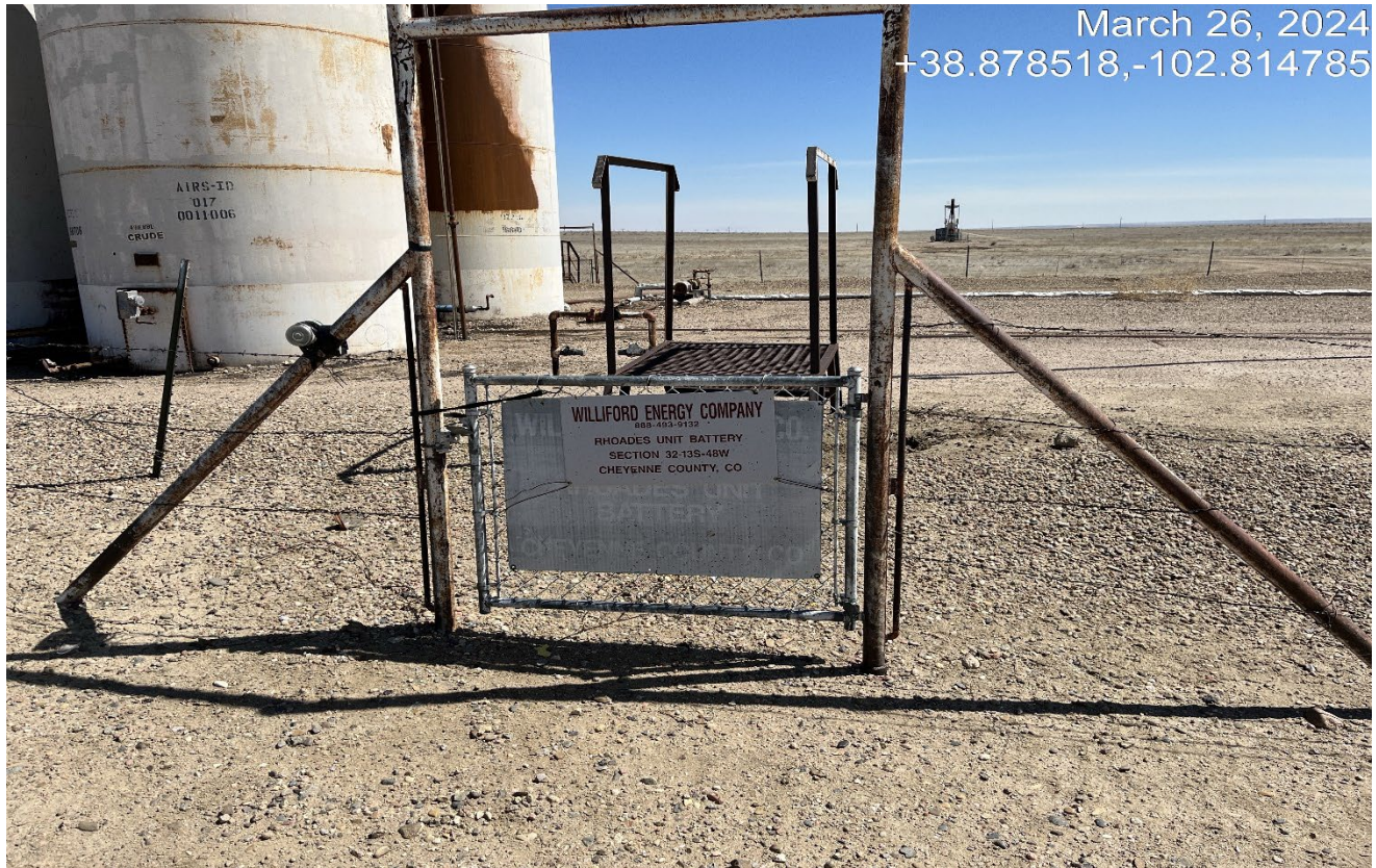
Photo 3. Tank battery sign is posted at west side gate.