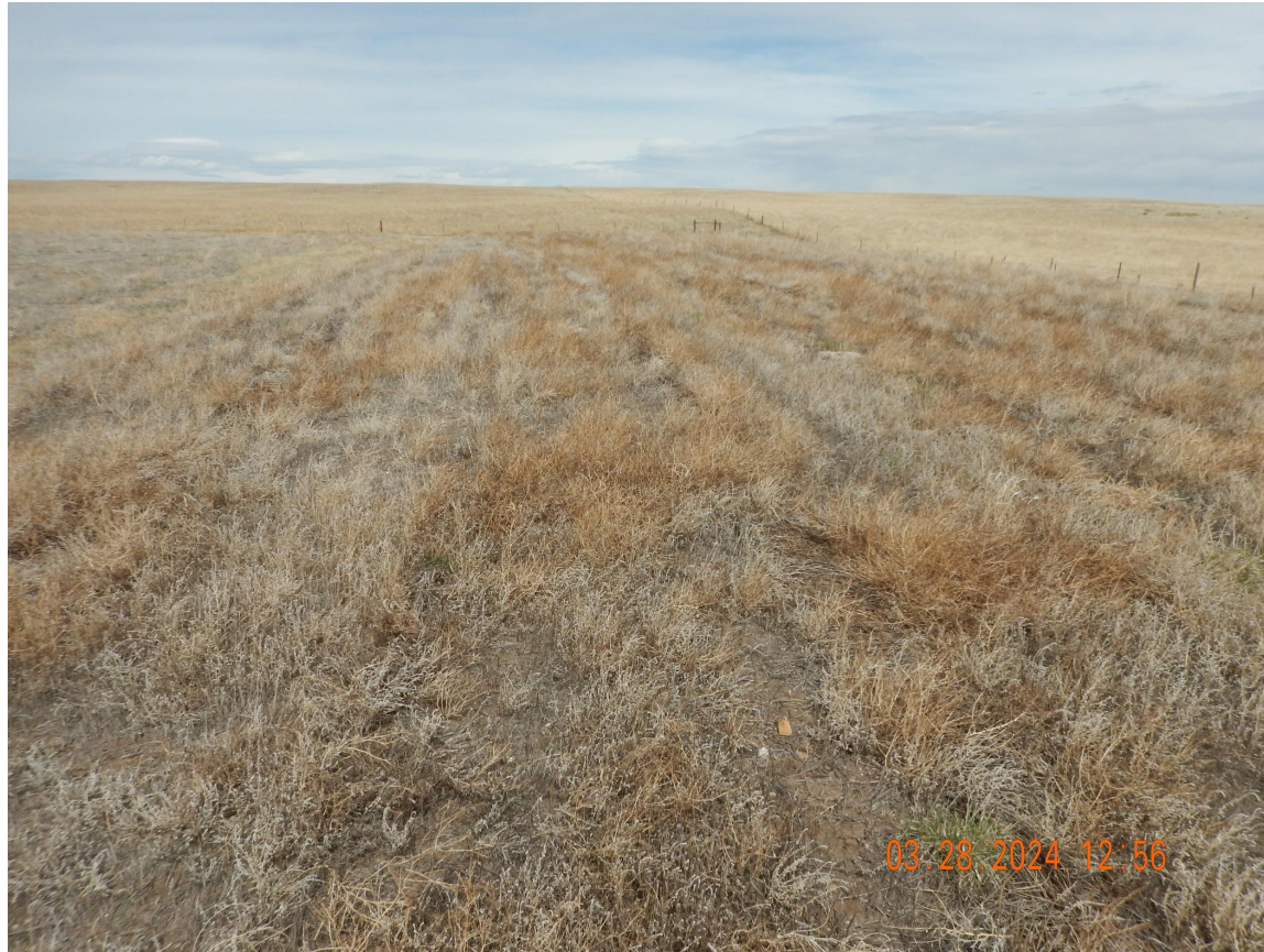
Photo 3. Photo taken from the eastern interim reclamation area along the topsoil stockpile, facing North. Photo illustrates the topsoil stockpile consists mostly of weedy, annual vegetation.