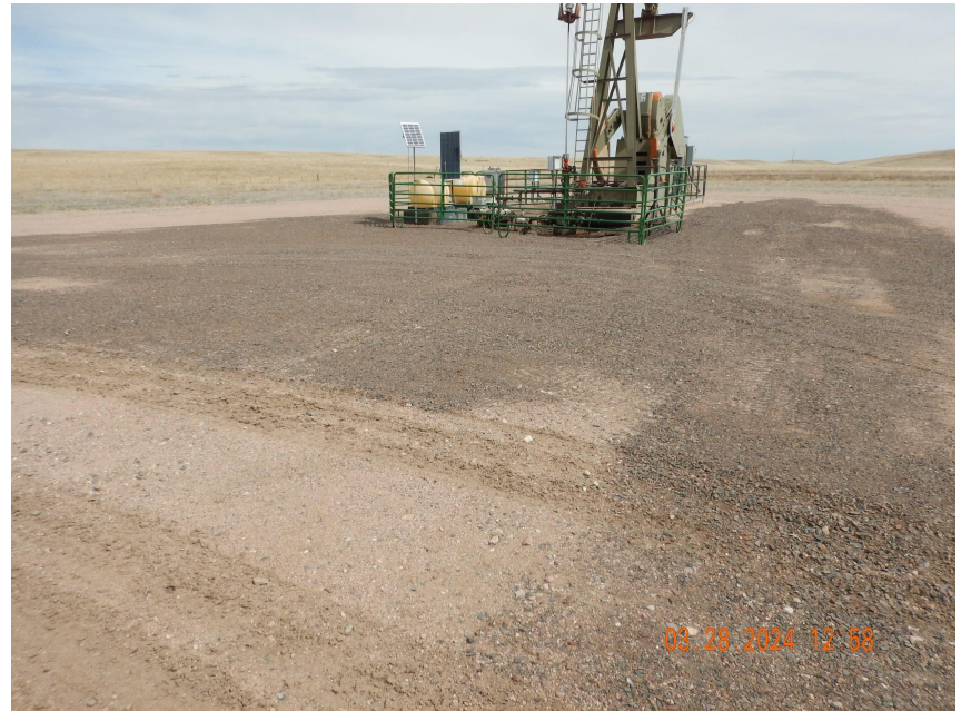
Photo 5. Photo taken from the wellhead area. ECMC staff could not confirm or deny the Operator properly disposed of stained soil outside of the green cattle guard due to importing roadbase on top of previous area.