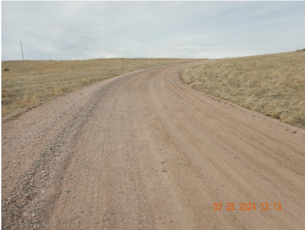
Photo 11. Photo taken along a portion of the access road, facing West. Photo illustrates rill erosion has been repaired.