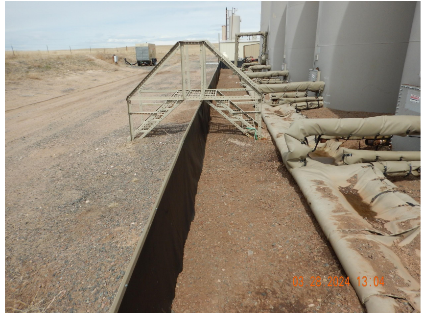
Photo 10. Photo taken from within the secondary containment. Stained soil/gravel appears to have been removed and cleaned out.

Note- the lid is missing and appears to be scattered throughout the interim reclamation areas.