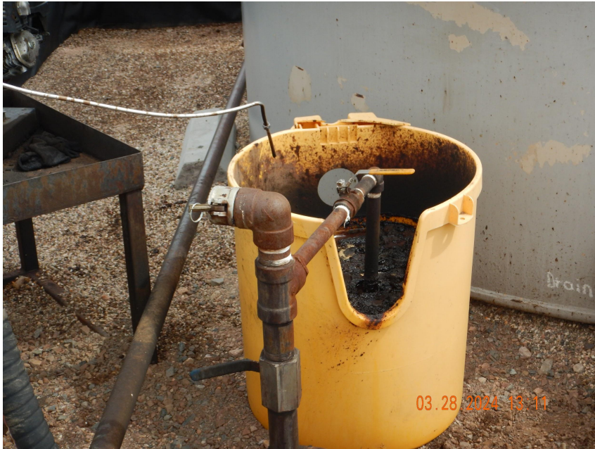
Photo 9. Photo taken from within the secondary containment. Stained soil/gravel appears to have been removed and cleaned out.

Note- the lid is missing and appears to be scattered throughout the interim reclamation areas.