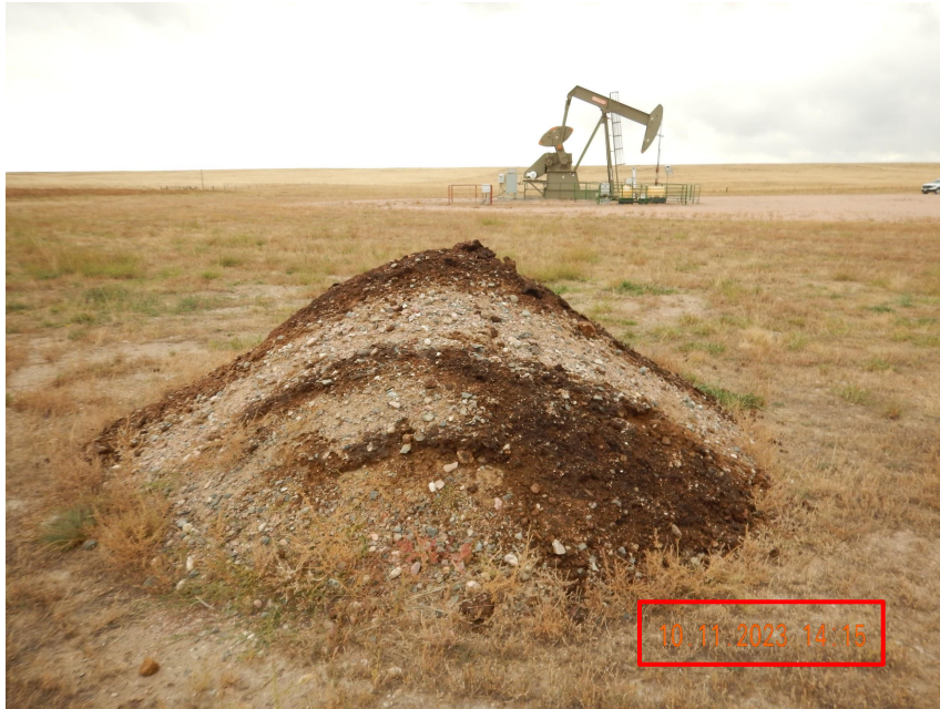
Photo 7. Photo taken from the interim reclamation area, facing South. Photo illustrates improper waste disposal and waste management.