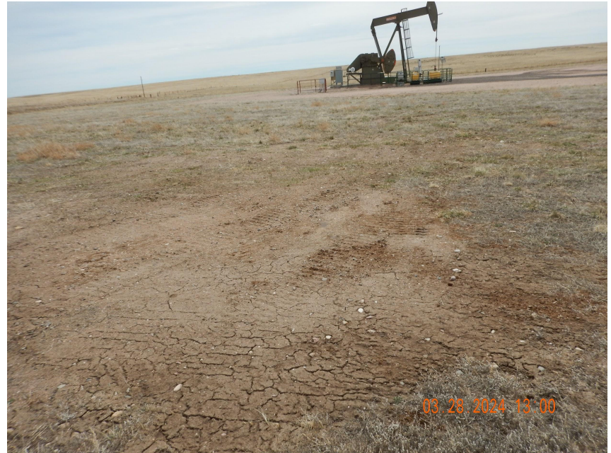
Photo 8. Photo taken from the interim reclamation area, facing South. Photo illustrates improper waste disposal and waste management appears to have been removed. Operator will be responsible for reseeding the disturbance area.