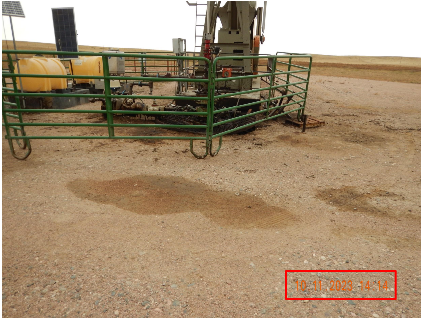
Photo 4. Photo taken from the wellhead on 10/11/2023. Photo illustrates stained soil around the wellhead and outside of the cattle guards.