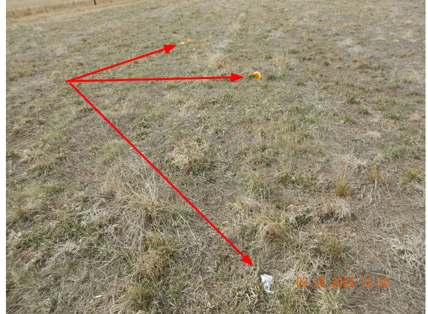
Photo 2. Photo taken from the southeastern location. See comments on Photo 1.