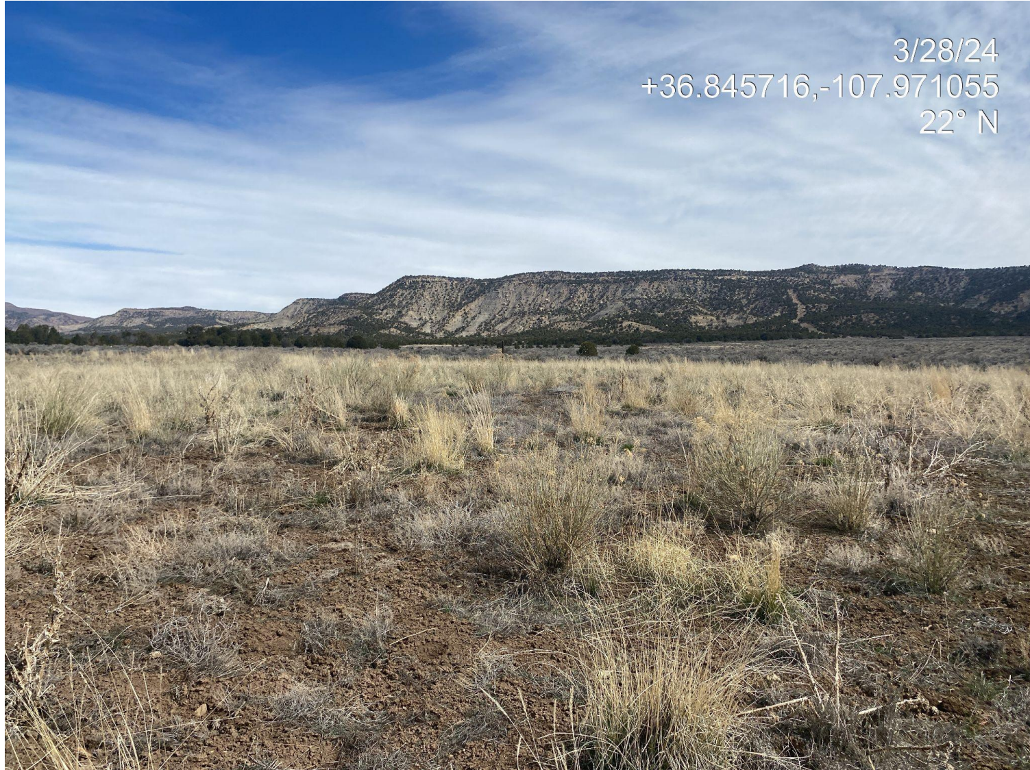
Photo 1. Overview of the disturbance taken from the southern edge facing center.