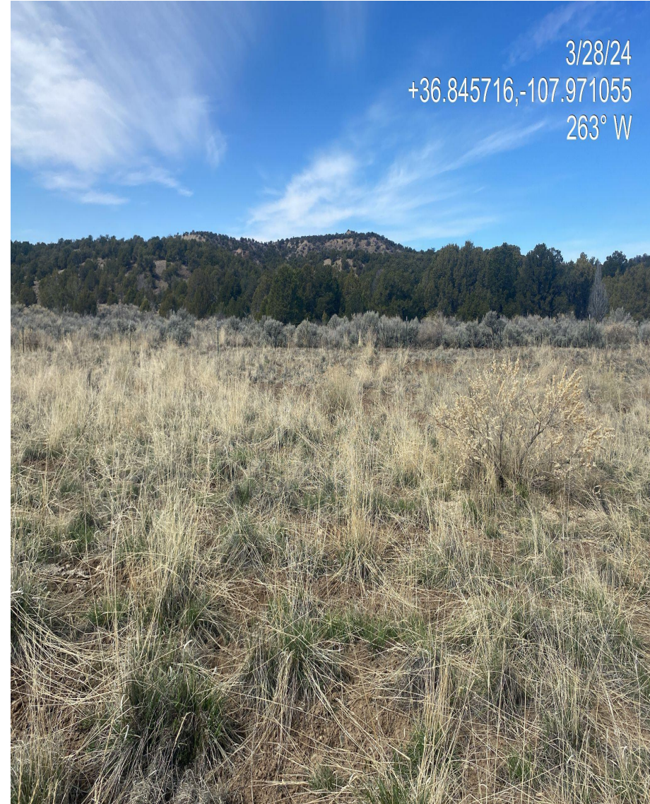
Photo 4. Cardinal photos taken from the center of the disturbance. Left photo facing south and right photo facing west. Note: project area vegetation and density appears consistent with adjacent reference area