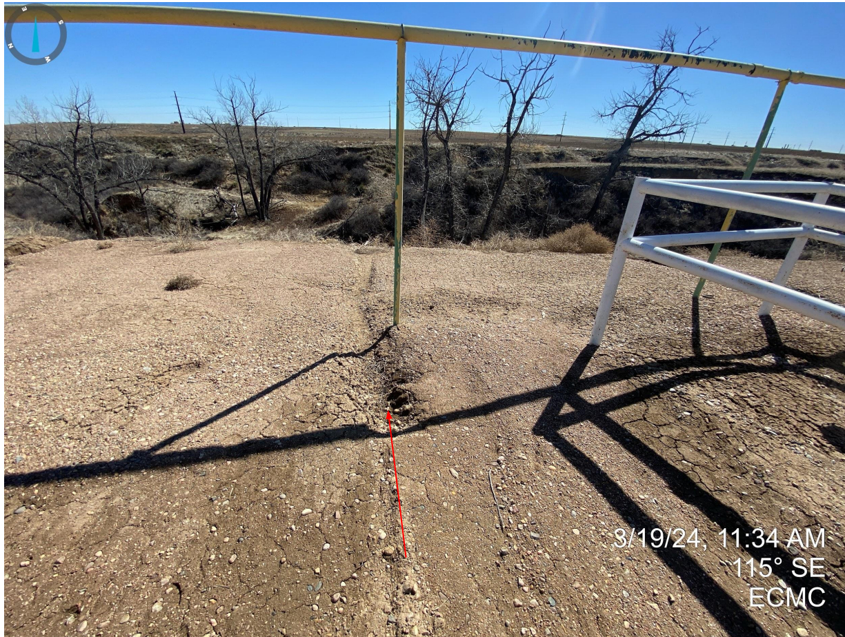
Photo 4. Taken from the eastern end of the location. Erosion degradation evident and no stormwater controls measures observed during this inspection.