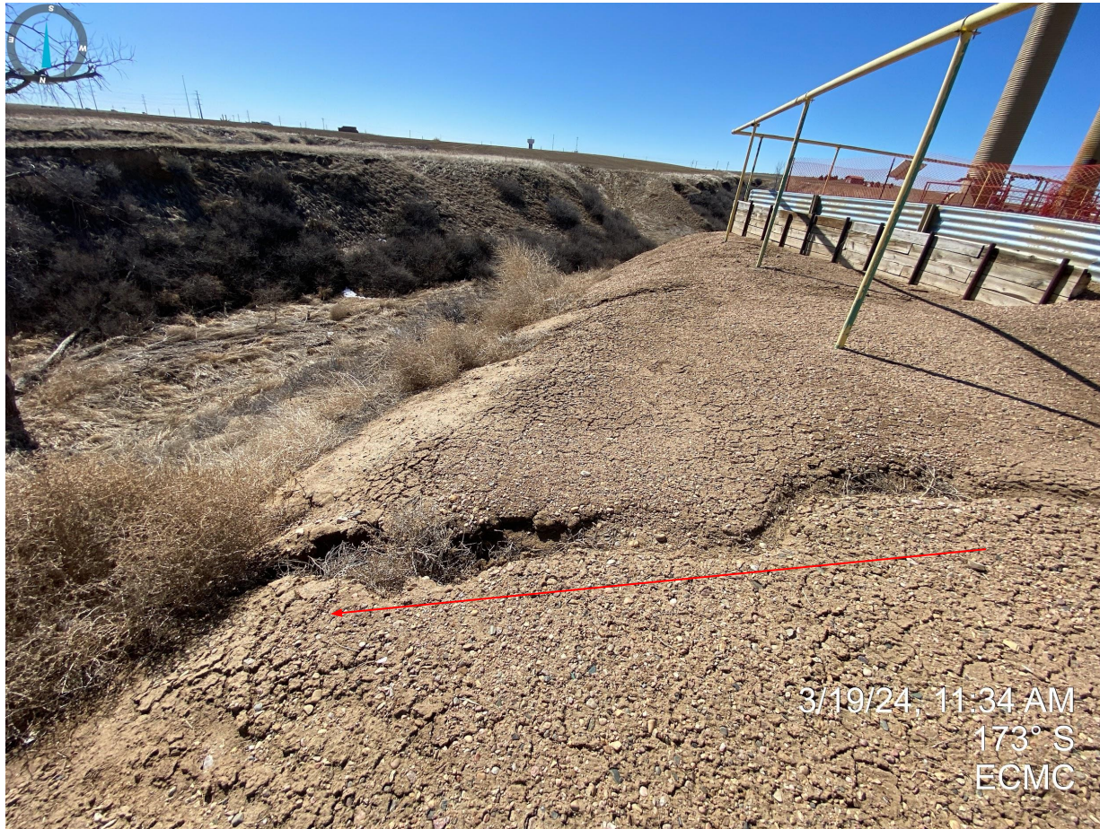
Photo 5. Continued from Photo 4, facing south.