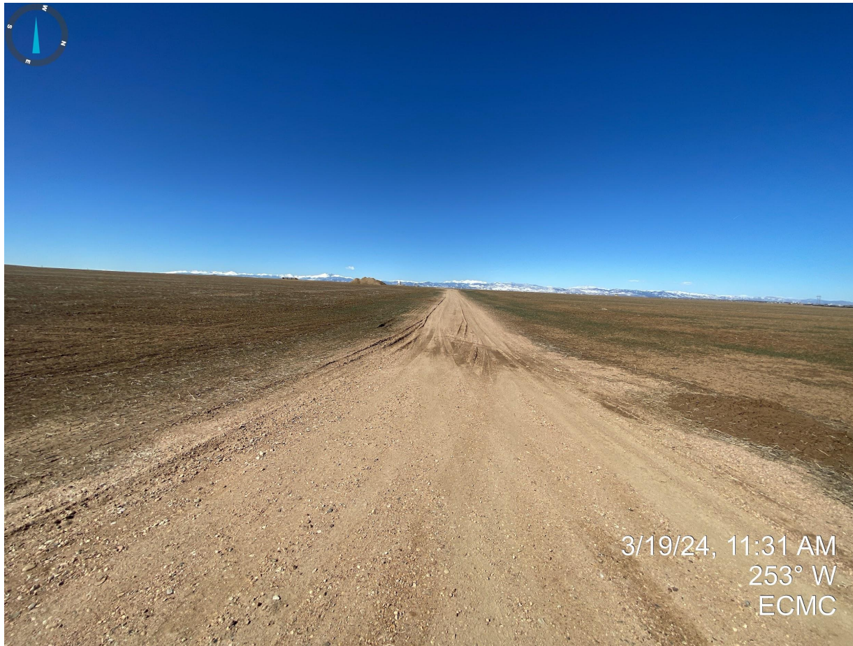
Photo 12. Taken from the access road/location, facing west. Interim reclamation activities appear to have been performed; a follow-up inspection will be conducted during the active growing season to verify vegetative compliance with Rule 1003.