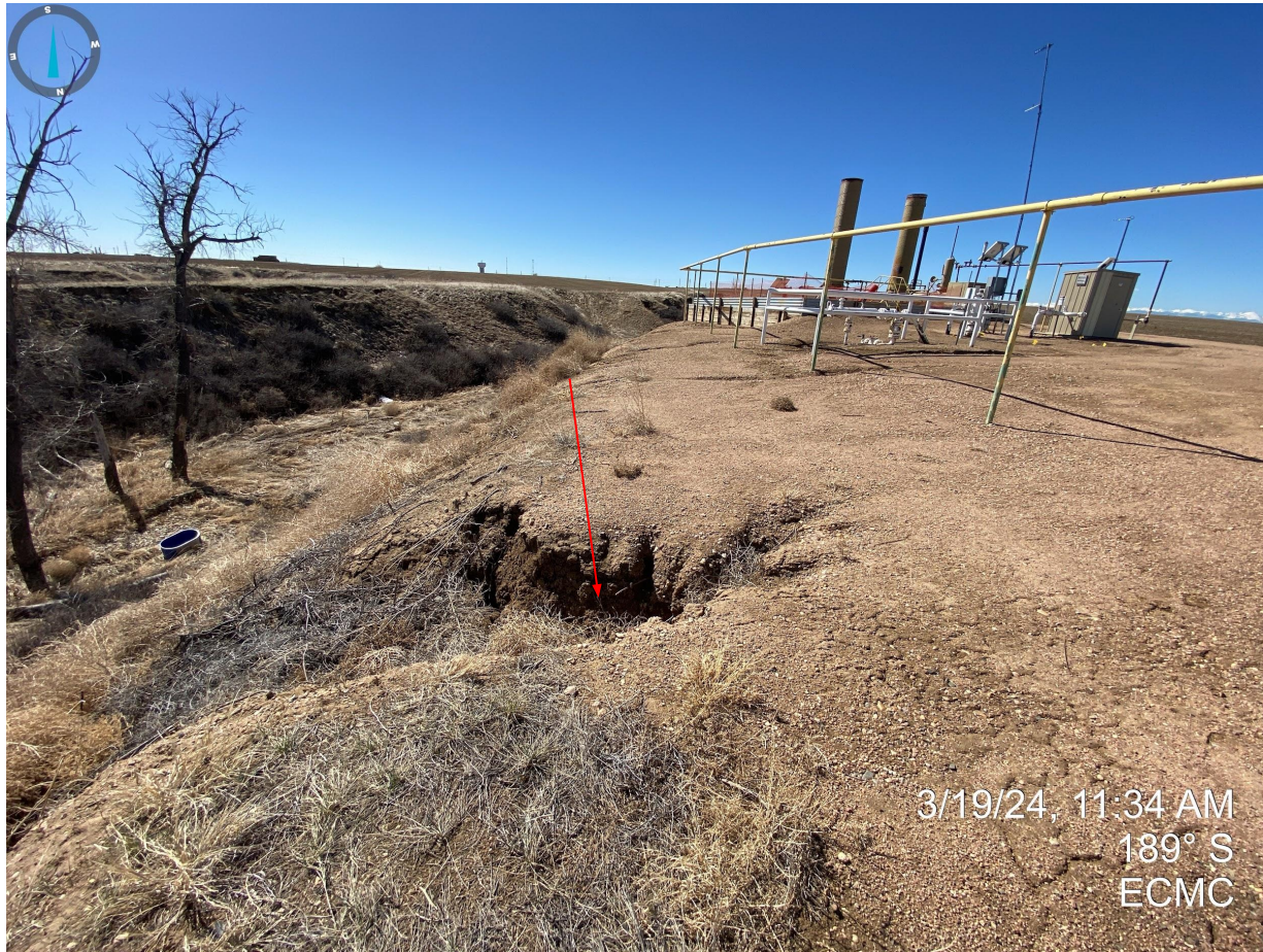
Photo 3. Continued from Photo 2, facing south.