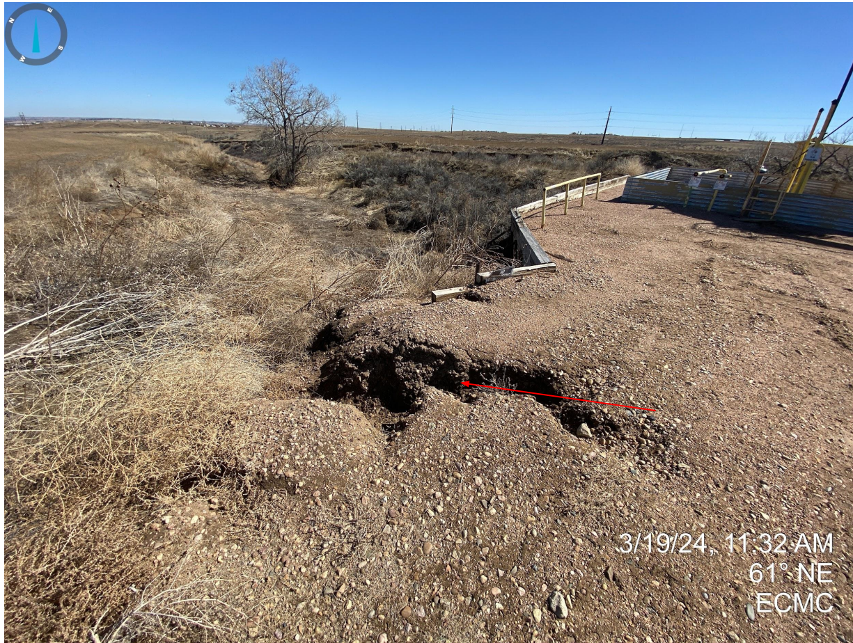
Photo 1. Taken from the northern end of the location. Erosion degradation evident and no stormwater controls measures observed during this inspection.