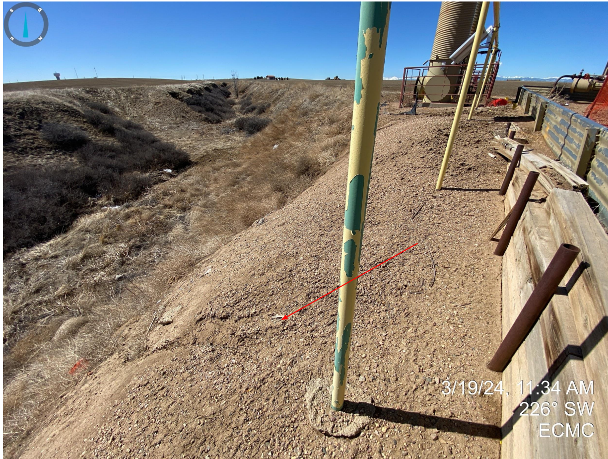
Photo 7. Taken near the southeastern corner of the location. Erosion degradation evident and no stormwater controls measures observed during this inspection.