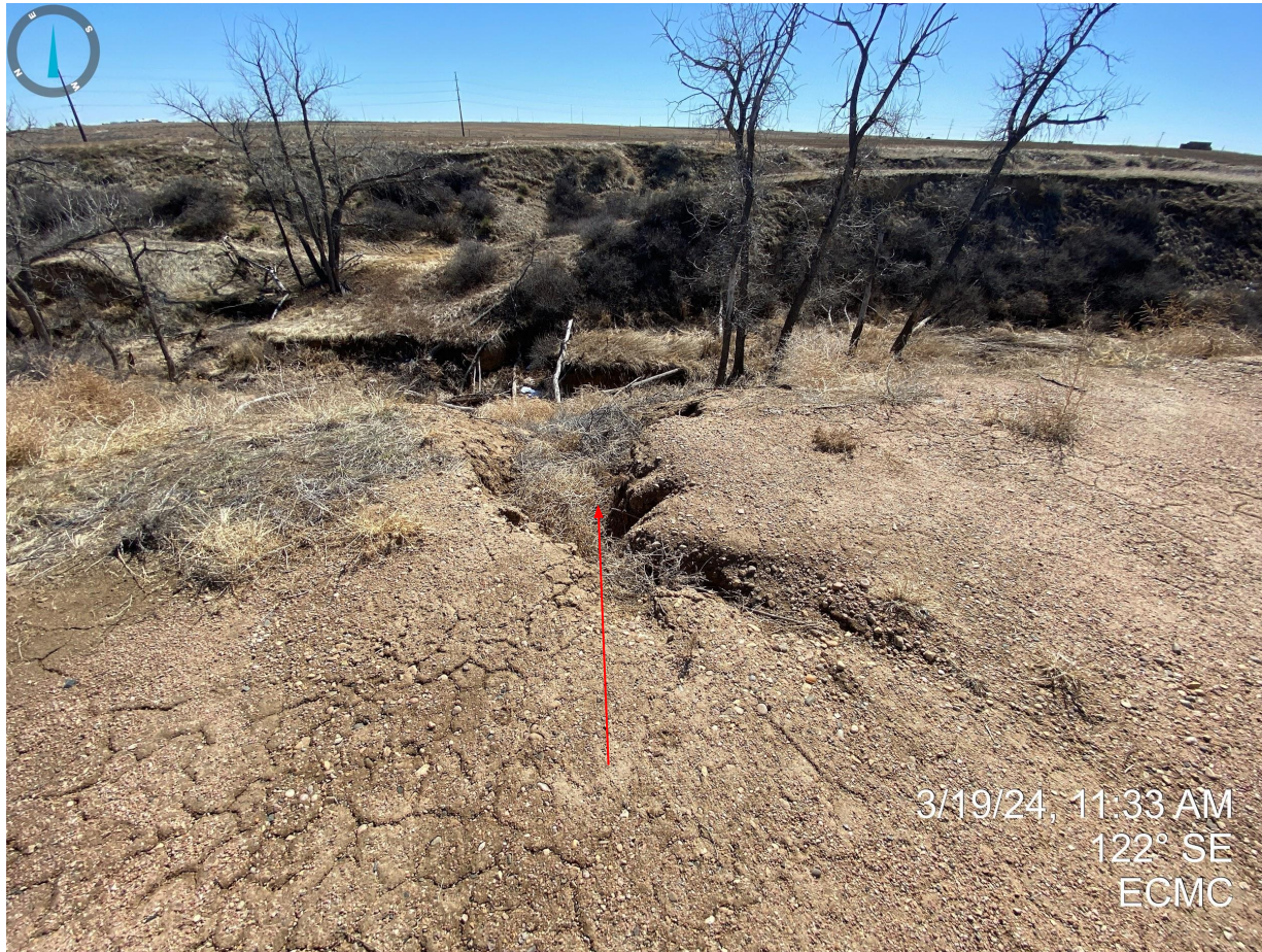
Photo 2. Taken from the eastern end of the location. Erosion degradation evident and no stormwater controls measures observed during this inspection.