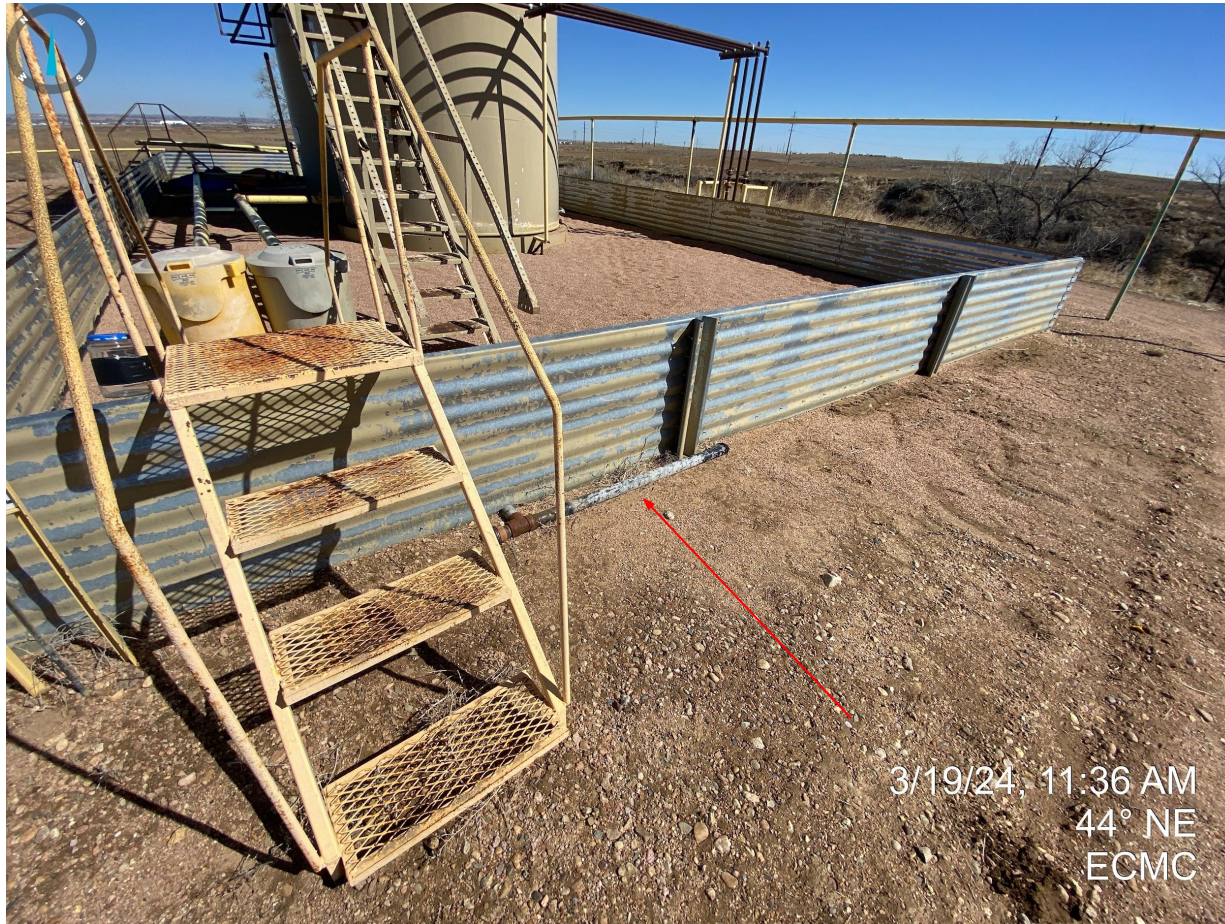
Photo 10. Unused equipment at tank battery secondary containment.