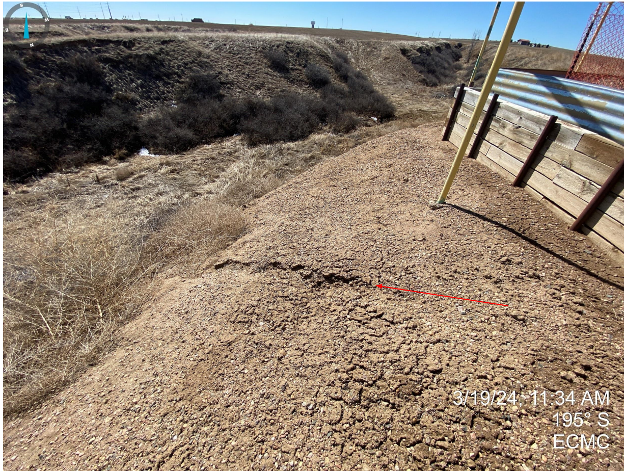
Photo 6. Taken near the southeast end of the location. Erosion degradation evident and no stormwater controls measures observed during this inspection.