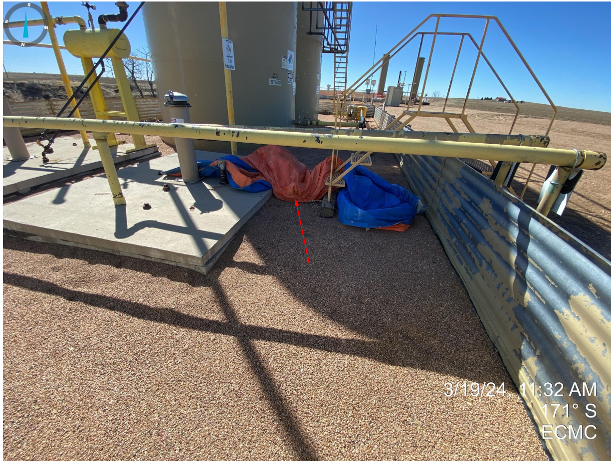
Photo 11. Unused equipment within tank battery secondary containment.