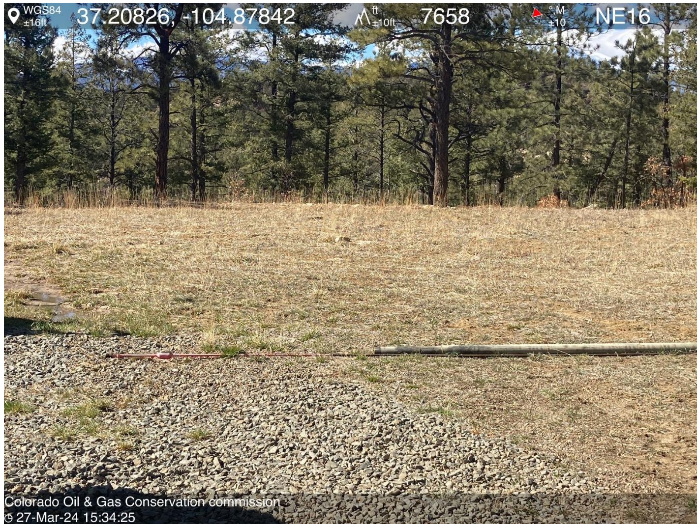
PHOTO 4: UNUSED EQUIPMENT STORED ON LOCATION (PUMP & RODS). REMOVE UNUSED EQUIPMENT PER RULE 606. CA DATE 4-27-2024.