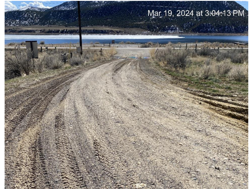
Entrance to location from Hwy 64