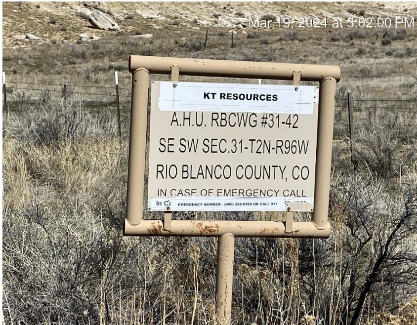
As signs are replaced additional information is required