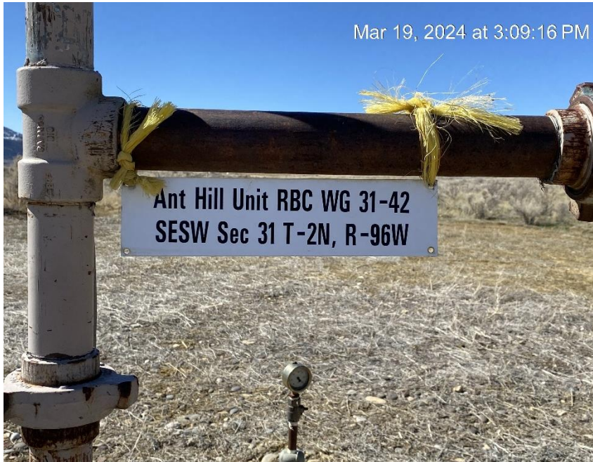
As signs are replaced additional information is required