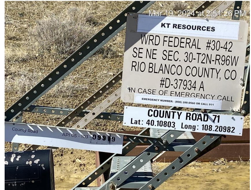
Ant Hill Unit not WRD Federal