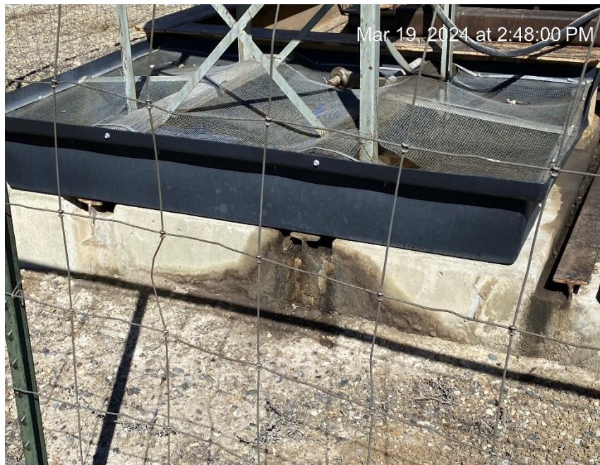
Oily waste and staining