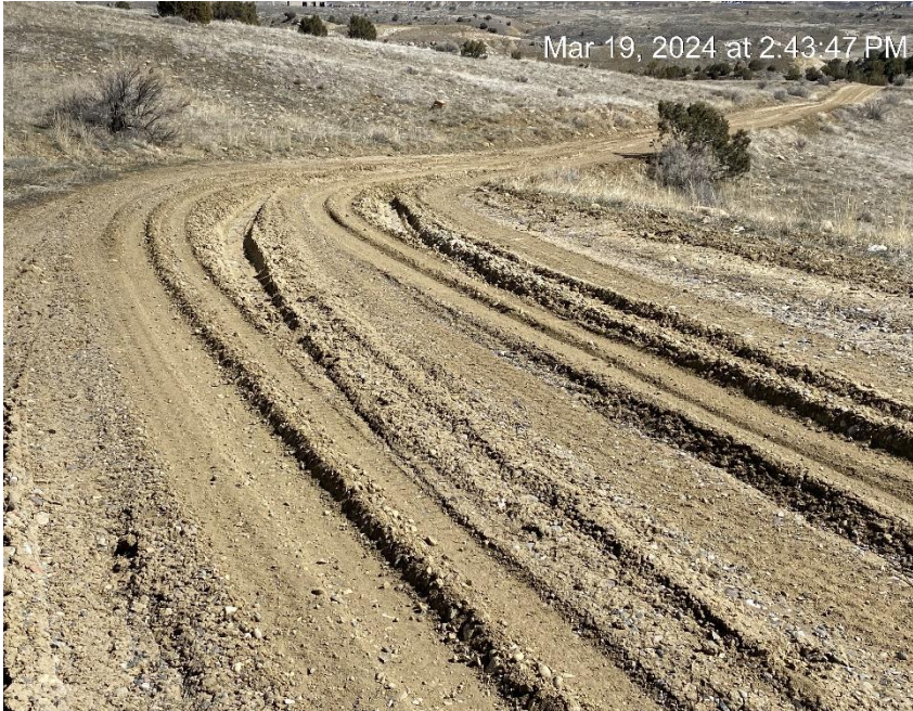
Stormwater BMPs need implementation