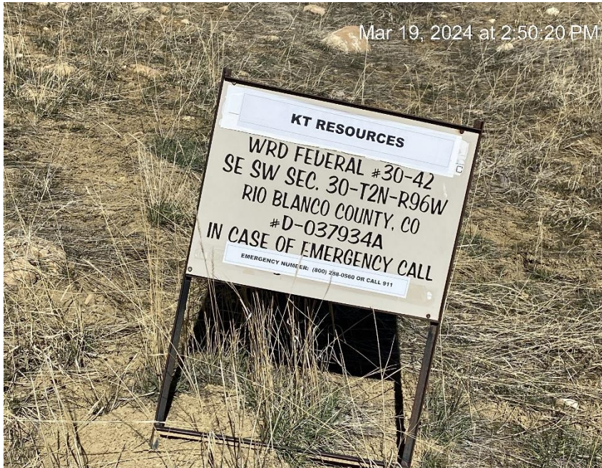
Ant Hill Unit not WRD Federal