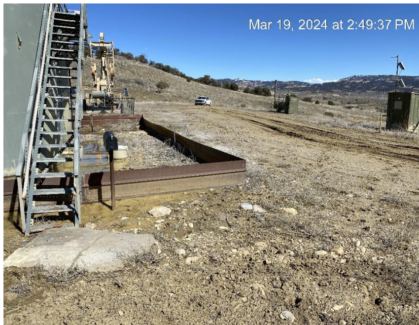
Location from Northwest corner