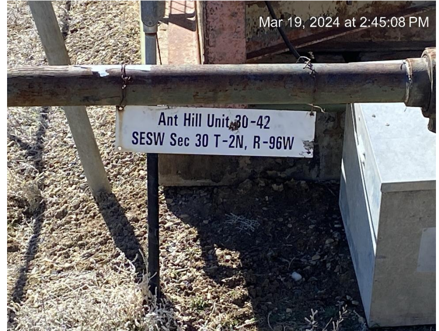
As signs are replaced additional information is required