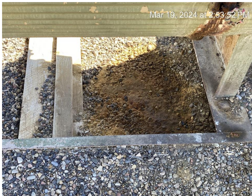
Oily waste and stained soil