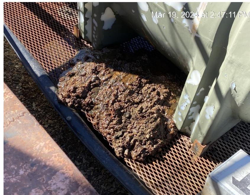
Oily waste placed on containment