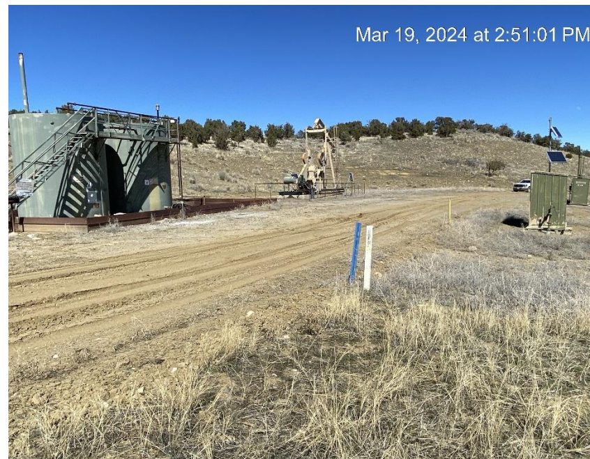
Location from Southwest corner