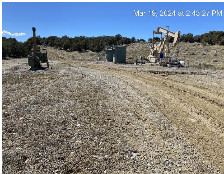
Location from Southeast corner