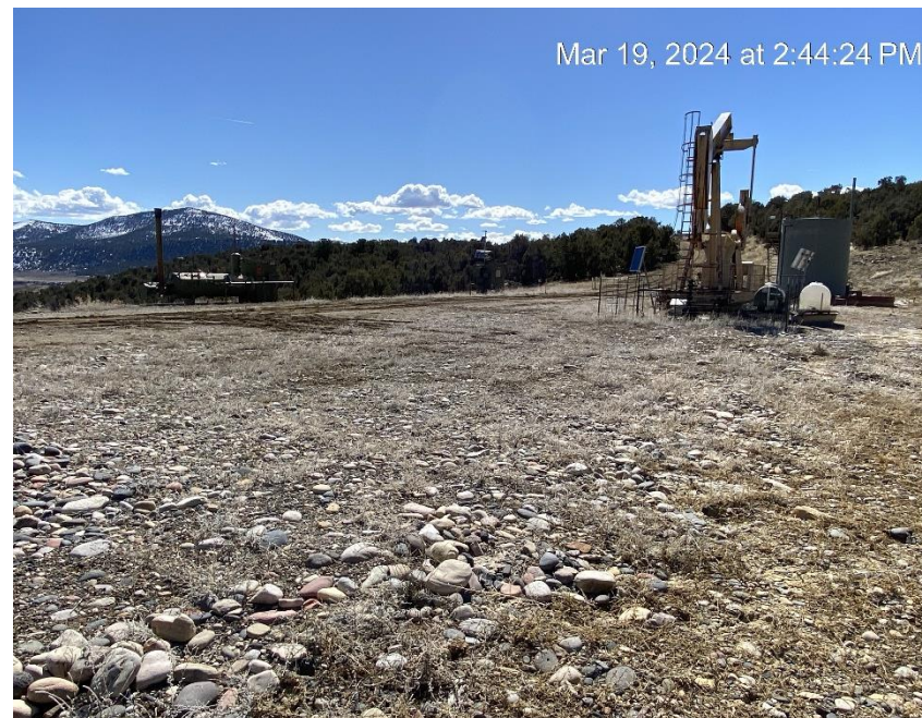
Location from Northeast corner