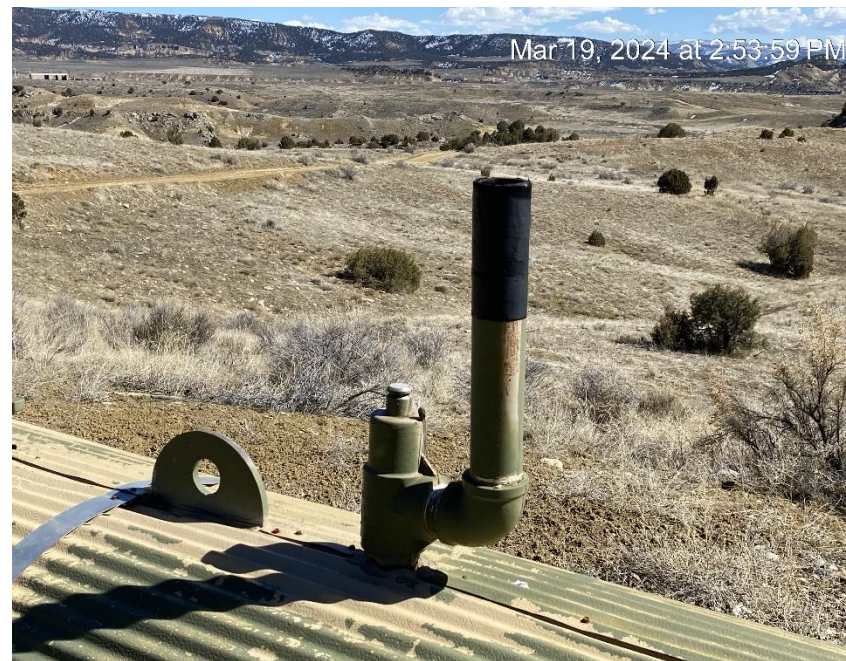
Rain protection missing on relief riser