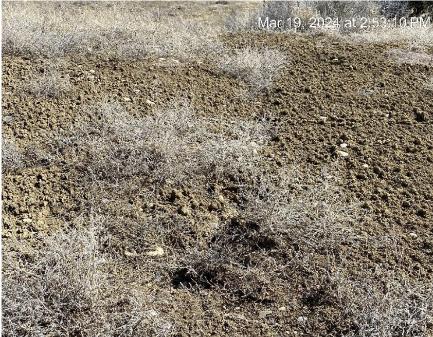
Erosion and sediment migration