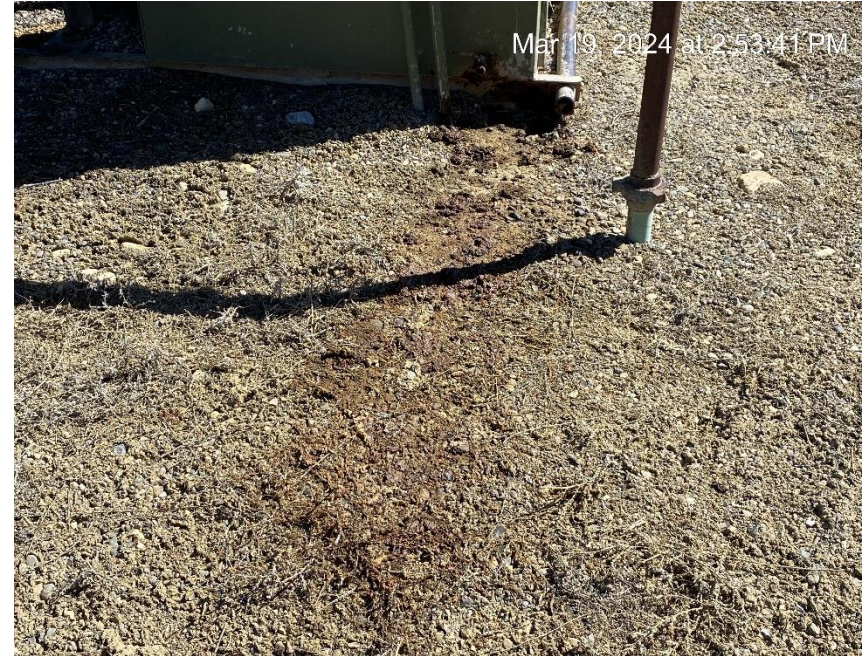
Oily waste blown out of separator