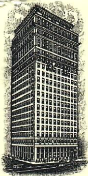
HOME OFFICE BUILDING