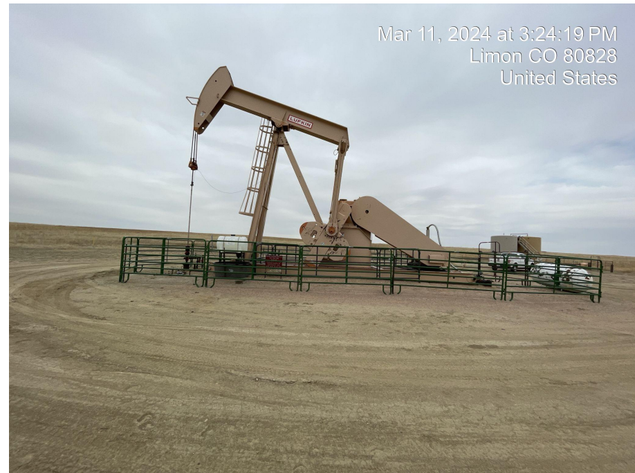
Photo 2. Photo taken facing east of wellhead.