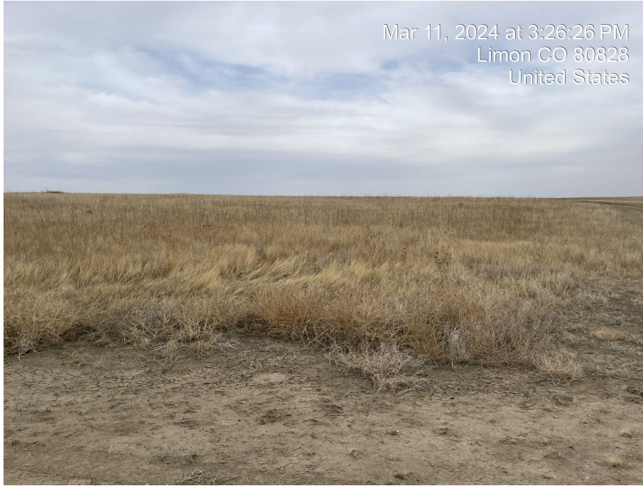
Photo 11. Photo taken facing north of tank battery pad, weeds (kochia).