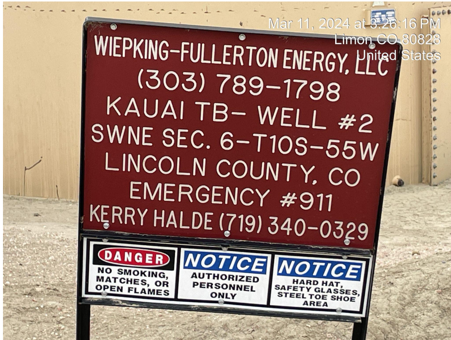
Photo 11. Photo taken facing east of tank battery sign