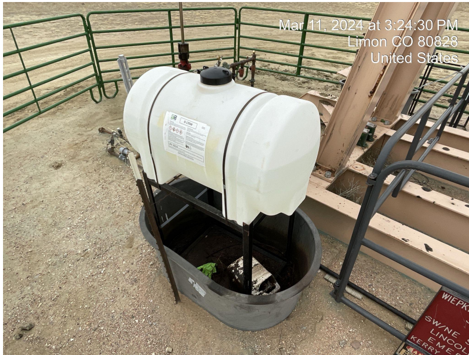
Photo 3. Photo taken facing west of secondary containment without wildlife protection.