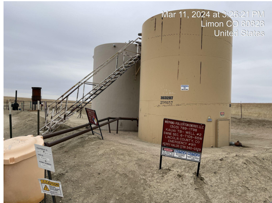
Photo 12. Photo taken facing east of tank battery.