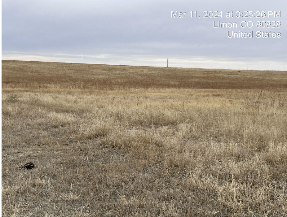
Photo 7. Photo taken facing southeast of vegetation in the interim reclamation area.