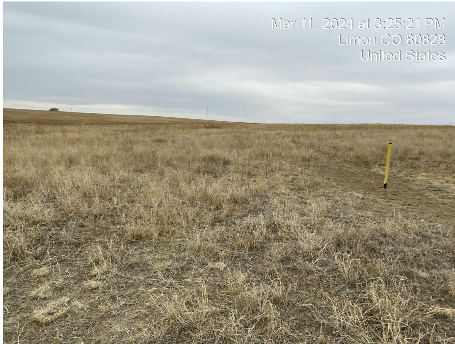
Photo 5. Photo taken facing east of vegetation in the interim reclamation area.