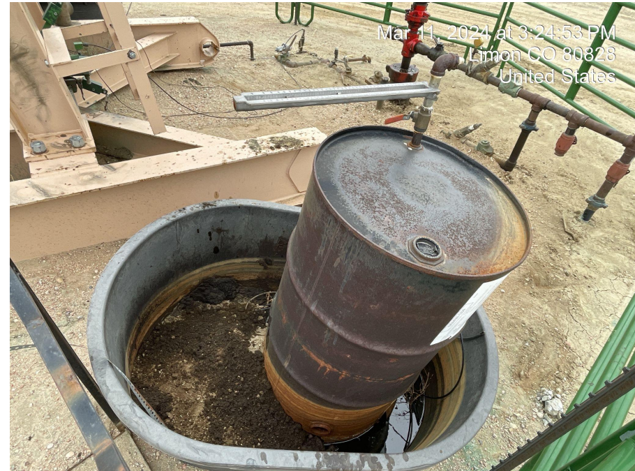
Photo 4. Photo taken facing north of secondary containment without wildlife protection.