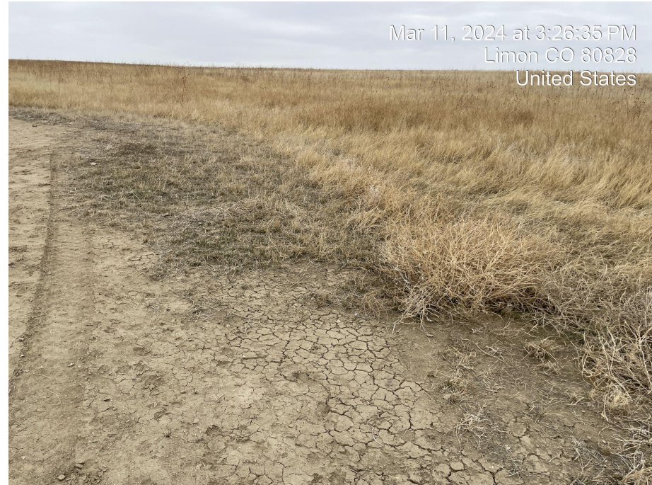
Photo 12. Photo taken facing west of tank battery pad, weeds (kochia).