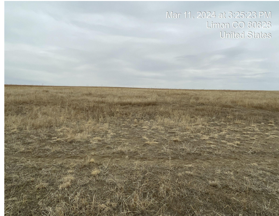
Photo 6. Photo taken facing east of vegetation in the interim reclamation area.