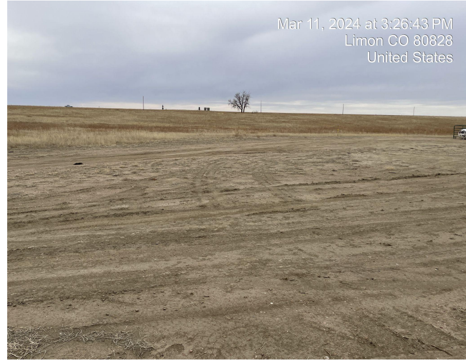
Photo 8. Photo taken facing southeast of vegetation in the interim reclamation area.