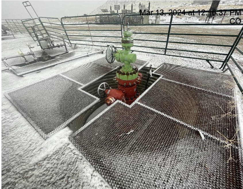
Photo # 9774 Cellar cover not properly installed/wildlife & personnel hazard