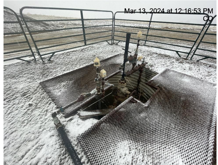
Photo # 9775 Cellar cover not properly installed/wildlife & personnel hazard