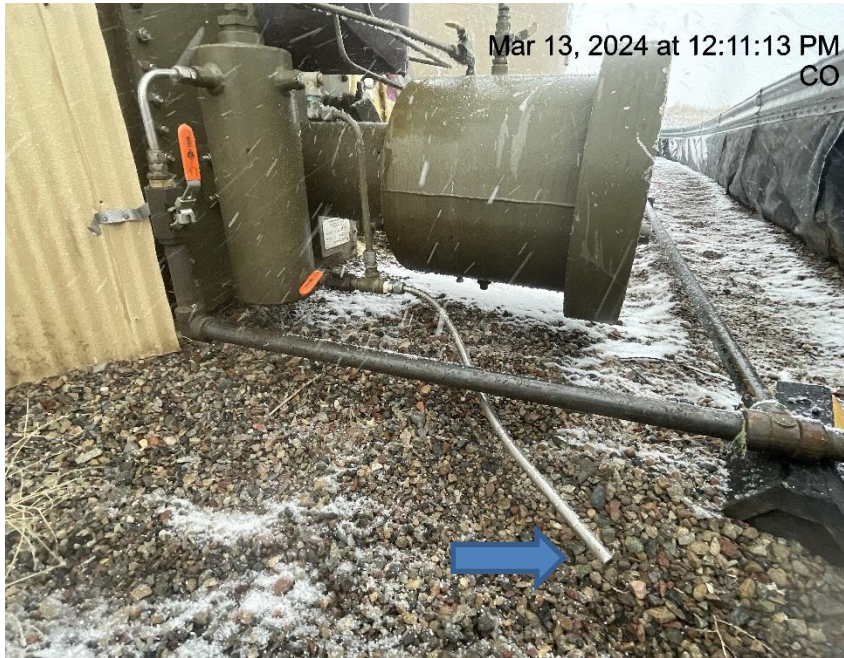
Photo # 9772 PRV vent line does not comply with CECMC pressure safety device rules & also terminates in an unsafe manner.