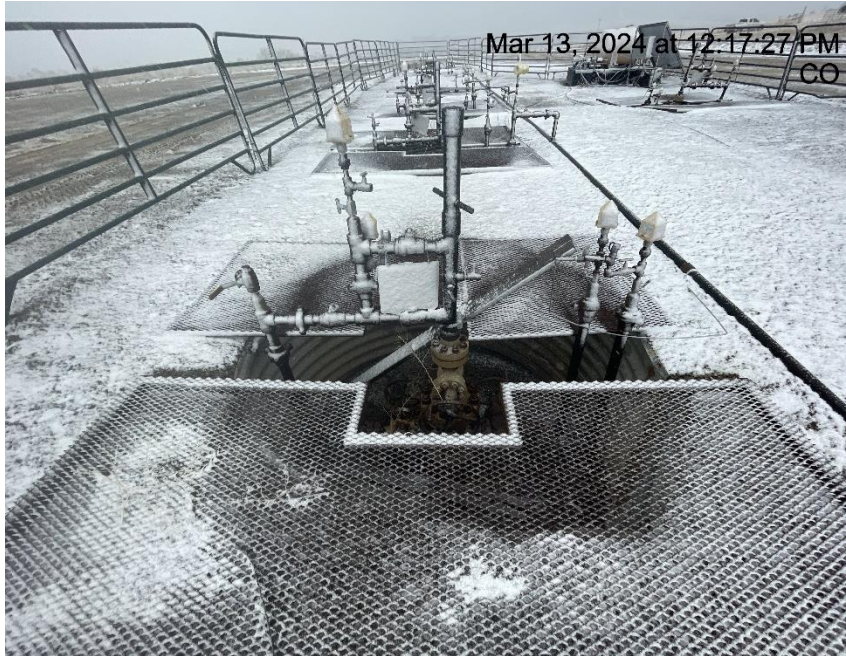
Photo # 9776 Cellular cover not properly installed/wildlife & personnel hazard