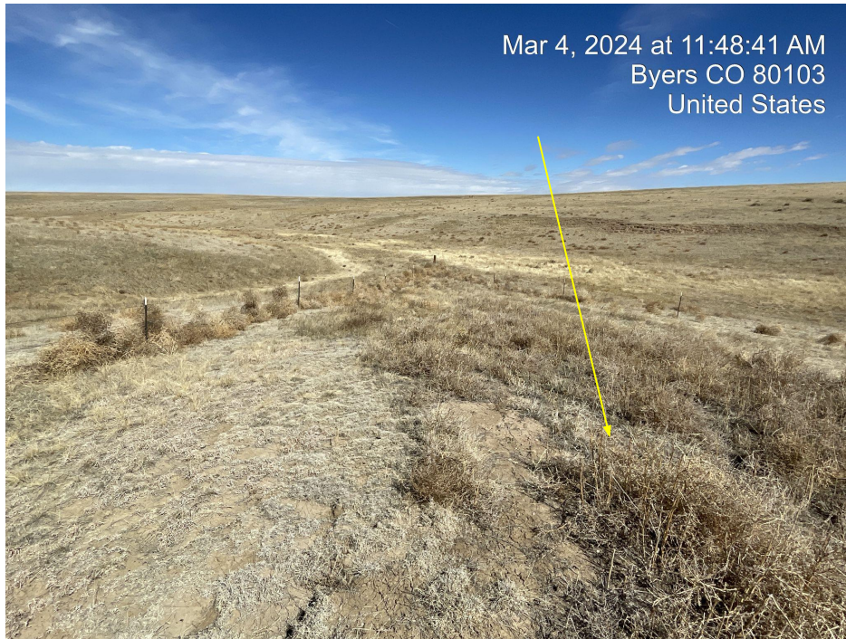
Photo 9. Photo taken facing northeast of pad reclamation area of vegetation and weeds (russian thistle & kochia). Weeds indicated by yellow arrow.