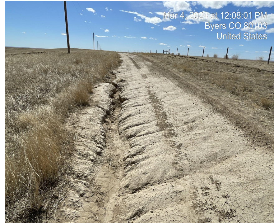
Photo 17. Photo taken facing northwest of rutted access road with stormwater erosion.