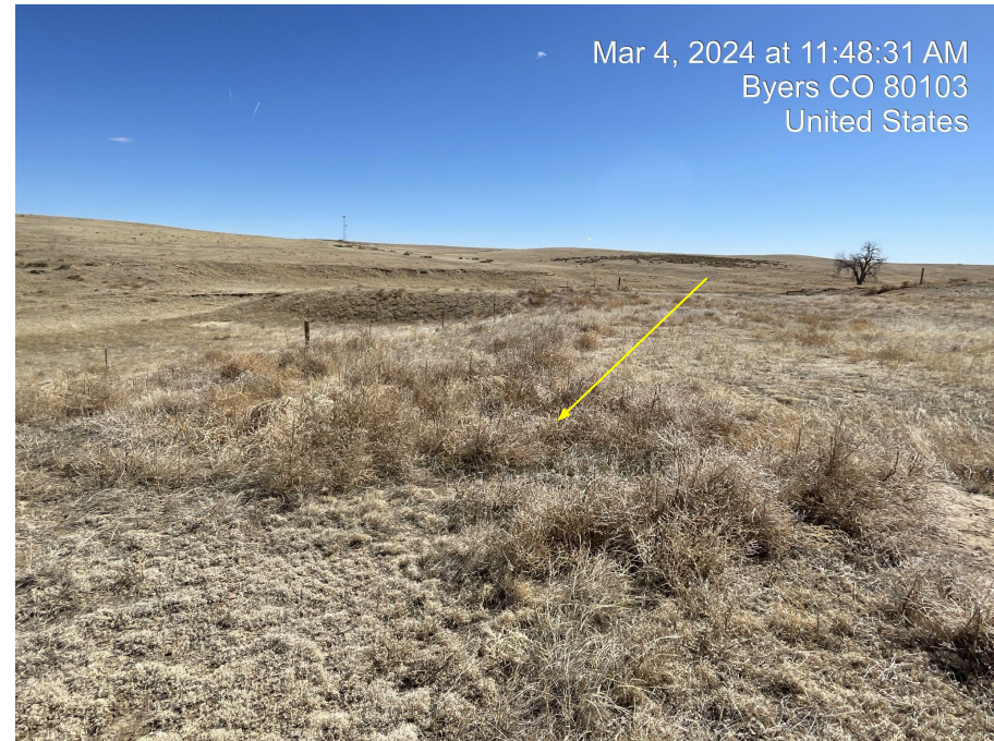
Photo 6. Photo taken facing east of reclamation area of vegetation and weeds (russian thistle & kochia). Weeds indicated by yellow arrow.