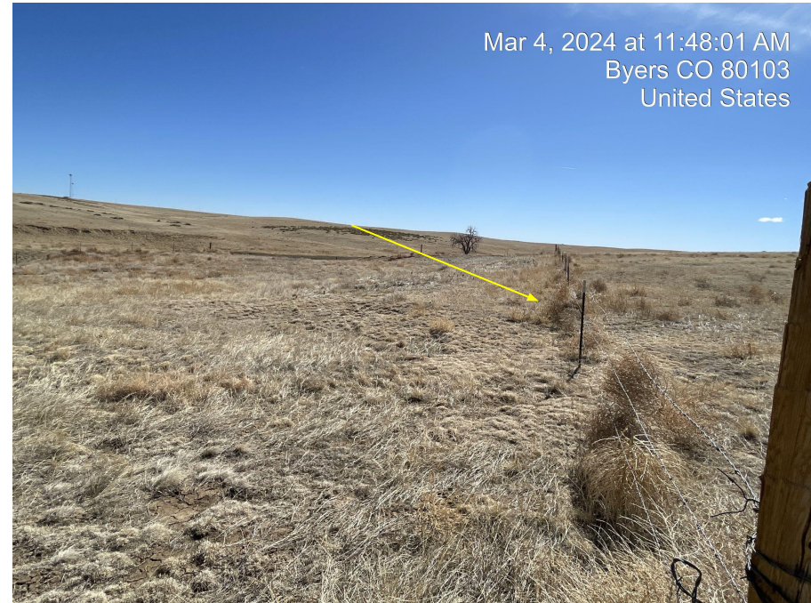
Photo 4. Photo taken facing south of pad reclamation area of vegetation and weeds (Russian thistle & Kochia). Weeds indicated by yellow arrow.