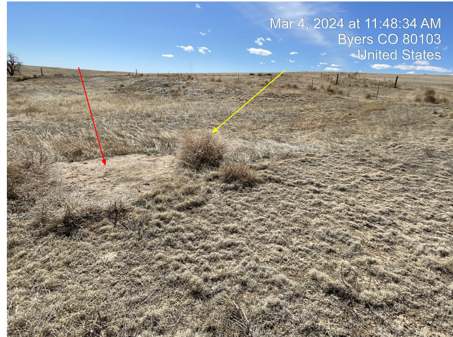
Photo 8. Closer view of bare area, Photo taken facing southwest of pad reclamation area of vegetation, weeds (russian thistle & kochia) and bare soil. Weeds indicated by yellow arrow, bare soil indicated by red arrow.