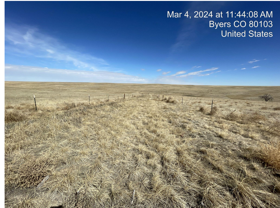
Photo 2. Photo taken facing west of reclaimed access road.