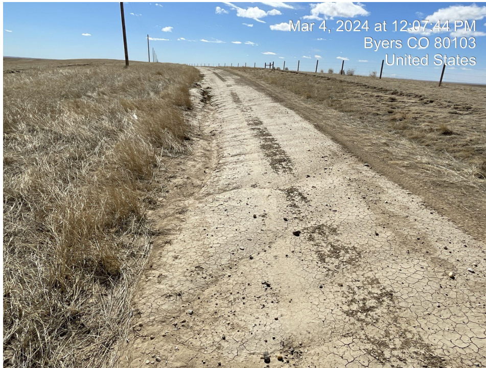
Photo 16. Photo taken facing southwest of rutted access road with stormwater erosion.