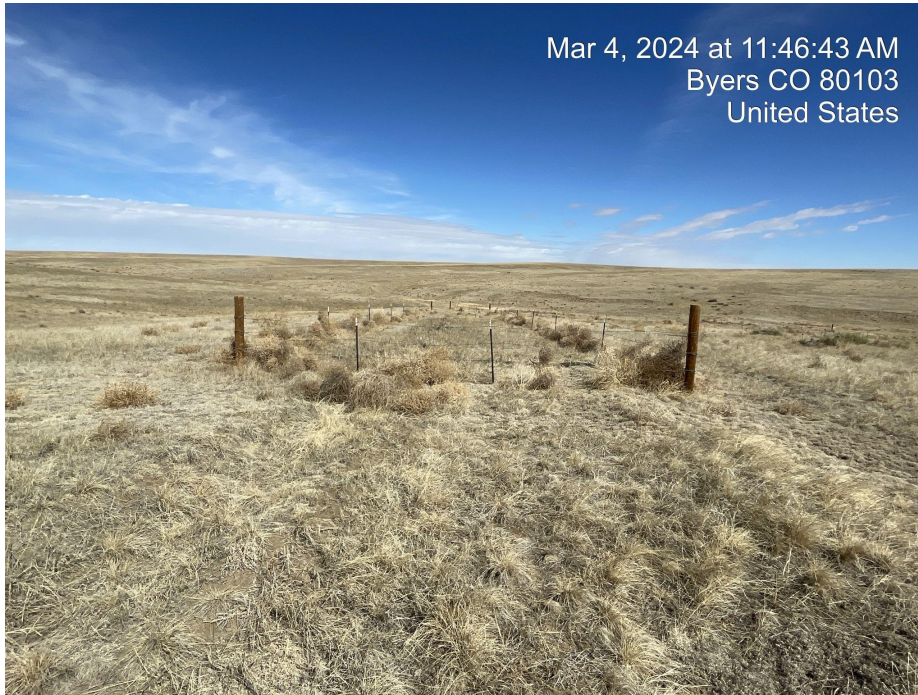
Photo 3. Photo taken facing west of reclaimed access road and weed debris in the fence.