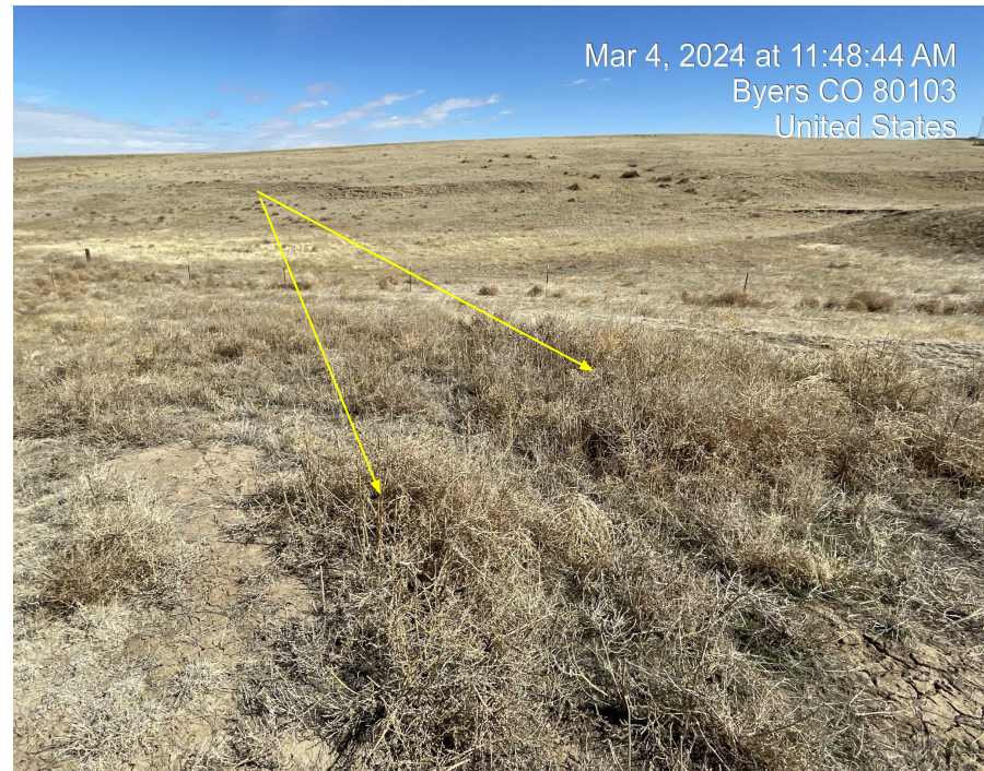
Photo 10. Photo taken facing east of reclamation area of vegetation and weeds (russian thistle & kochia). Weeds indicated by yellow arrow.