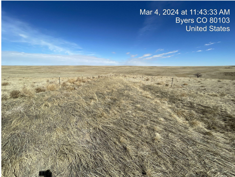
Photo 1. Photo taken facing west of reclaimed access road.