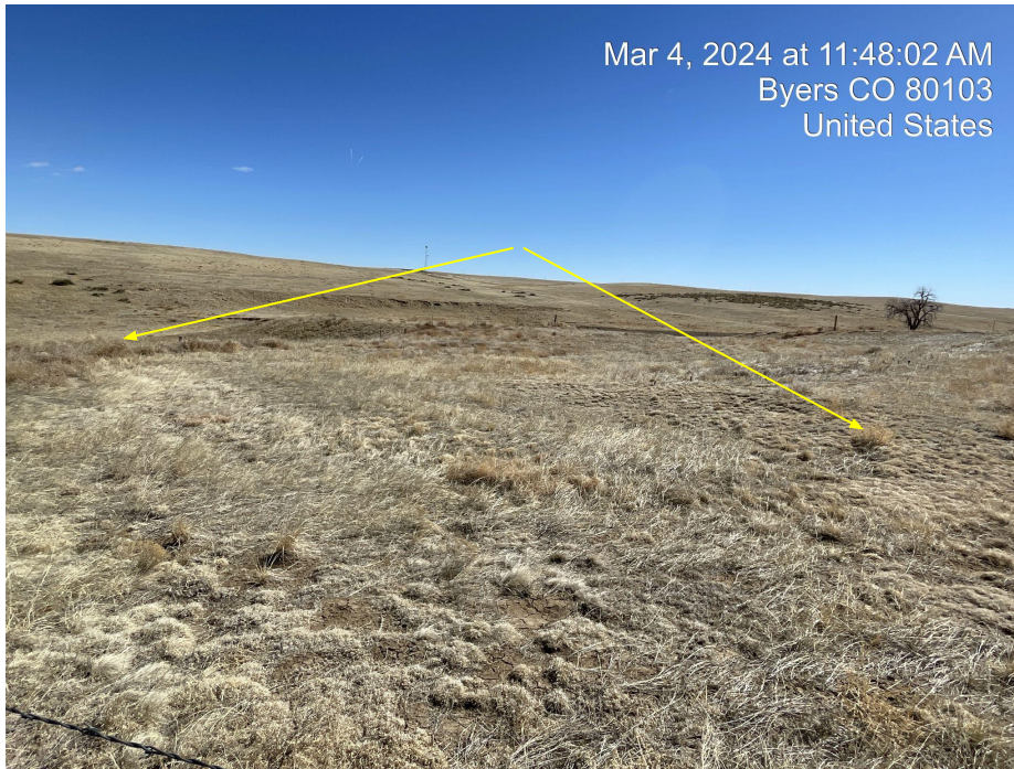
Photo 5. Photo taken facing southeast of pad reclamation area of vegetation and weeds (russian thistle & kochia). Weeds indicated by yellow arrow.