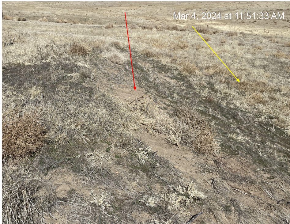
Photo 11. Photo taken facing north of pad reclamation area of vegetation and weeds (russian thistle & cheatgrass) and bare soil. Weeds indicated by yellow arrow, bare soil indicated by red arrow.