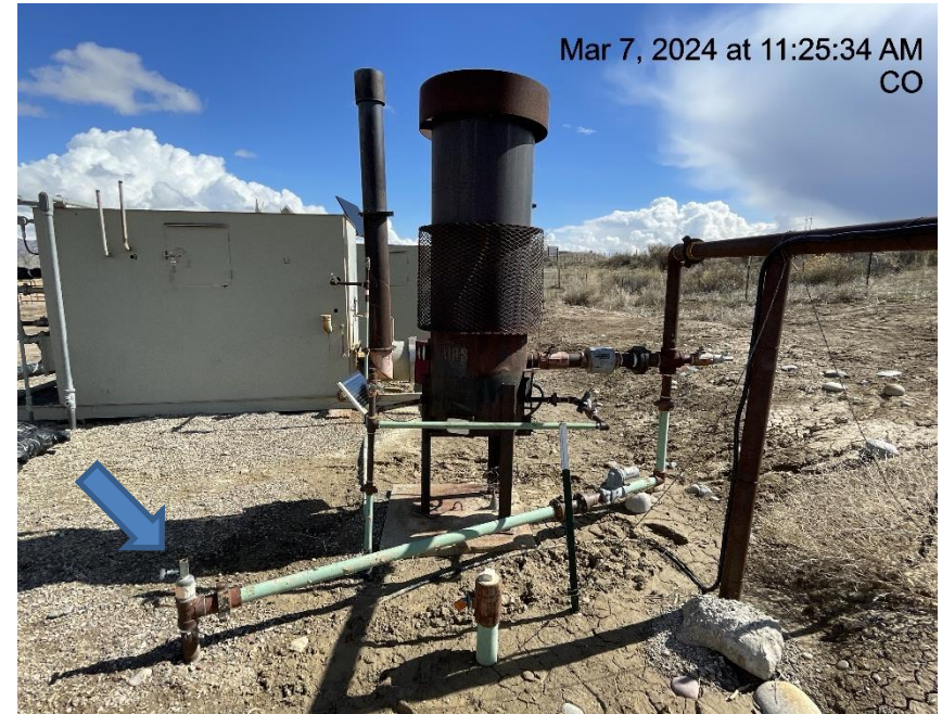
Photo # 9053 Gypsum Ranch A1 well bradenhead line tied into ECD/No Form 4 Sundry