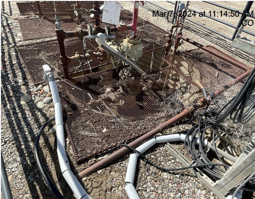
Photo # 9052 Gypsum Ranch A1 well bradenhead line tied into ECD/No Form 4 Sundry