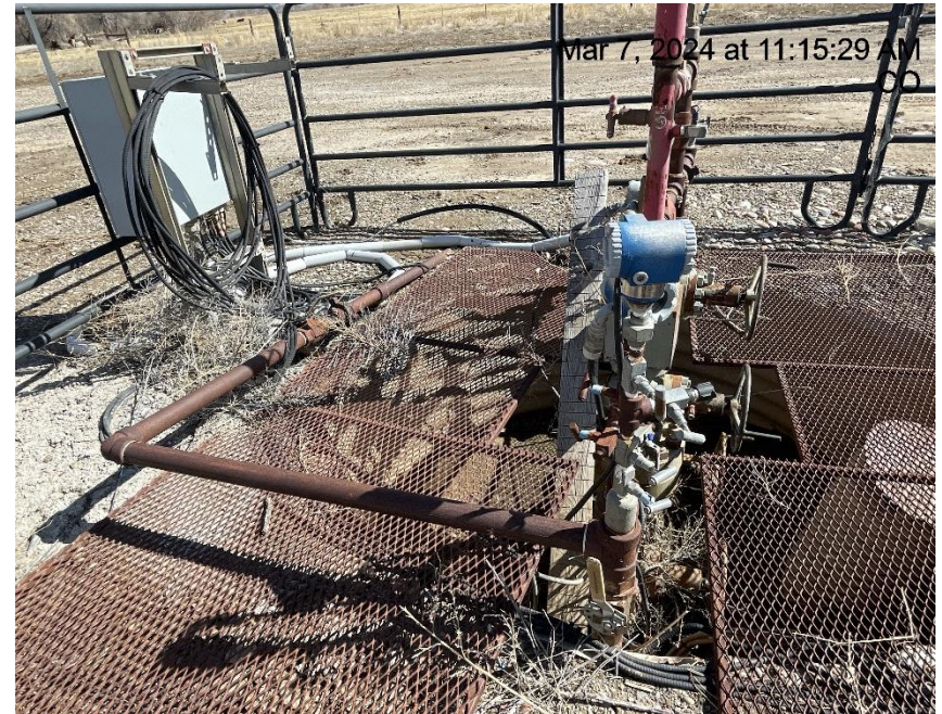
Photo # 9051 Gypsum Ranch A1 well bradenhead line tied into ECD/No Form 4 Sundry