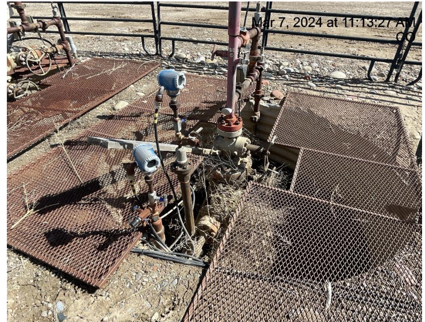
Photo # 9059 Cellar not properly covered/wildlife & personnel hazard