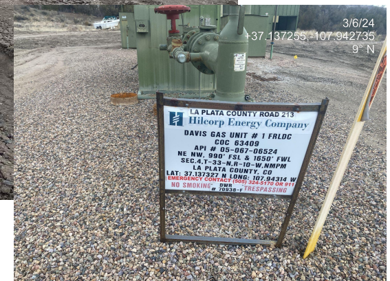
Photo 1. Overview of the disturbance taken from the entrance facing center.