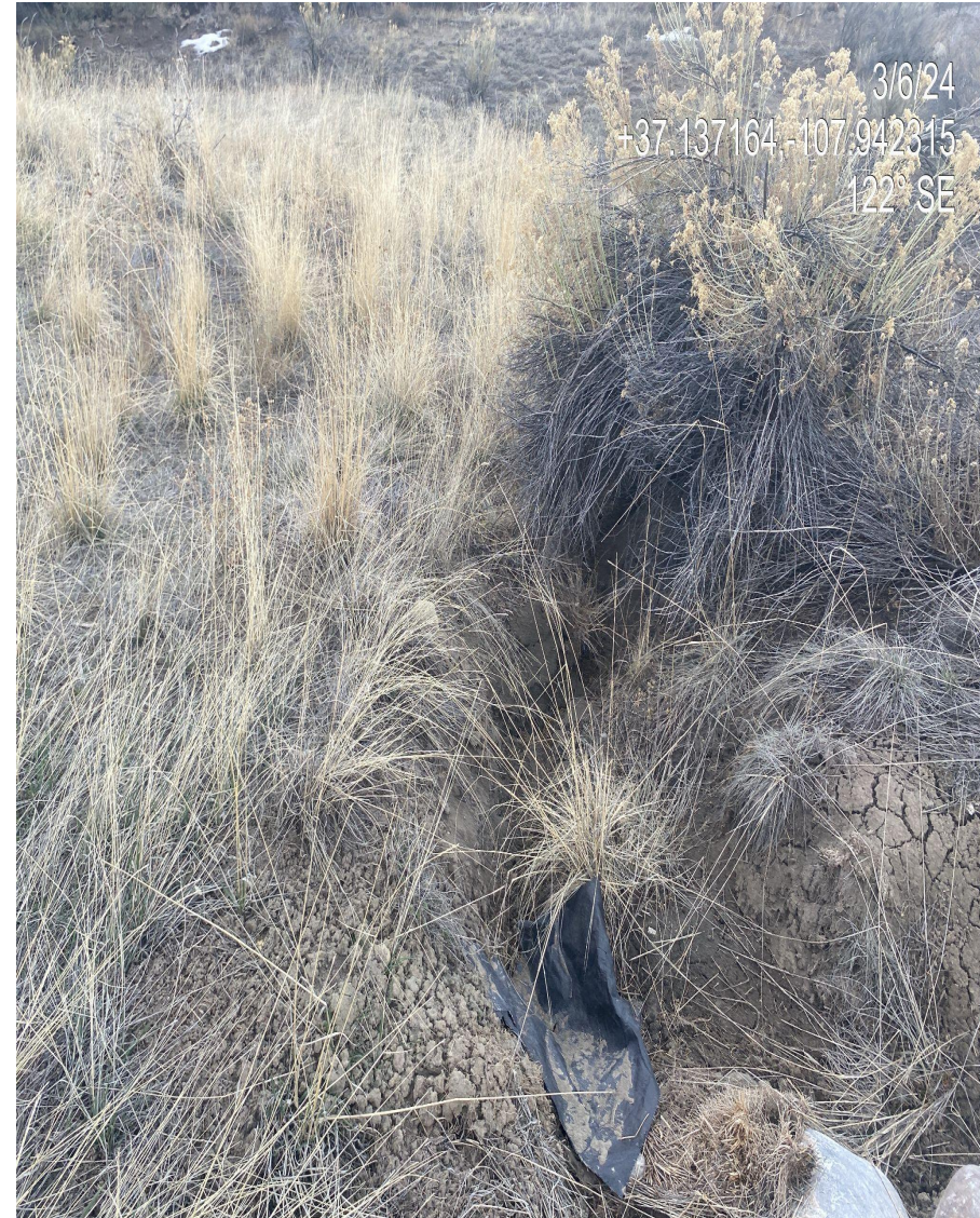
Photo 3. View of additional stormwater BMPs in the eastern interim reclamation area that are inadequate and have not been installed per good engineering practices. Rill and gully erosion forming down hill of the BMPs.