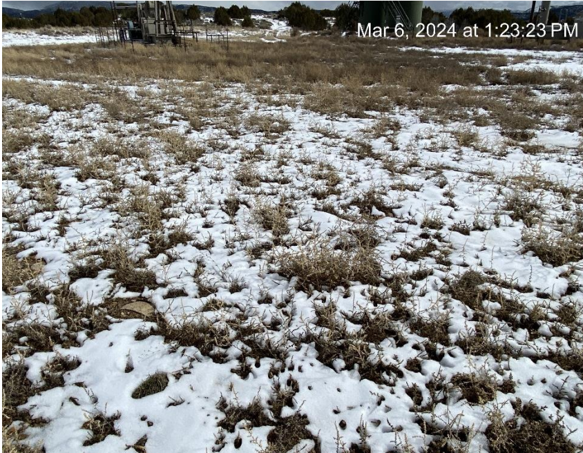
Previous year weed growth