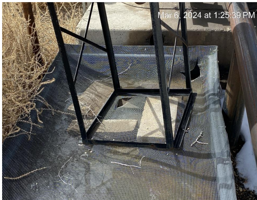
Wildlife protection inadequate