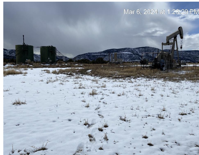
Location from Northeast corner