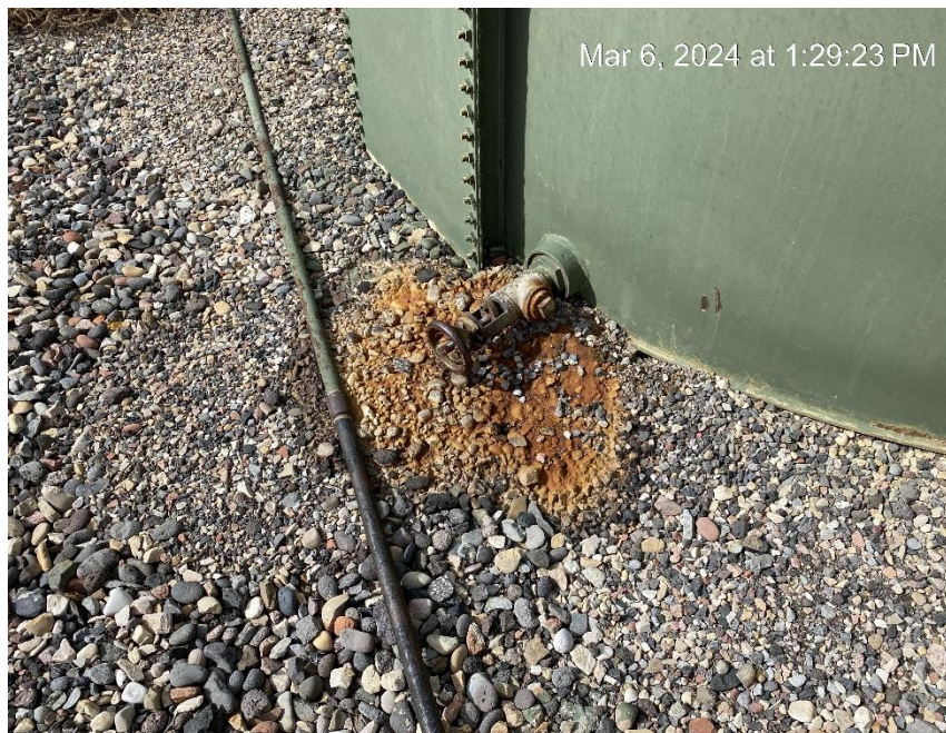
Leaking valve and soil staining