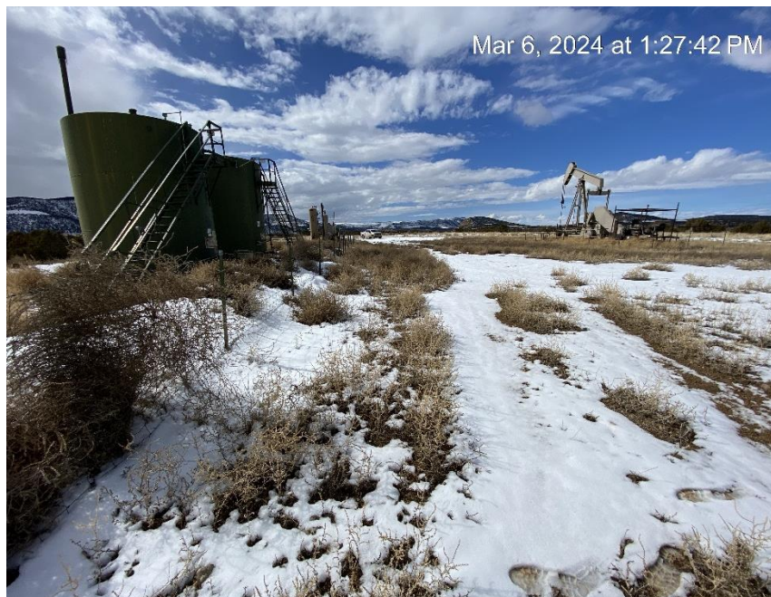
Location from Southeast corner