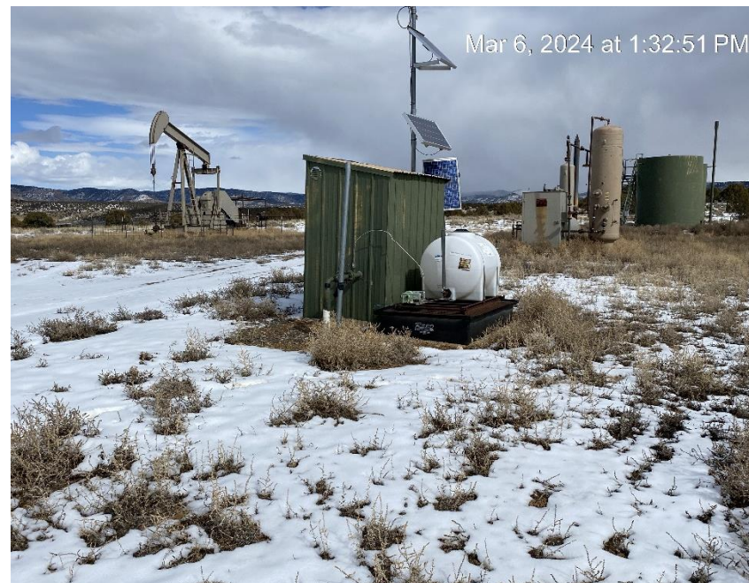
Location from Southwest corner