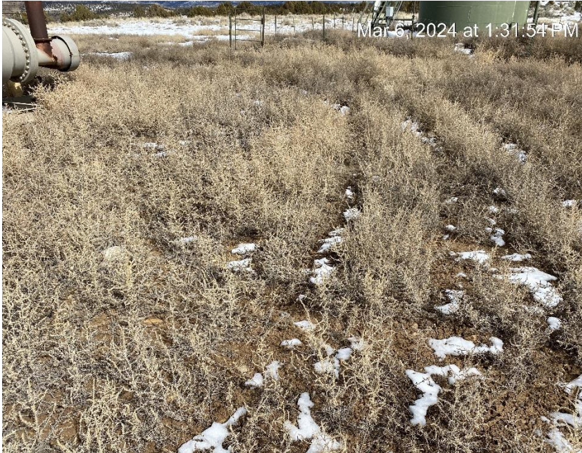
Previous year weed growth