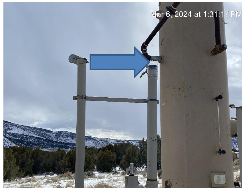
Rain protection no longer functional