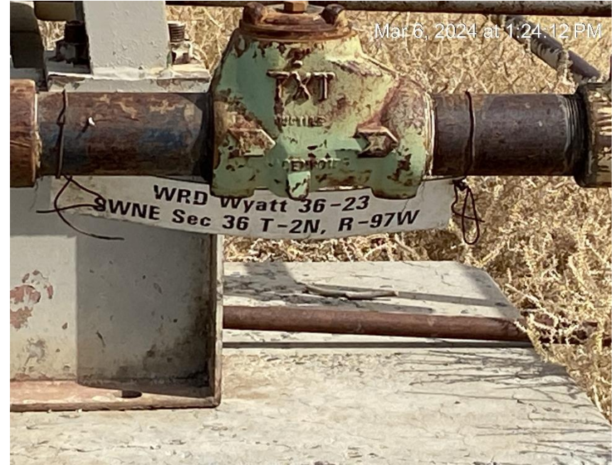
As signs are replaced additional information is required