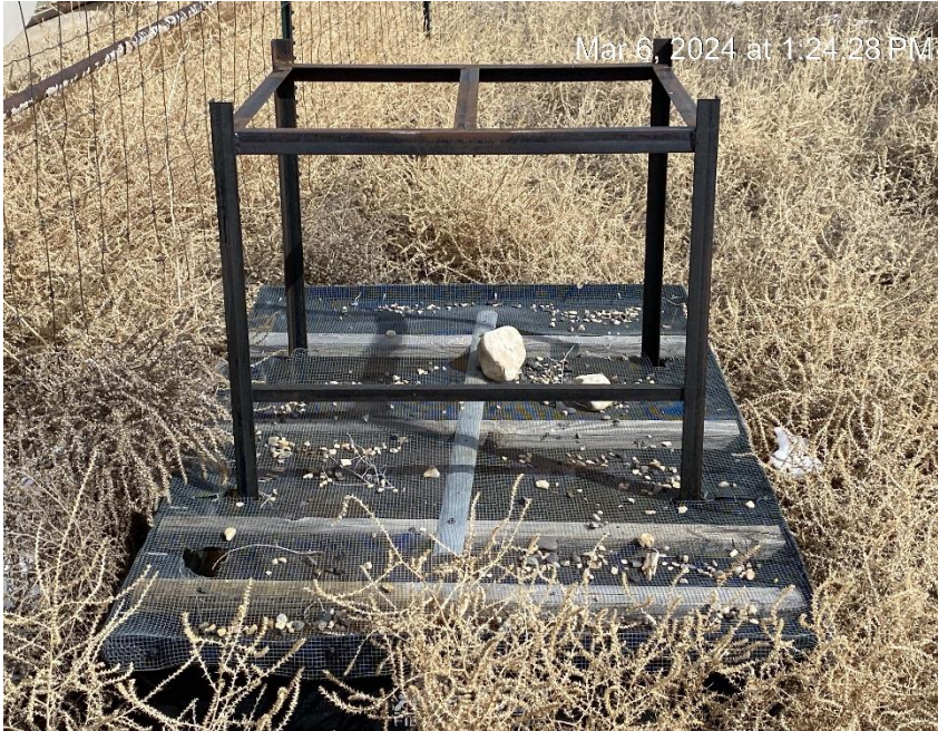
Debris. Previous year weed growth