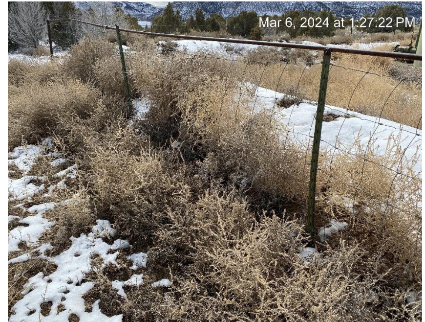
Previous year weed growth