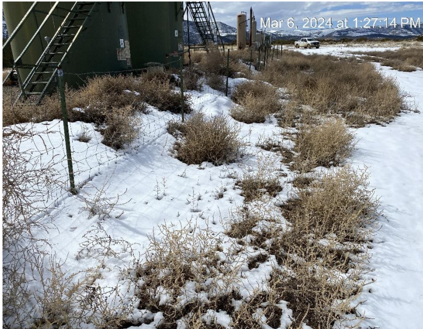
Previous year weed growth