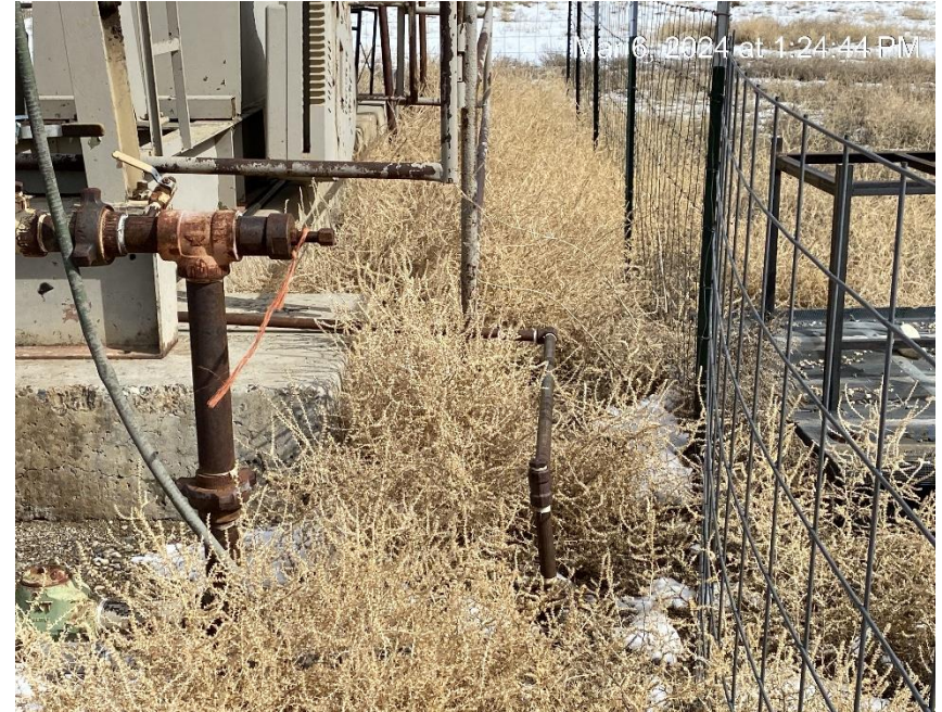
Previous year weed growth