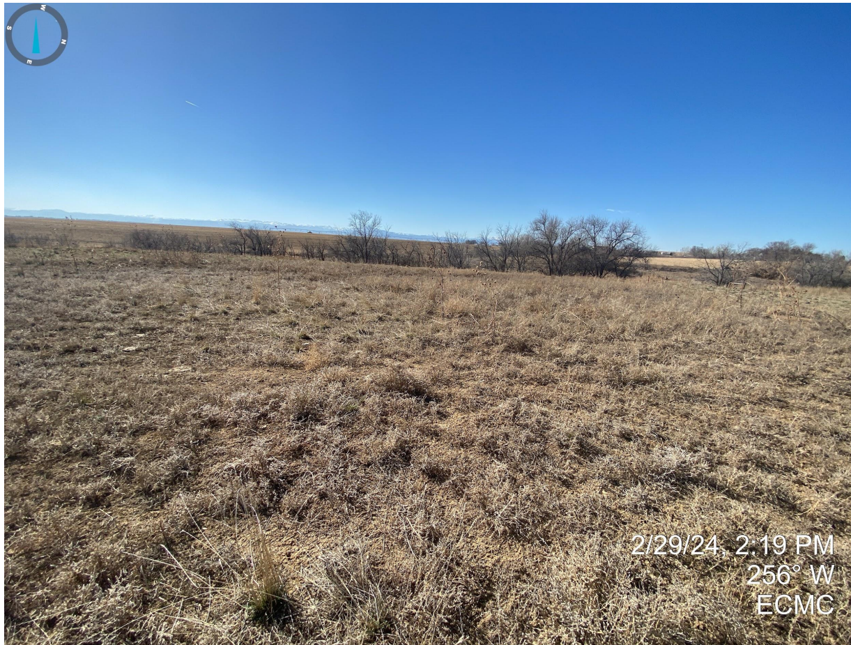
Photo 7. The reclaimed area is not reflective of the adjacent reference area (Photo 8). Some desirable species were observed, however, the majority of the reclaimed area is undesirable vegetation (e.g. kochia).