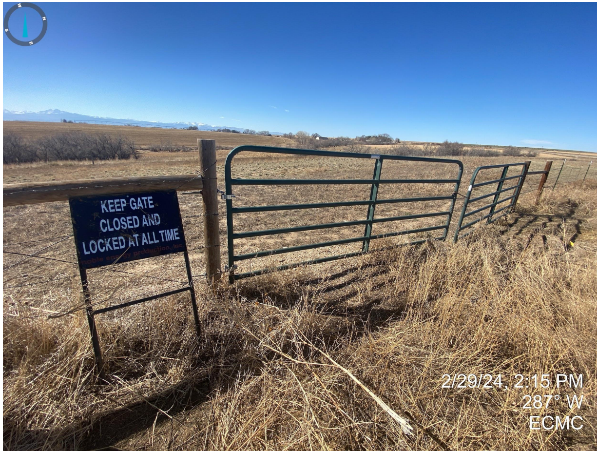
Photo 1. Location signage will need to be removed.