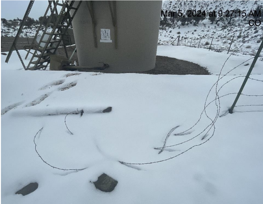
Photo # 8201 Barbed wire fence needs maintenance/barbed wire laying on ground/wildlife hazard