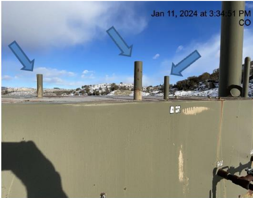
Photo # 2673 From inspection 708902787 conducted on 01/11/2024 PRV & rupture disc vent lines lack caps