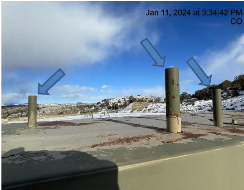
Photo # 2674 From inspection 708902787 conducted on 01/11/2024 PRV & rupture disc vent lines lack caps