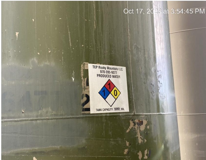
Unused equipment, hole in tank