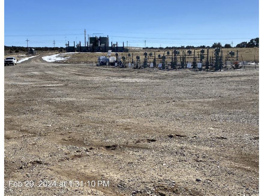
Well pad from Northeast corner