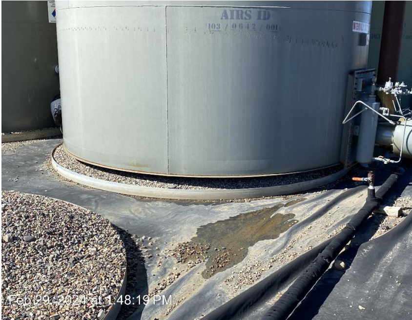
Over pressurized tank out of service