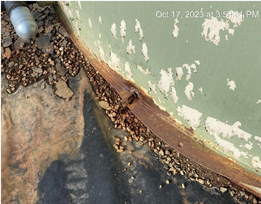
Hole in production tank