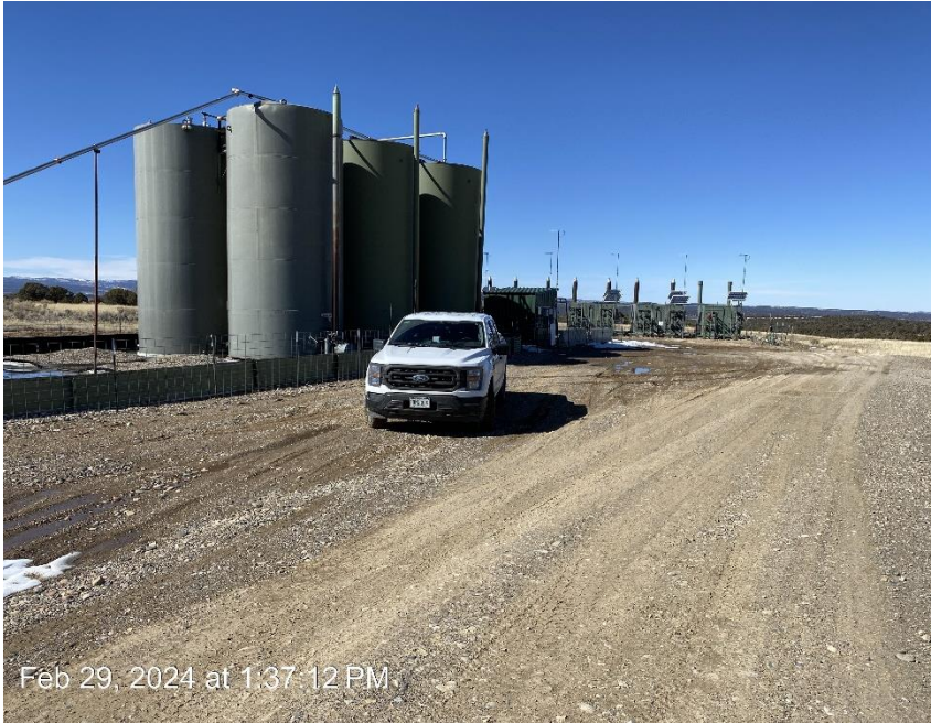
Production facility from Southeast corner