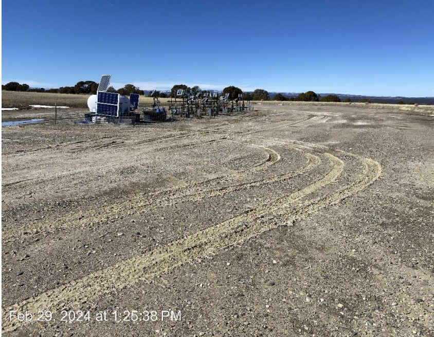
Well pad from Southeast corner