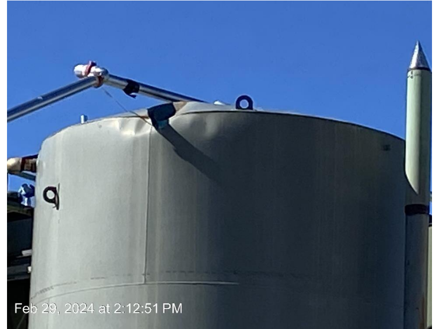
Over pressurized tank out of service