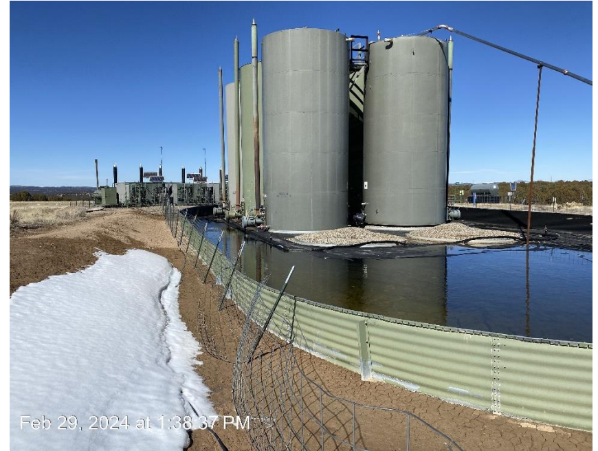
Production facility from Southwest corner