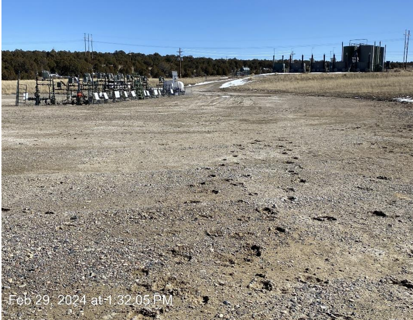
Well pad from Northwest corner