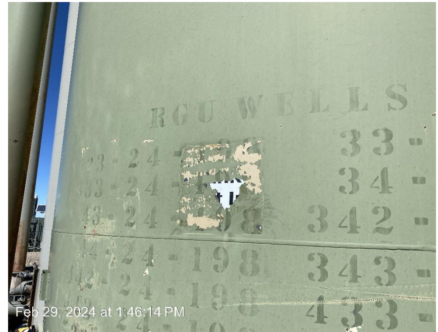
Unused equipment, out of service label removed