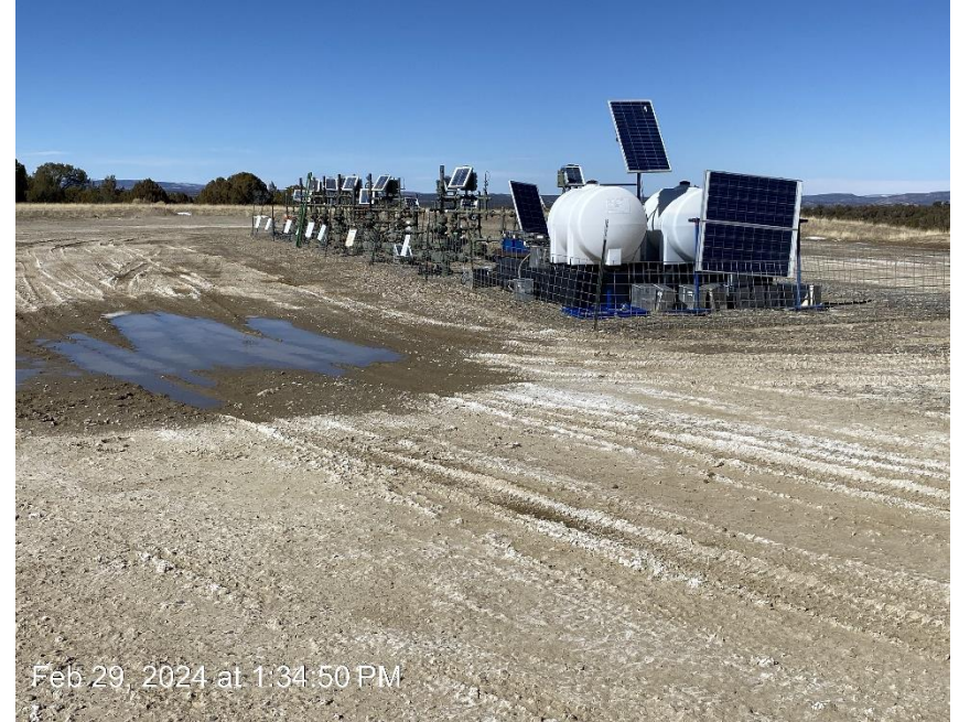
Well pad from Southwest corner