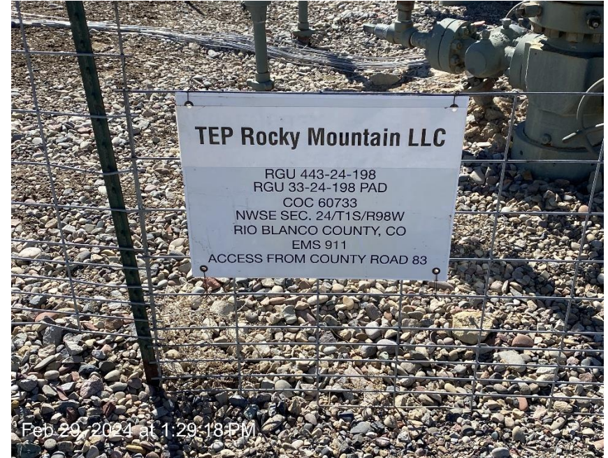
As signs are replaced additional information is required