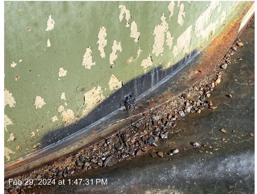
Same hole in production tank