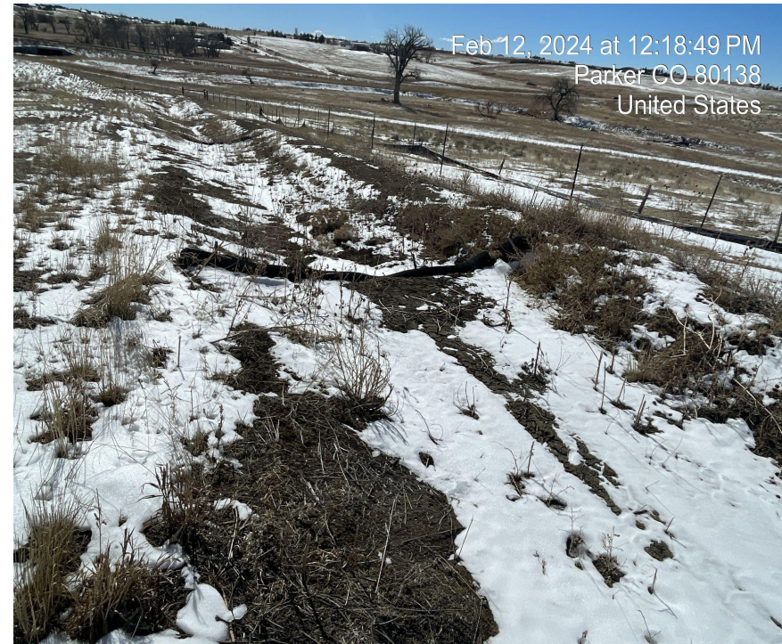
Photo 10. Photo of sediment laden check dams in perimeter ditch . Photo tank facing west.