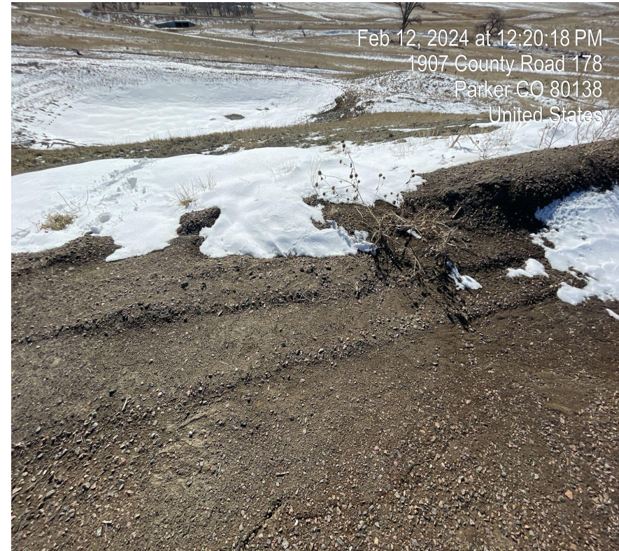
Photo 12. Photo of reeling in pad perimeter on the west side of pad. Photo taken facing west.