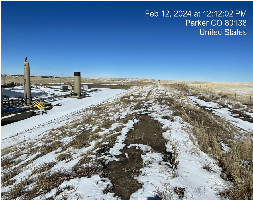
Photo 5. Photo taken of vegetation on topsoil stockpile in interim reclaimed area of well pad. Photo taken facing north.