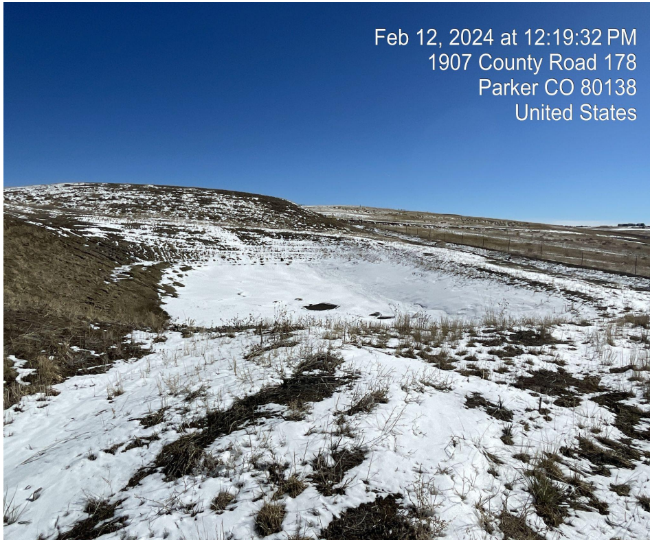
Photo 11. Photo of large sediment basin on north side of pad. Photo taken facing west.