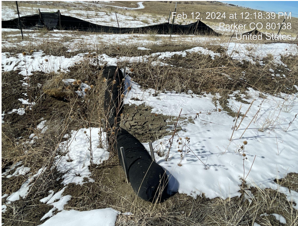
Photo 9. Photo of sediment laden check dams in perimeter ditch . Photo tank facing north.