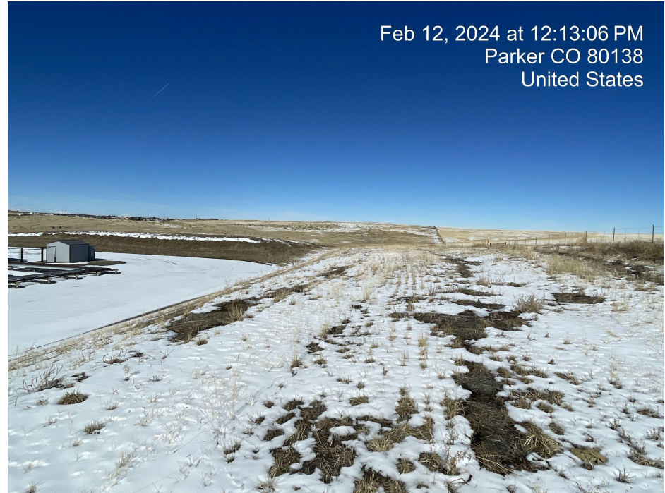
Photo 6. Photo taken of vegetation on topsoil stockpile in interim reclaimed area of well pad. Photo taken facing north.