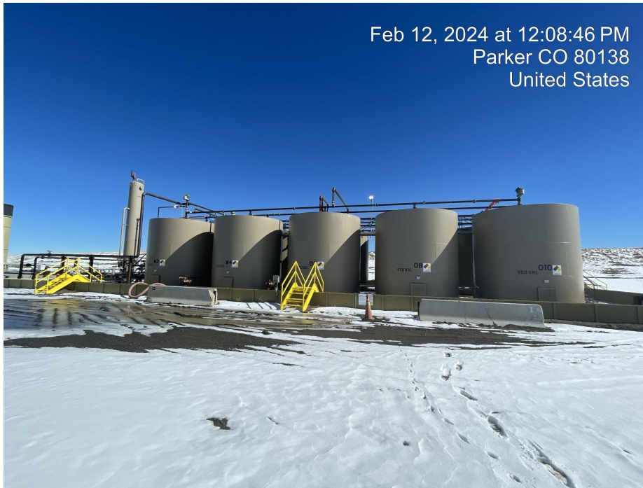
Photo 3. Photo taken of tank battery on site. Photo taken facing southeast.