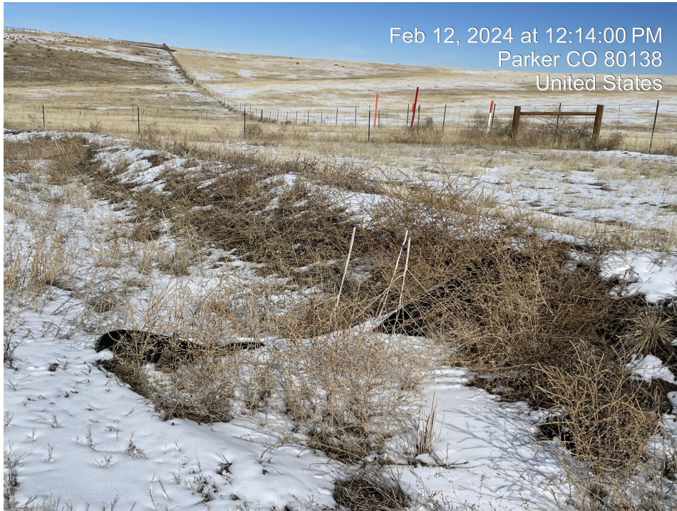
Photo 7. Photo of weeds (russian thistle) in perimeter ditch on the east side of site. Photo tank facing north.