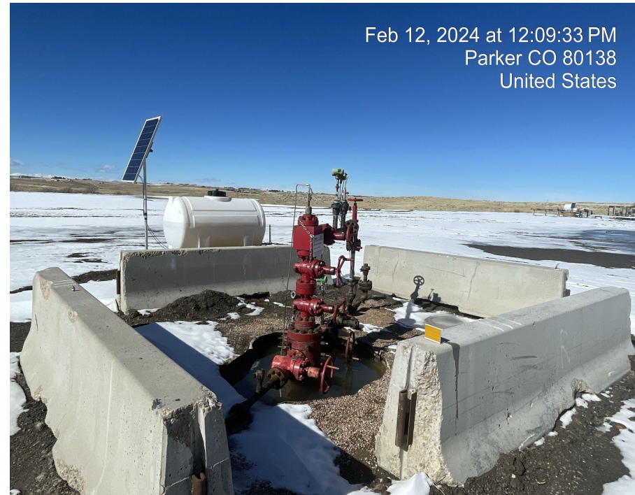
Photo 2. Photo taken of wellhead on site. Photo taken facing northeast.