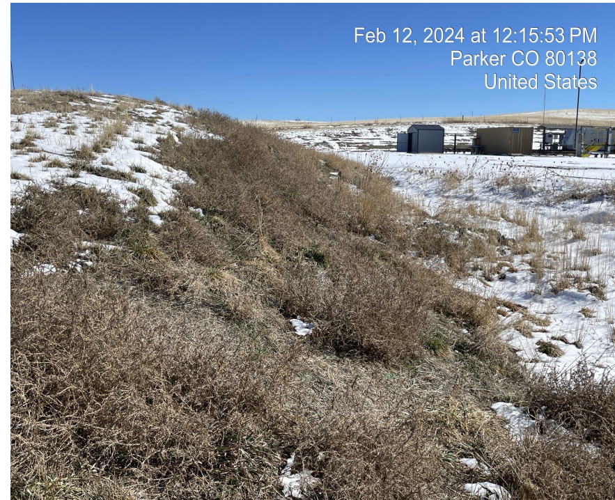
Photo 8. Photo of weeds (russian thistle & kochia) on the east side of pad. Photo taken facing south.