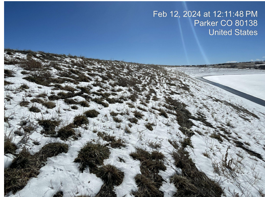
Photo 4. Photo taken of vegetation in topsoil stockpile in interim reclaimed area of well pad. Photo taken facing south.