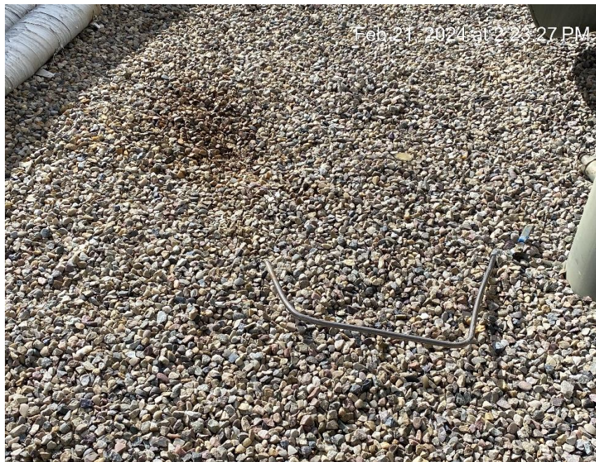
Drip pot drain to ground