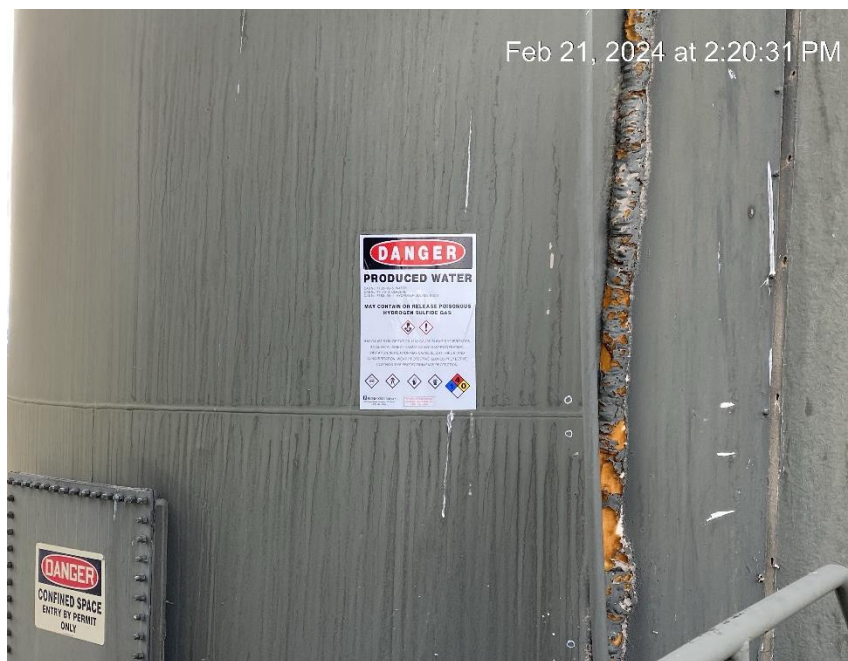
Tank label missing required information