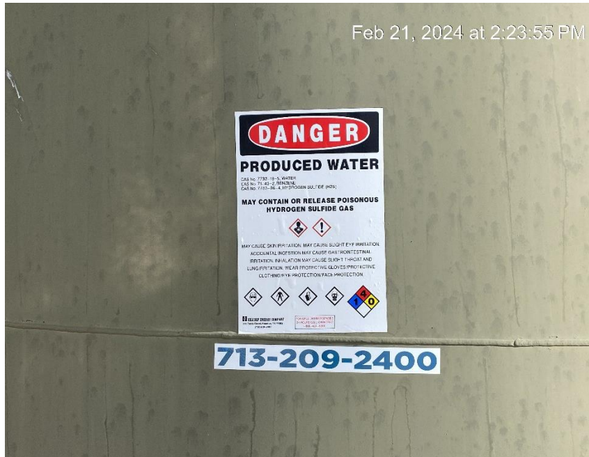
Tank missing required information