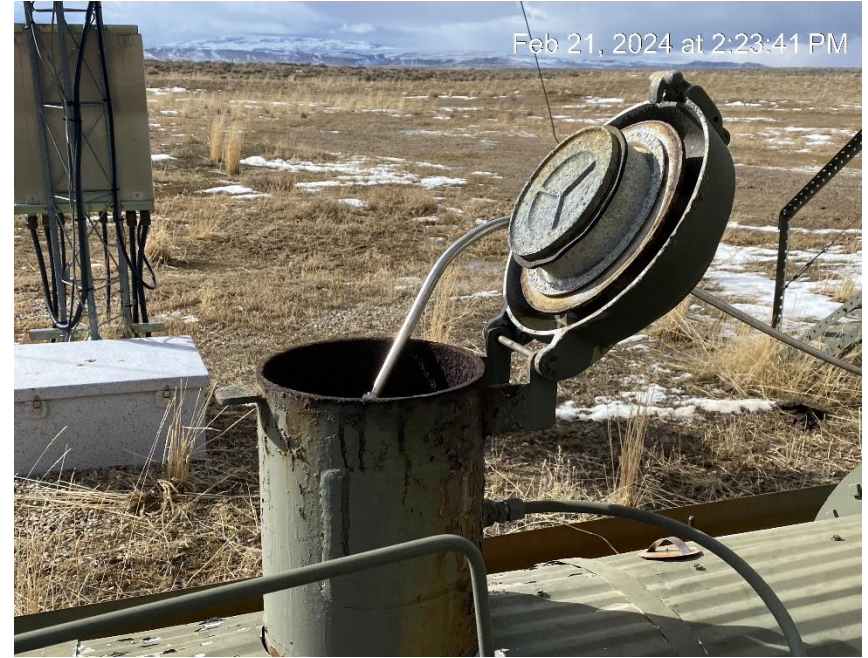
Open to wildlife