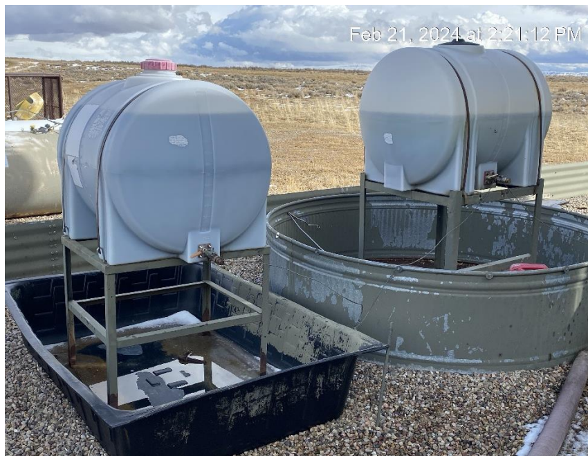
Unlabeled chemical tanks