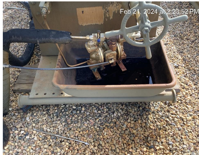
Open to wildlife