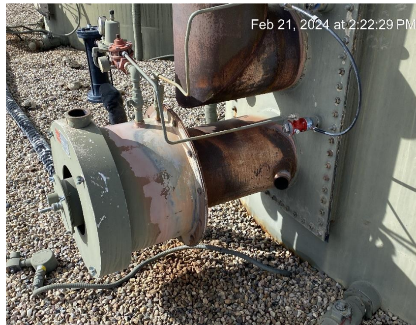
Open to wildlife