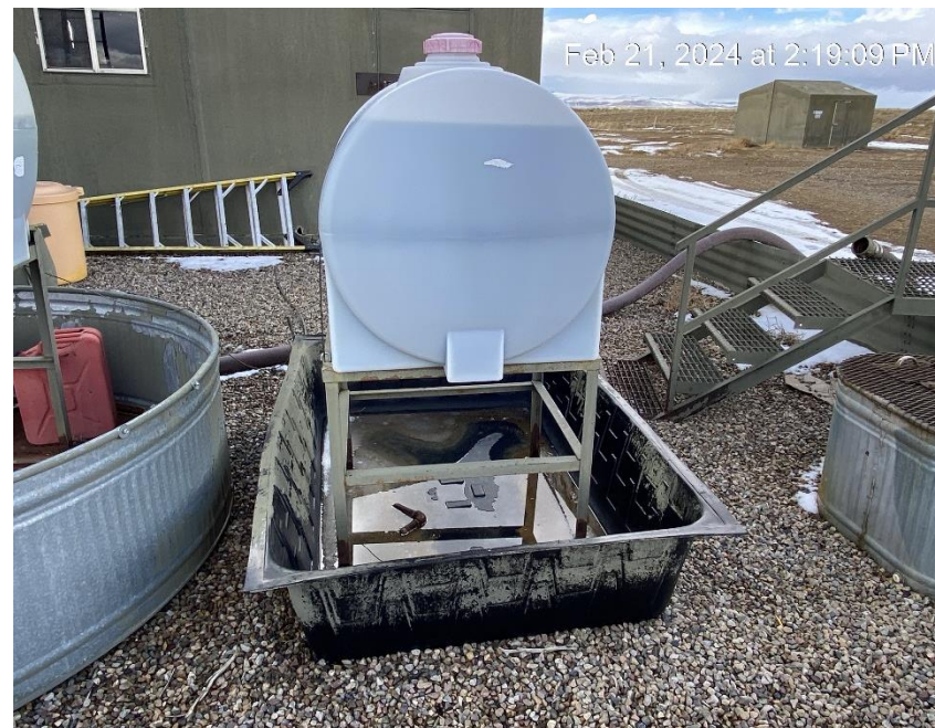
Open to wildlife