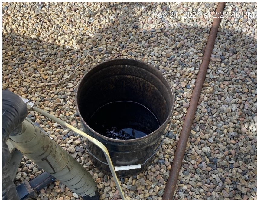
Debris open to wildlife