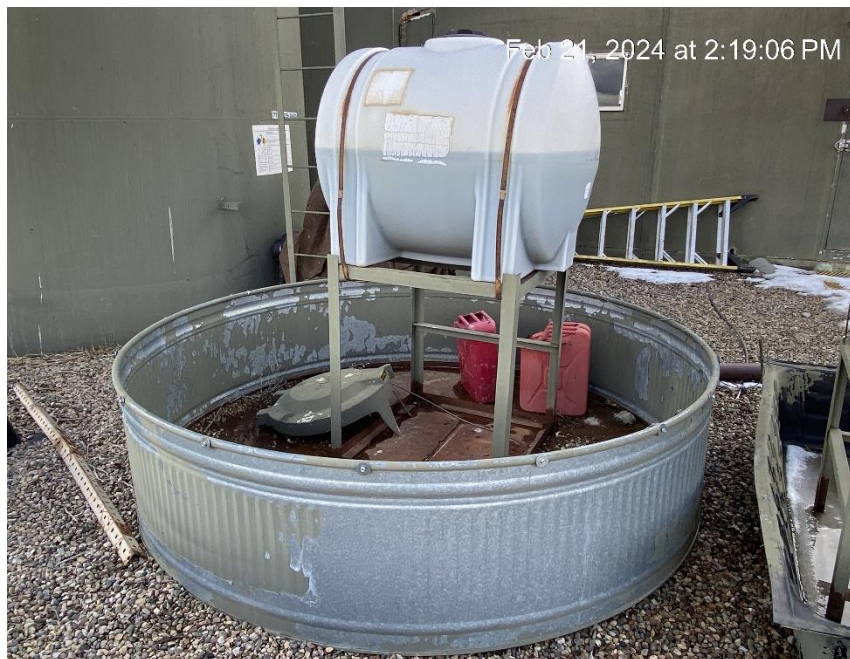
Debris and open to wildlife