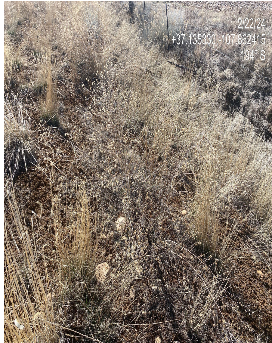
Photo 4. View of russian knapweed patches that remain prevalent in both the eastern and western portions of the disturbance.