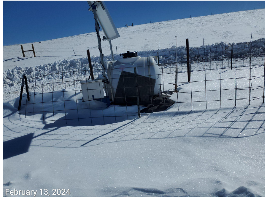
Photo 3: Netting installed to prevent wildlife access to the secondary containment measures.