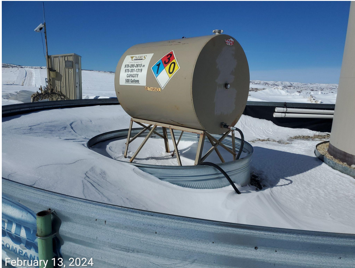
Photo 4: Wildlife protection BMPs missing from the methanol tank containment measure.