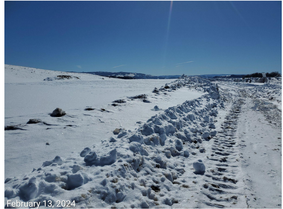
Photo 2: Photos examples showing areas of the Location under the “Chevron O06 696 443338, Land Application Site”.