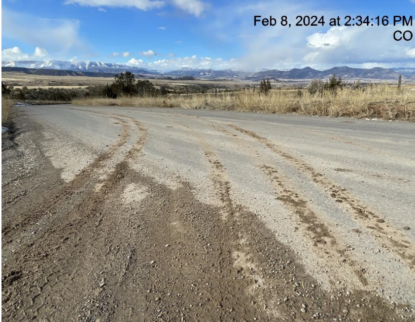
Photo # 6180 Insufficient tracking BMP's/tracking off lease road & onto CR 336 (Jenkins Cutoff)