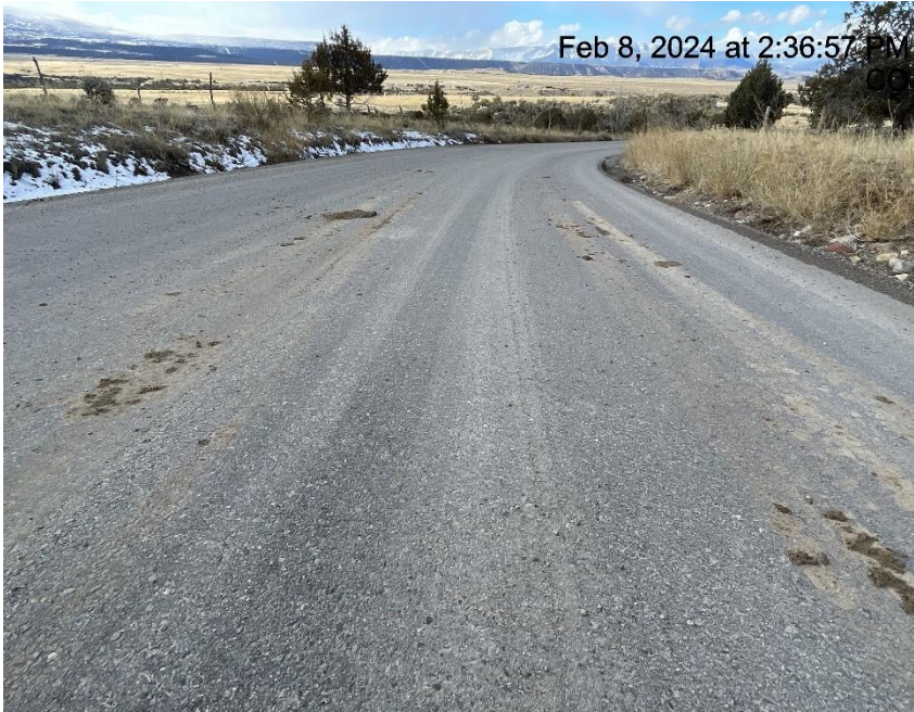
Photo # 6190 Insufficient tracking BMP's/tracking off lease road & onto CR 336 (Jenkins Cutoff)