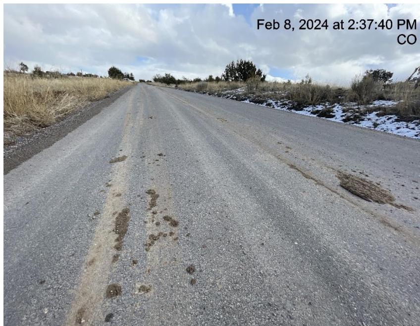
Photo # 6194 Insufficient tracking BMP's/tracking off lease road & onto CR 336 (Jenkins Cutoff)