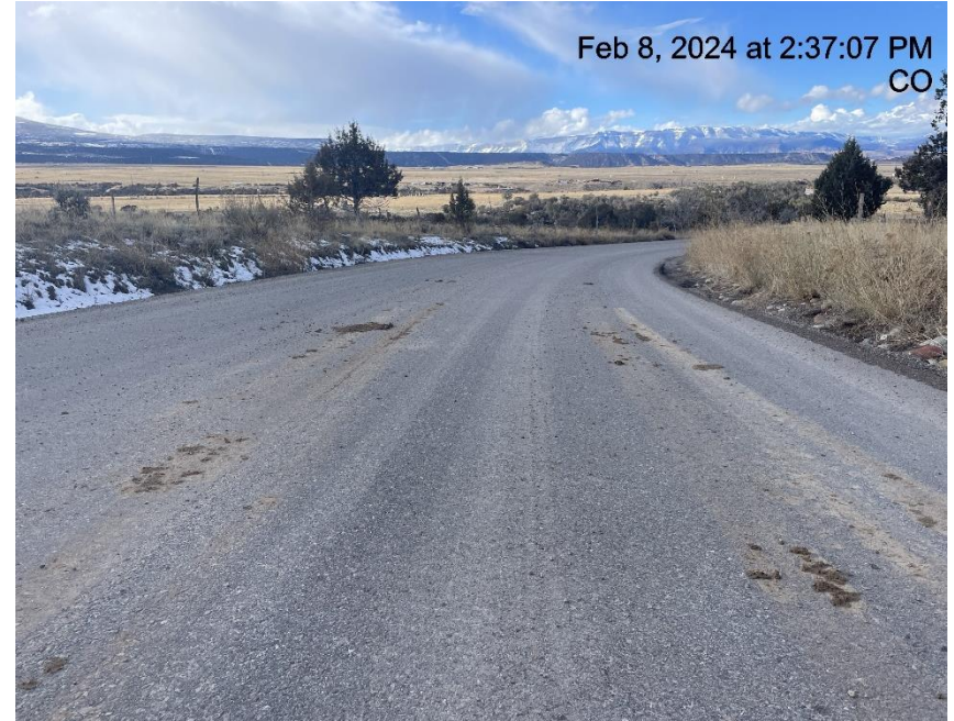
Photo # 6191 Insufficient tracking BMP's/tracking off lease road & onto CR 336 (Jenkins Cutoff)