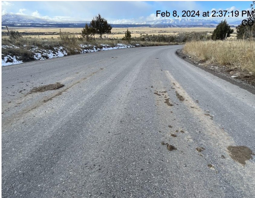
Photo # 6192 Insufficient tracking BMP's/tracking off lease road & onto CR 336 (Jenkins Cutoff)