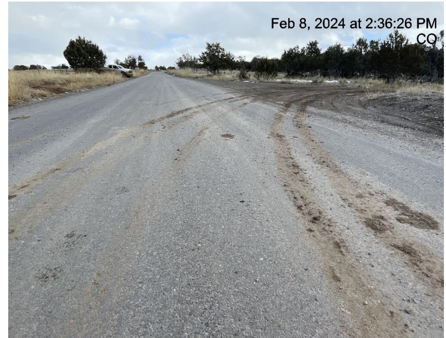
Photo # 6187 Insufficient tracking BMP's/tracking off lease road & onto CR 336 (Jenkins Cutoff)