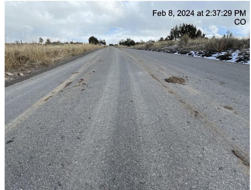
Photo # 6193 Insufficient tracking BMP's/tracking off lease road & onto CR 336 (Jenkins Cutoff)