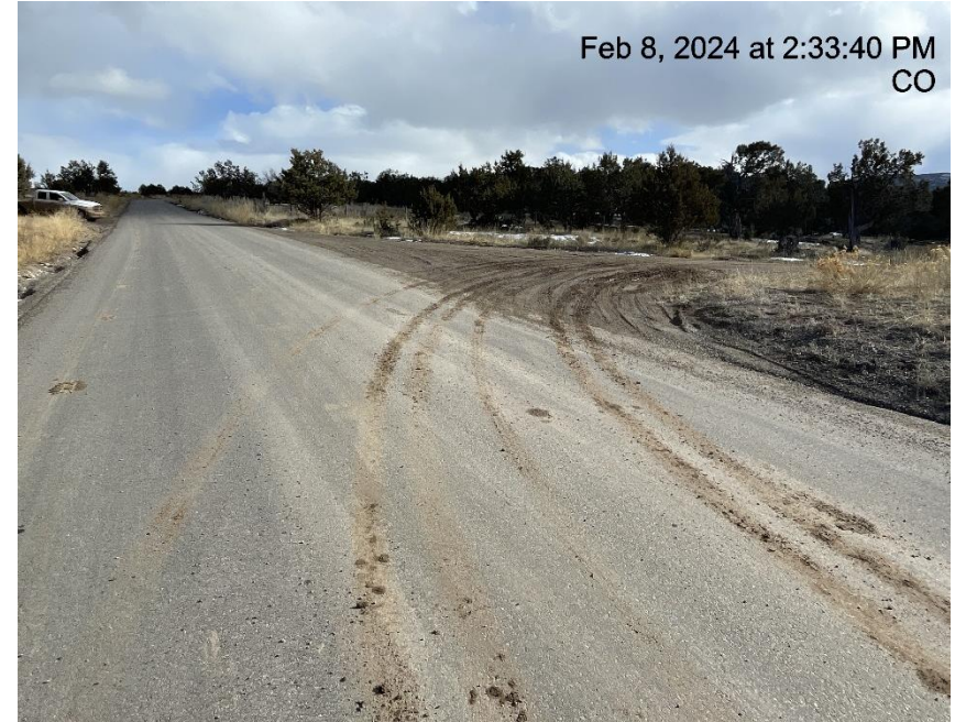
Photo # 6185 Insufficient tracking BMP's/tracking off lease road & onto CR 336 (Jenkins Cutoff)