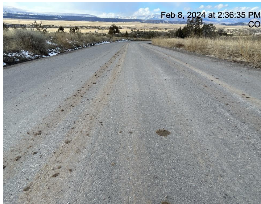
Photo # 6188 Insufficient tracking BMP's/tracking off lease road & onto CR 336 (Jenkins Cutoff)