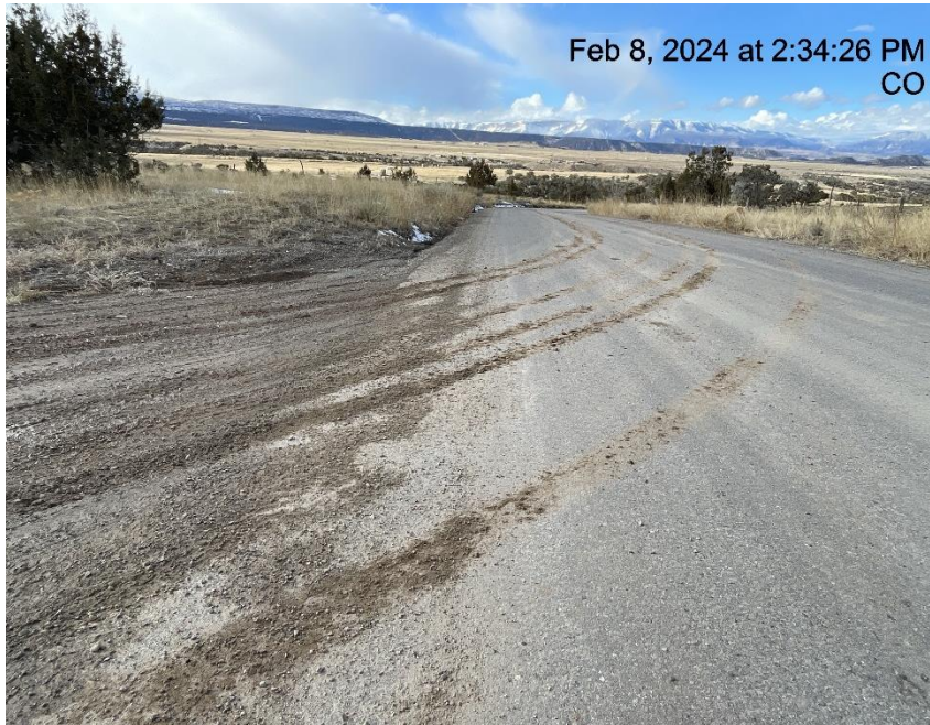
Photo # 6178 Insufficient tracking BMP's/tracking off lease road & onto CR 336 (Jenkins Cutoff)