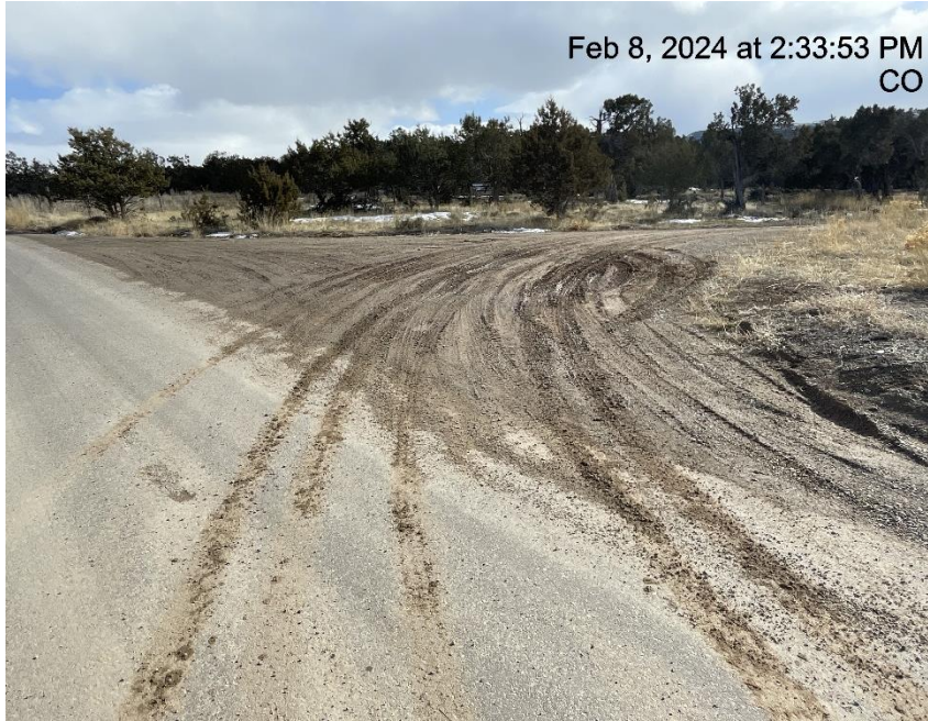
Photo # 6184 Insufficient tracking BMP's/tracking off lease road & onto CR 336 (Jenkins Cutoff)