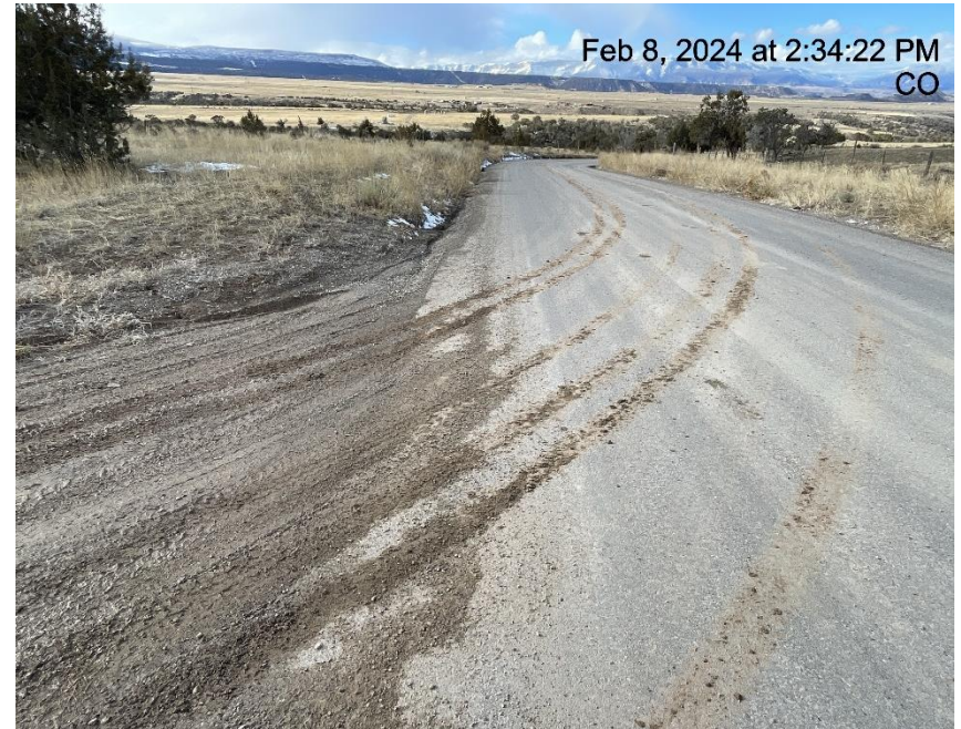
Photo # 6179 Insufficient tracking BMP's/tracking off lease road & onto CR 336 (Jenkins Cutoff)