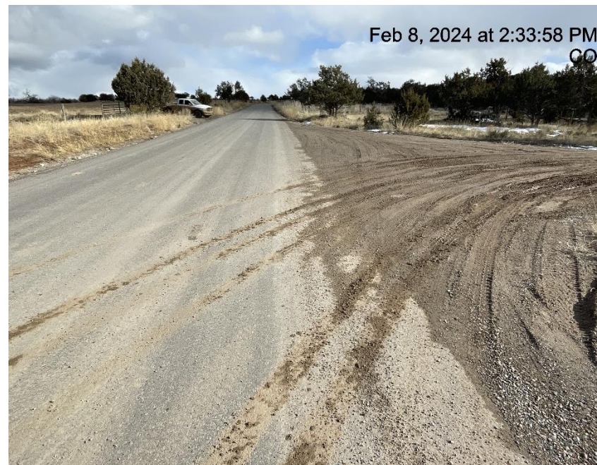
Photo # 6183 Insufficient tracking BMP's/tracking off lease road & onto CR 336 (Jenkins Cutoff)