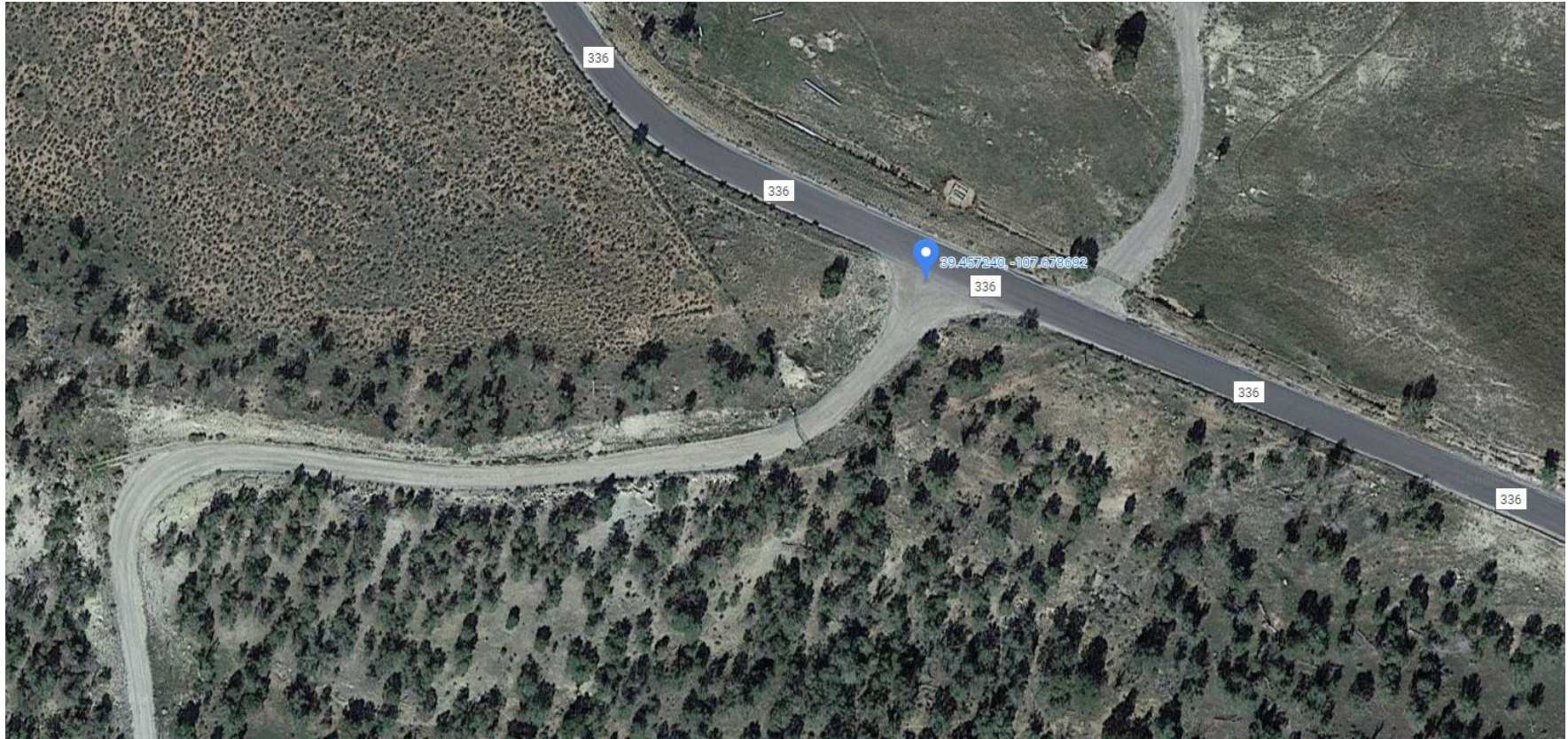
Overview of intersection of CR 336 (Jenkins Cutoff) & lease road.