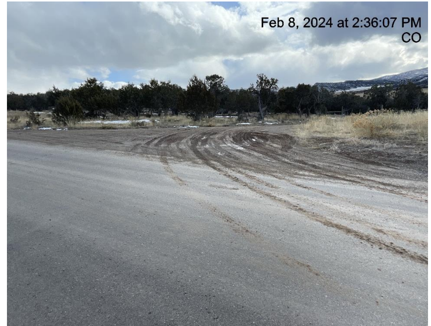
Photo # 6177 Insufficient tracking BMP's/tracking off lease road & onto CR 336 (Jenkins Cutoff)