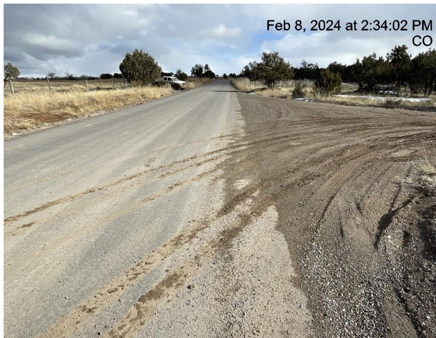
Photo # 6182 Insufficient tracking BMP's/tracking off lease road & onto CR 336 (Jenkins Cutoff)