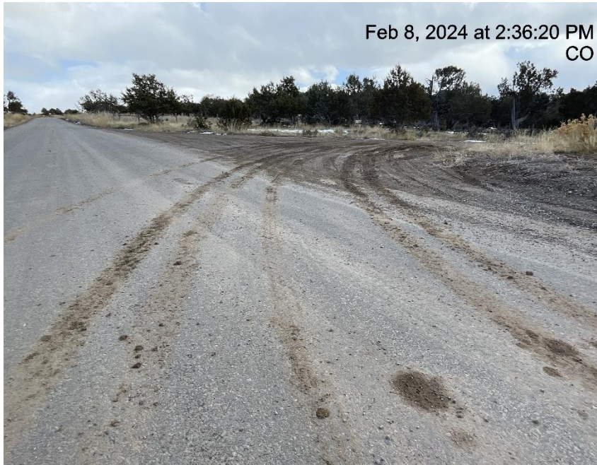
Photo # 6186 Insufficient tracking BMP's/tracking off lease road & onto CR 336 (Jenkins Cutoff)