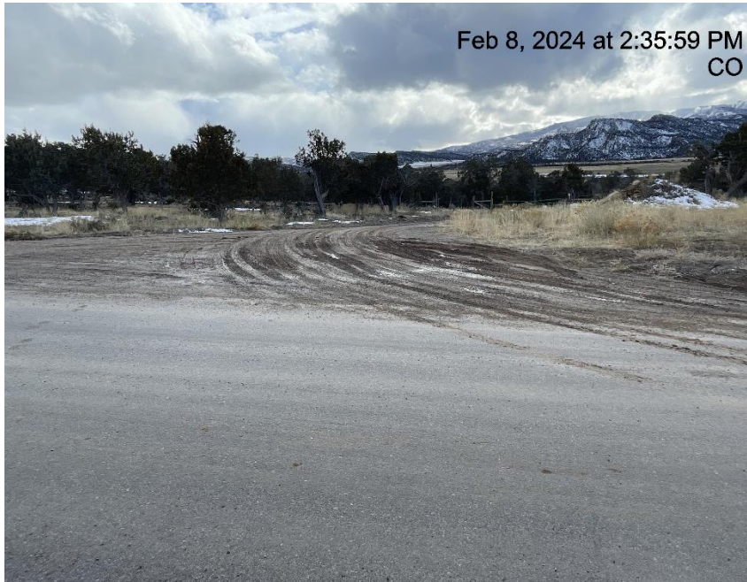
Photo # 6176 Insufficient tracking BMP's/tracking off lease road & onto CR 336 (Jenkins Cutoff)