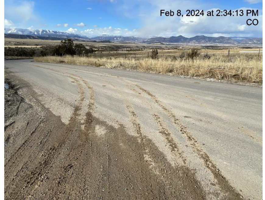
Photo # 6181 Insufficient tracking BMP's/tracking off lease road & onto CR 336 (Jenkins Cutoff)