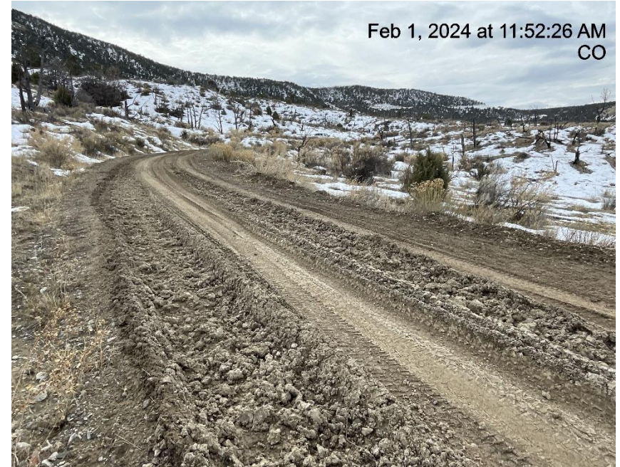
Photo # 5021 Lack of stabilization/compaction/insufficient BMP's on lease road