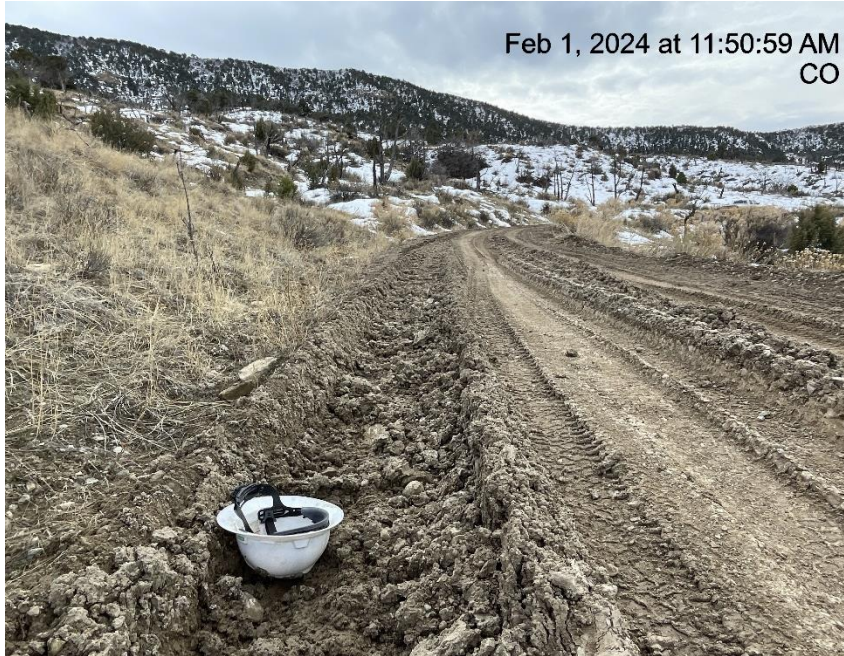
Photo # 5014 Lack of stabilization/compaction/insufficient BMP's on lease road