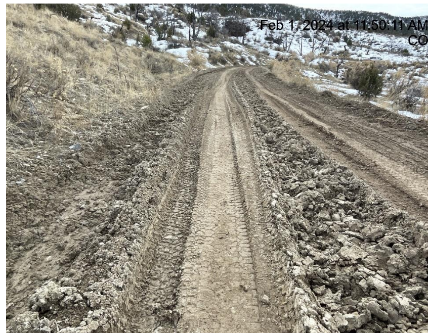
Photo # 5013 Lack of stabilization/compaction/insufficient BMP's on lease road