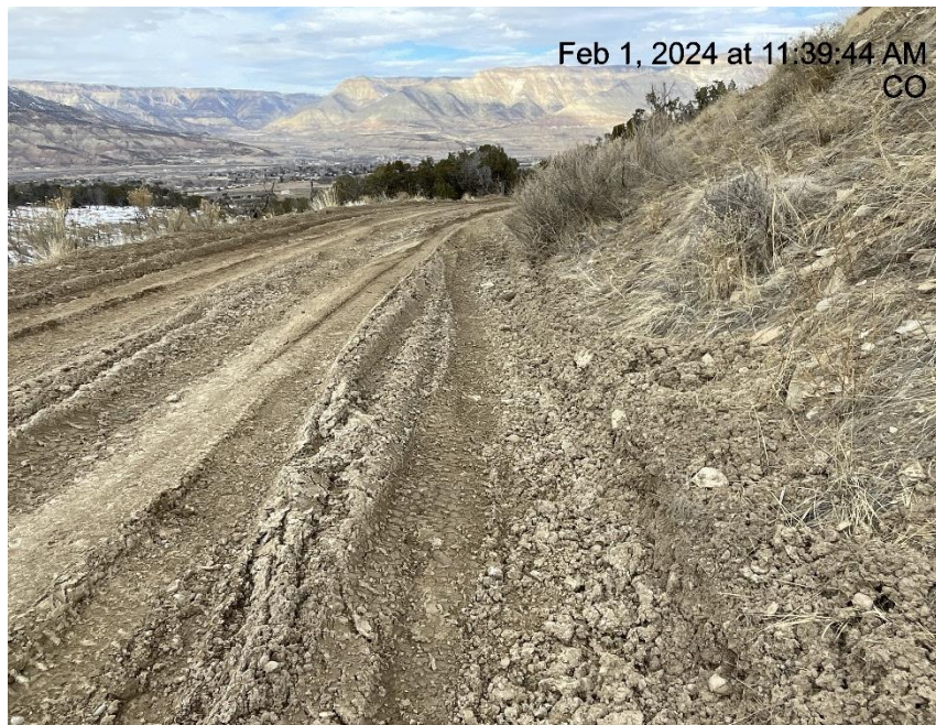
Photo # 5004 Lack of stabilization/compaction/insufficient BMP's on lease road