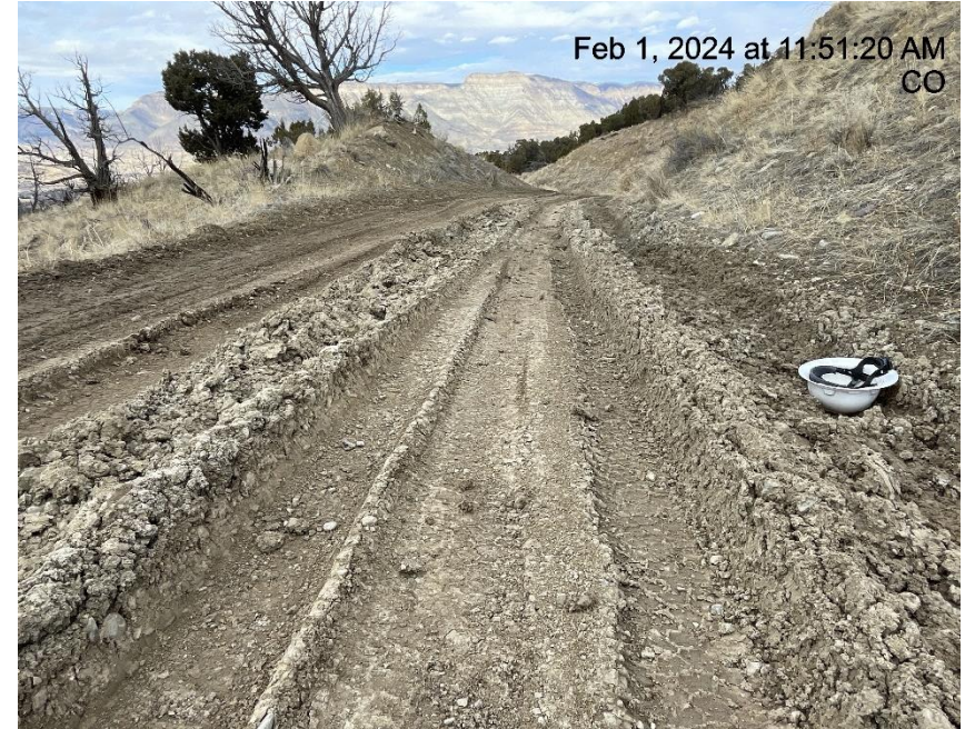
Photo # 5015 Lack of stabilization/compaction/insufficient BMP's on lease road