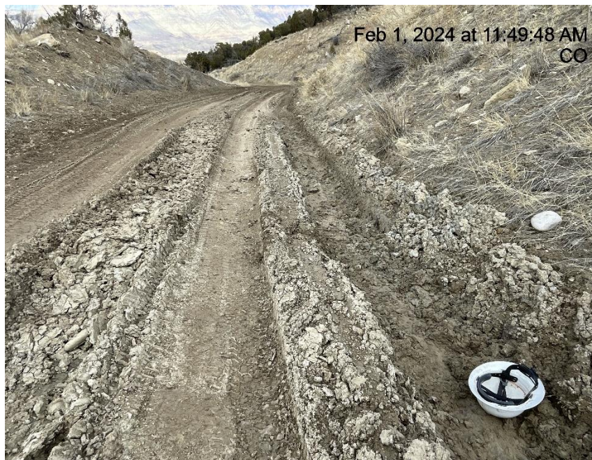
Photo # 5012 Lack of stabilization/compaction/insufficient BMP's on lease road