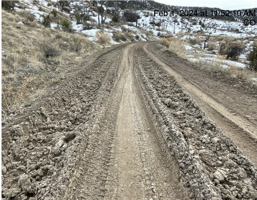
Photo # 5020 Lack of stabilization/compaction/insufficient BMP's on lease road