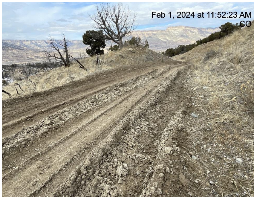
Photo # 5018 Lack of stabilization/compaction/insufficient BMP's on lease road