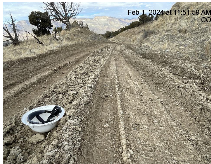
Photo # 5017 Lack of stabilization/compaction/insufficient BMP's on lease road