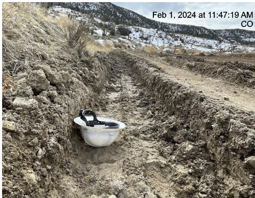
Photo # 5008 Lack of stabilization/compaction/insufficient BMP's on lease road