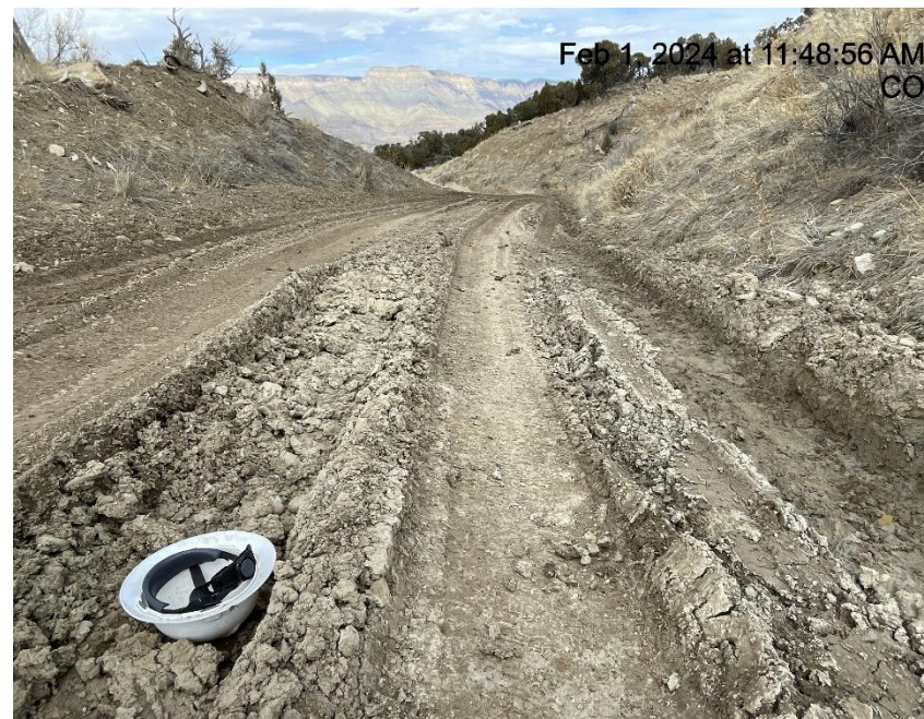
Photo # 5011 Lack of stabilization/compaction/insufficient BMP's on lease road