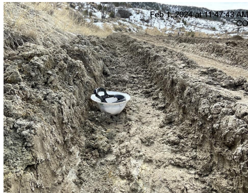
Photo # 5009 Lack of stabilization/compaction/insufficient BMP's on lease road