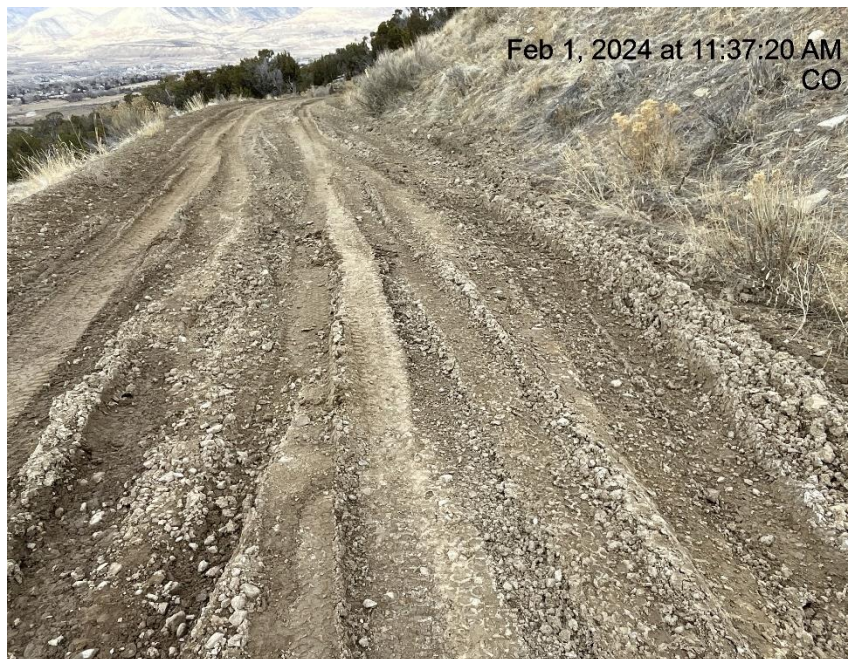
Photo # 5000 Lack of stabilization/compaction/insufficient BMP's on lease road