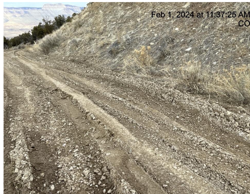
Photo # 5001 Lack of stabilization/compaction/insufficient BMP's on lease road