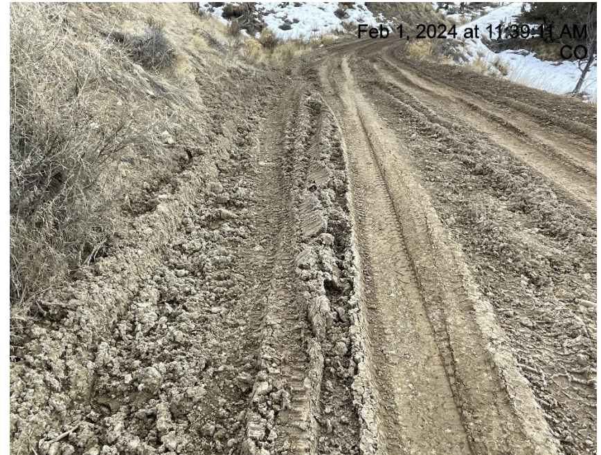
Photo # 5003 Lack of stabilization/compaction/insufficient BMP's on lease road