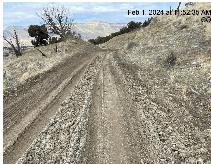
Photo # 5019 Lack of stabilization/compaction/insufficient BMP's on lease road