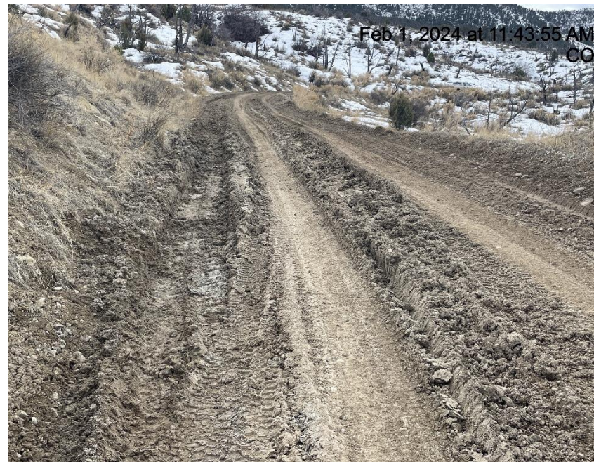
Photo # 5005 Lack of stabilization/compaction/insufficient BMP's on lease road