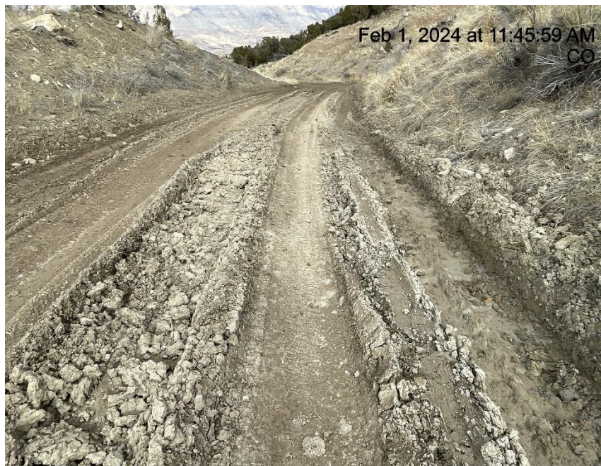
Photo # 5006 Lack of stabilization/compaction/insufficient BMP's on lease road