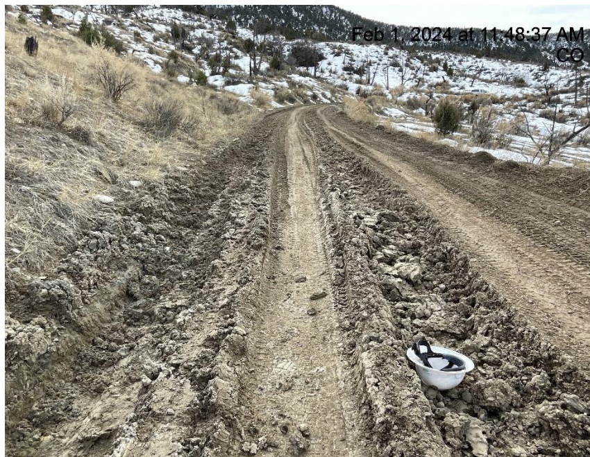
Photo # 5010 Lack of stabilization/compaction/insufficient BMP's on lease road