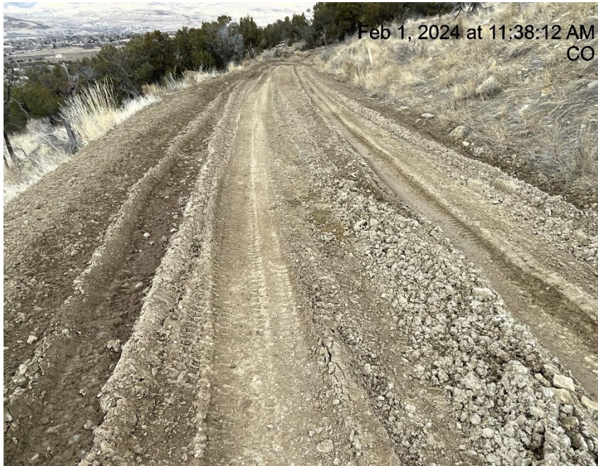
Photo # 5002 Lack of stabilization/compaction/insufficient BMP's on lease road