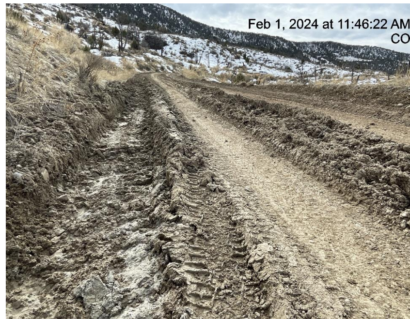
Photo # 5007 Lack of stabilization/compaction/insufficient BMP's on lease road