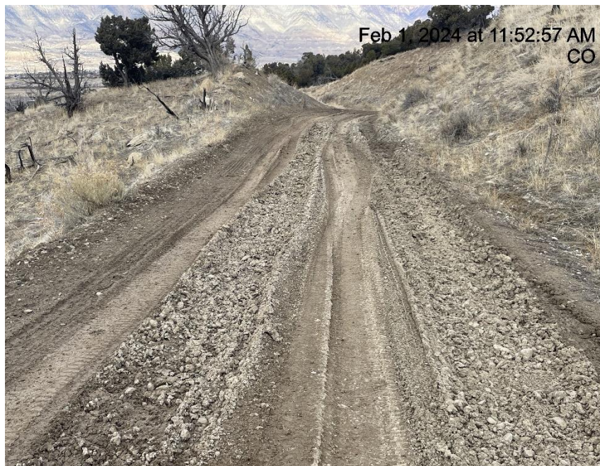
Photo # 5022 Lack of stabilization/compaction/insufficient BMP's on lease road