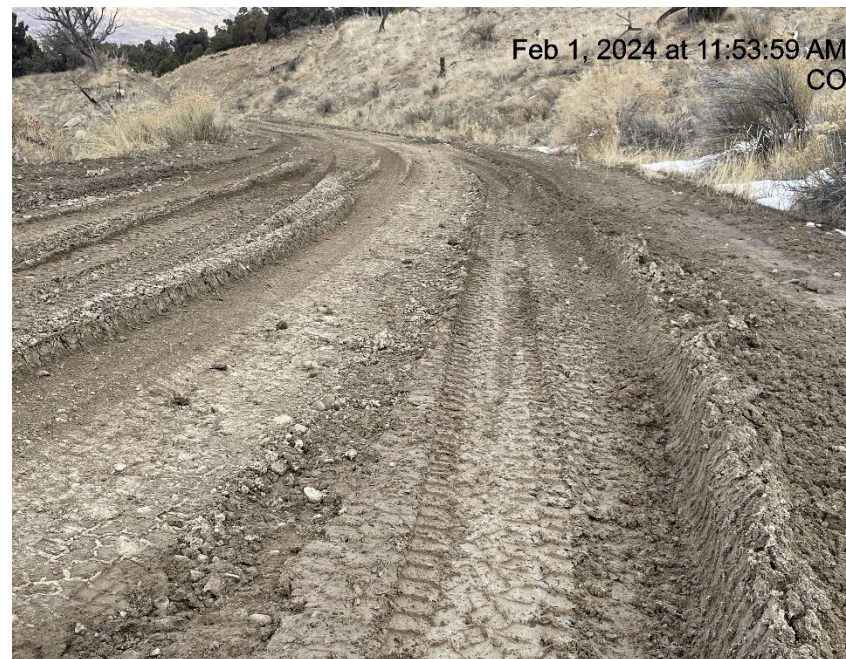
Photo # 5023 Lack of stabilization/compaction/insufficient BMP's on lease road