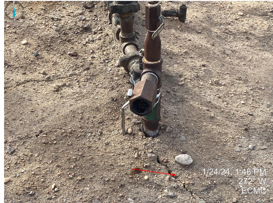
Photos 13 & 14. Stained soil observed near wellhead and fittings.