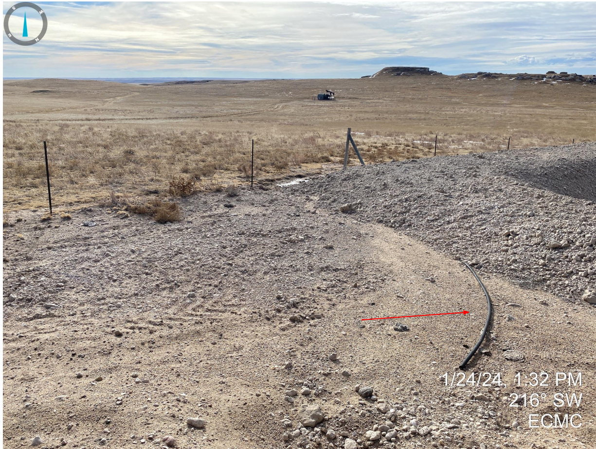
Photo 9. Debris/trash within pit area.