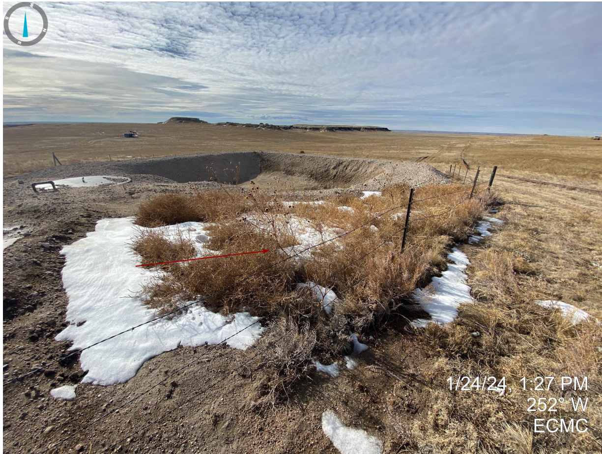
Photo 6. Tumbleweed accumulations near the pit are considered debris and require removal.