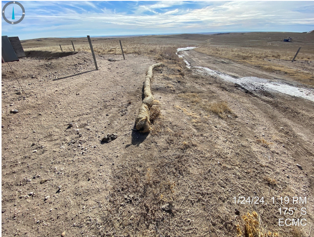
Photo 2. Stormwater control measure/BMPs does not appear to be properly installed per good engineering practices (e.g. trenched and backfilled).