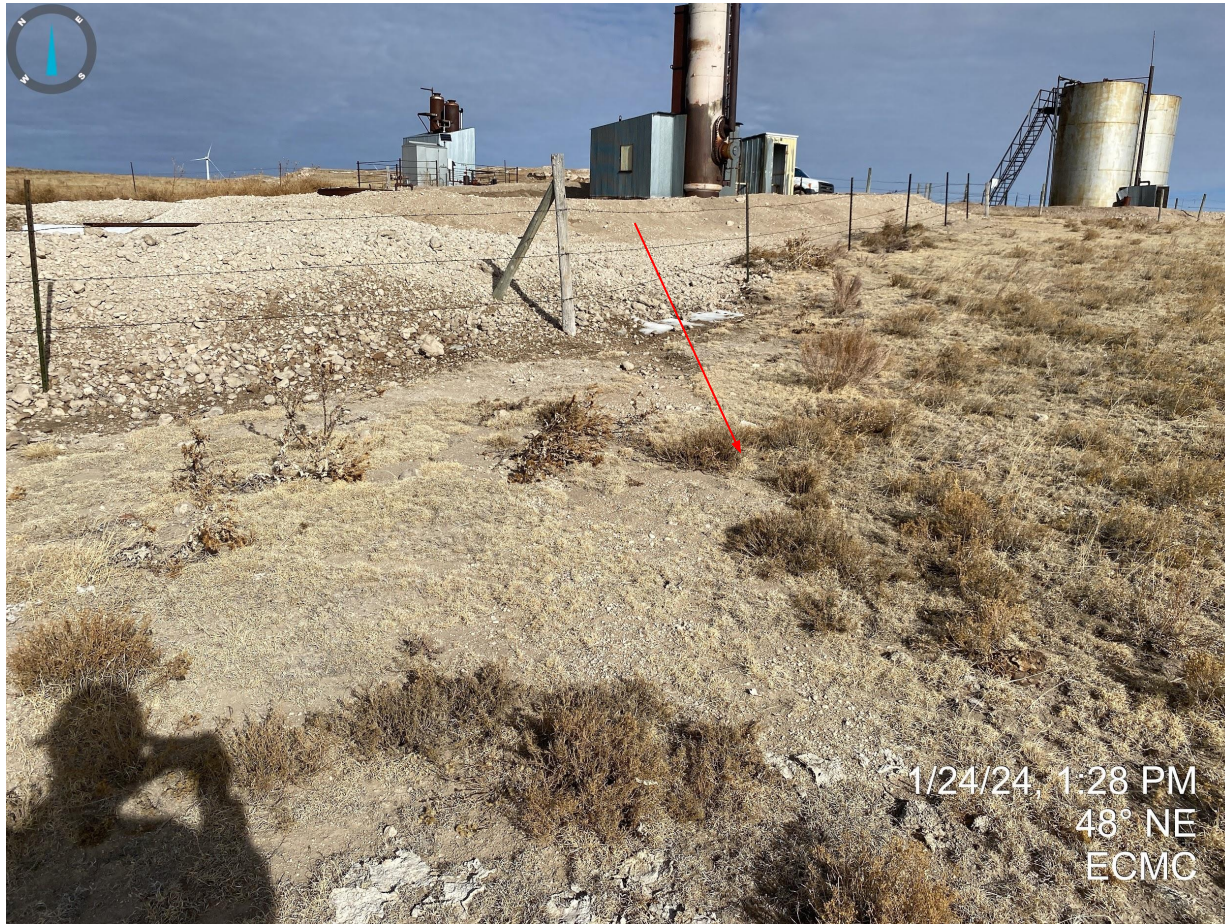
Photo 7. Erosion degradation occurring from the pit areas leading into the adjacent reference areas.