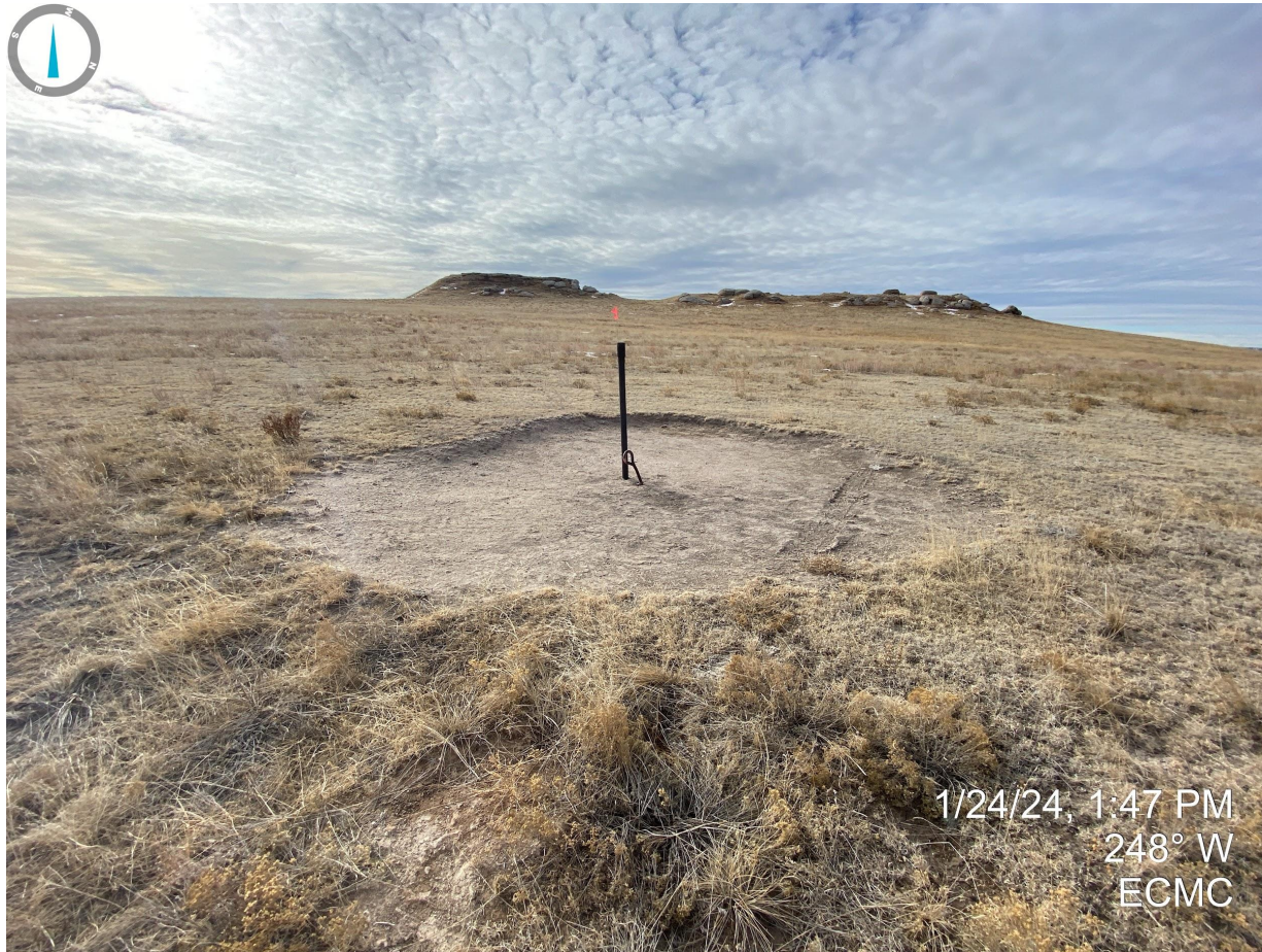
Photo 15. Northwest guyline anchor has been installed.