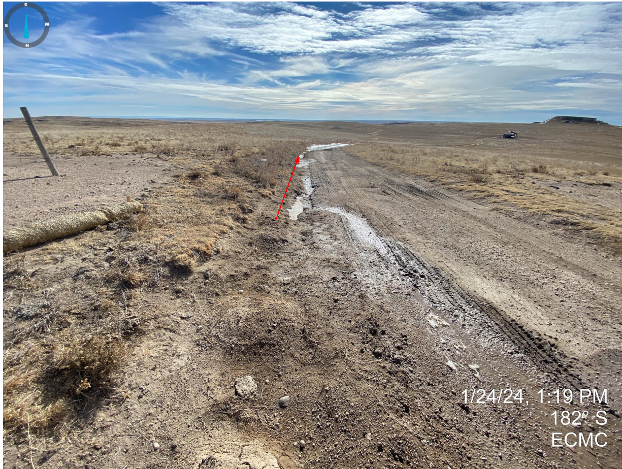
Photo 3. Erosion degradation occurring along the access road to the well location.