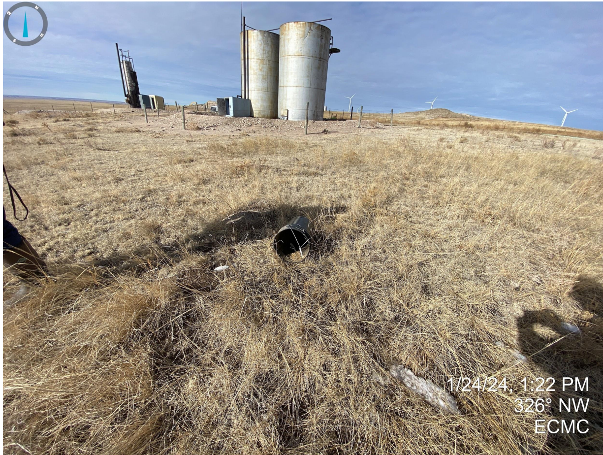
Photo 4. Trash and debris observed southwest of the tank battery.