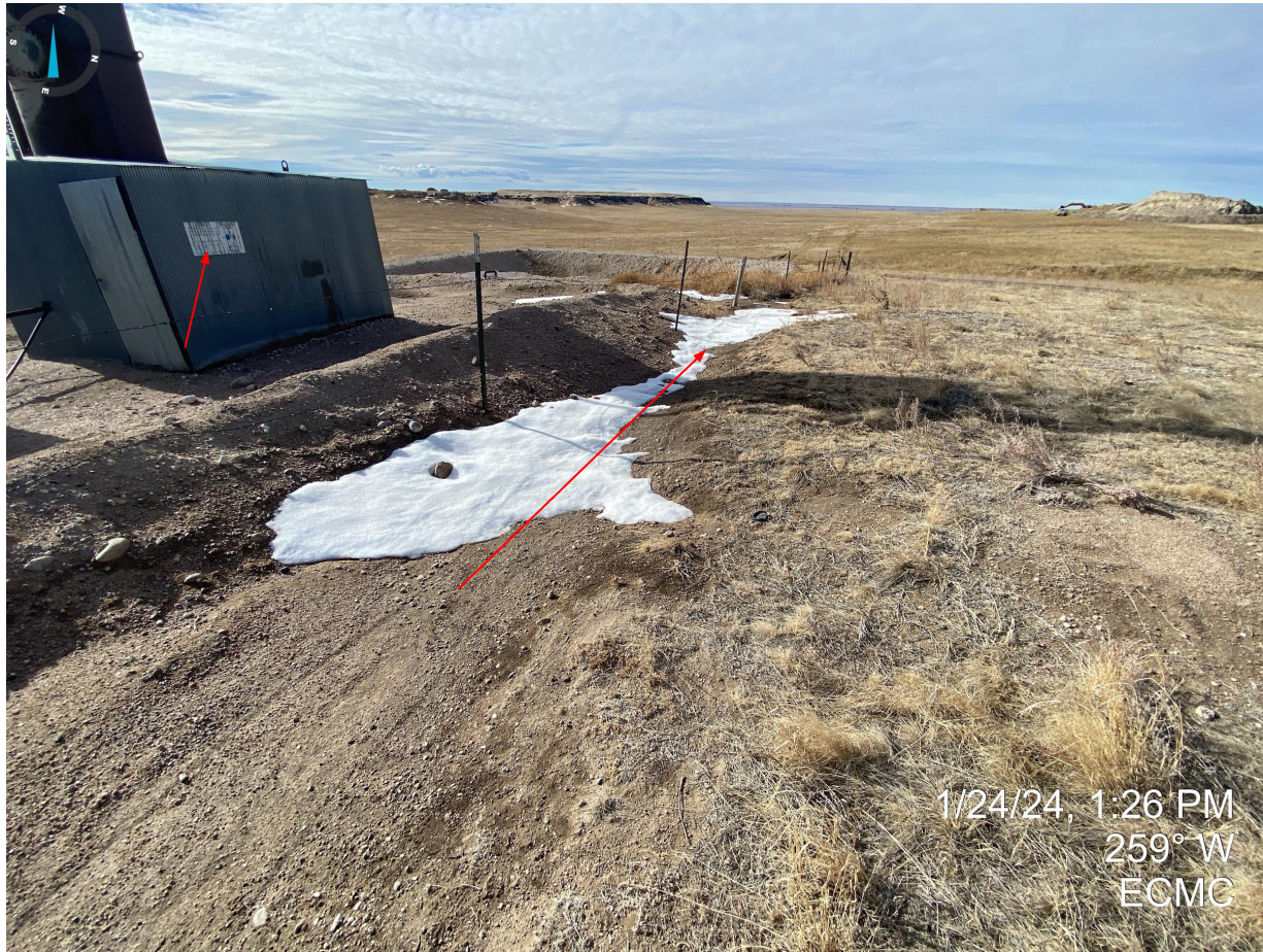
Photo 5. NFPA placard has not been replaced at shed and stormwater erosion degradation observed along the north side of the pit.