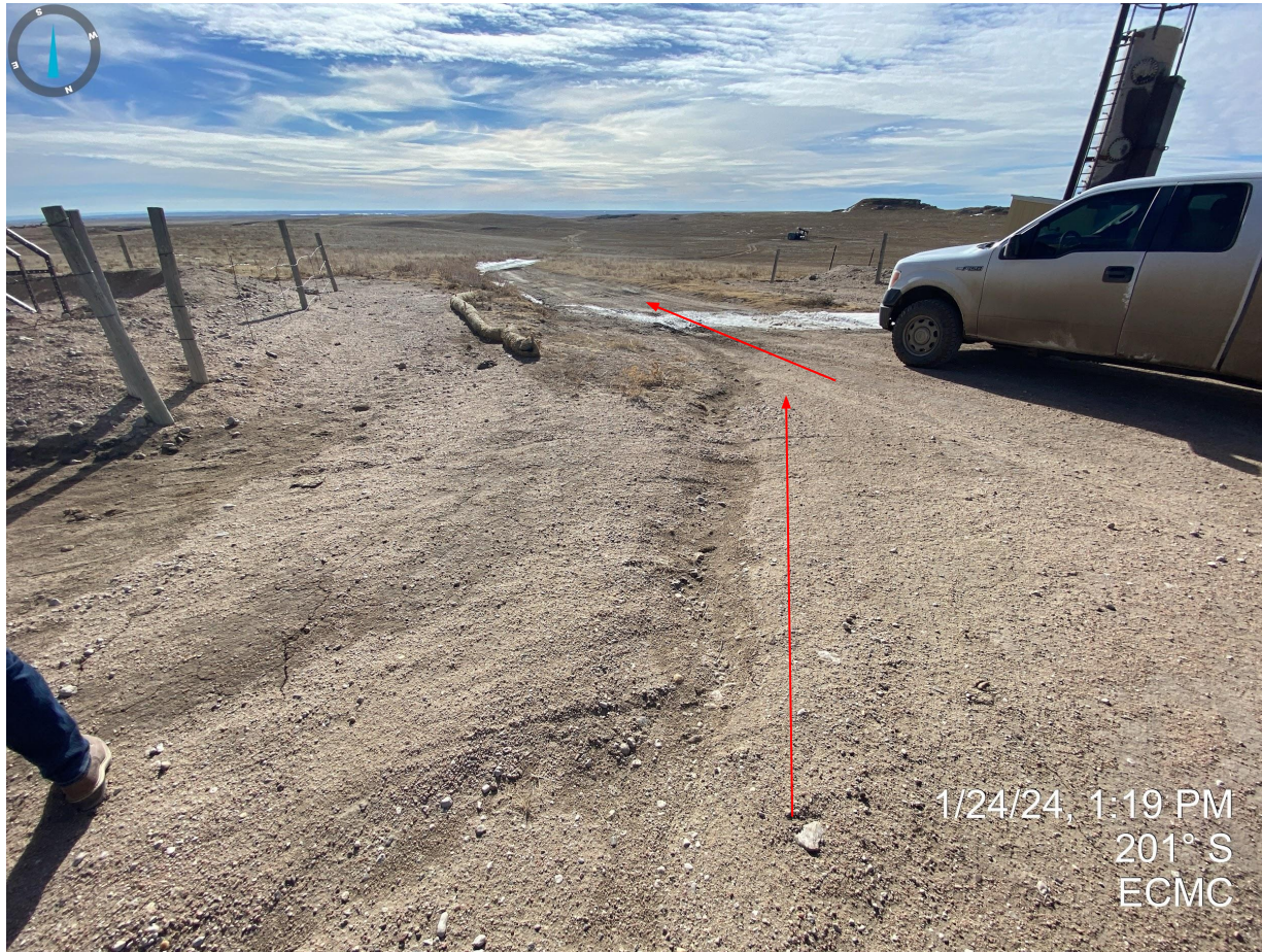
Photo 1. Erosion degradation occurring along the production areas and the access road leading to the well.