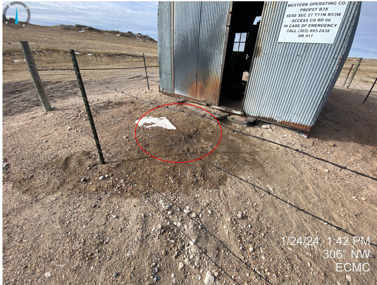
Photo 12. Stained soil previously observed near pumpjack exhaust does not appear to have been cleaned up (red circle); other discoloration is likely from snowmelt.