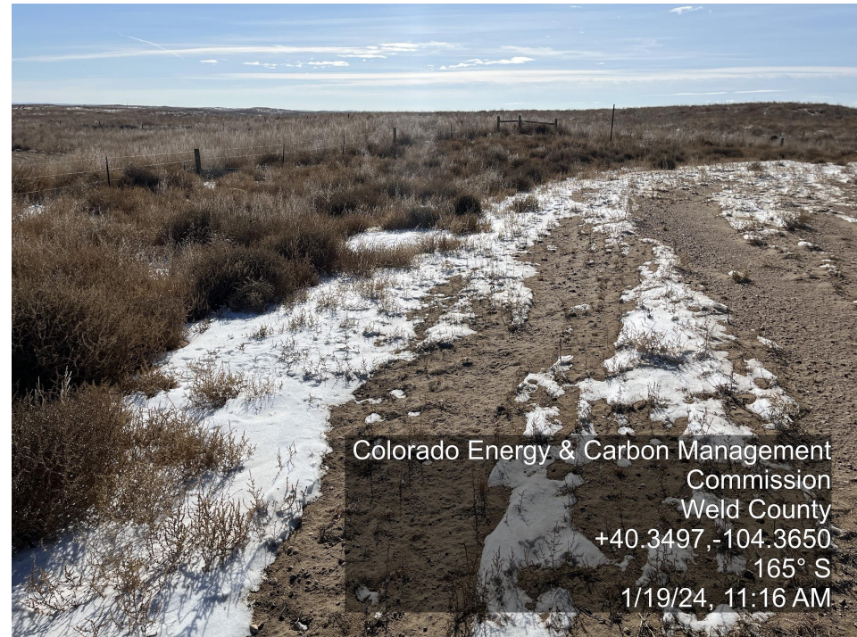
Photo 2. The photo was taken at the well location facing South. The photo illustrates the interim areas are dominated by Russian thistle.