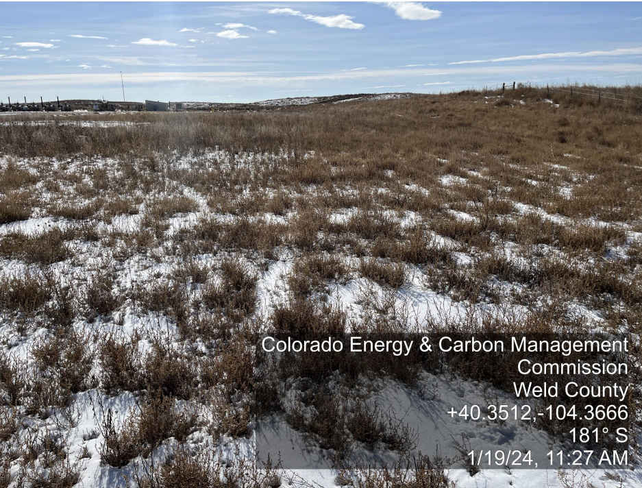
Photo 5. The photo was taken at the well location facing South. Refer to the comment for photo 2.