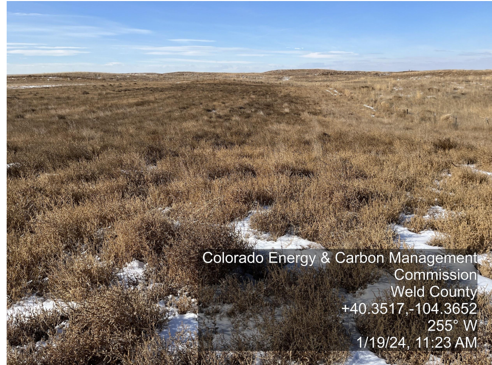
Photo 4. The photo was taken at the well location facing West. Refer to the comment for photo 2.