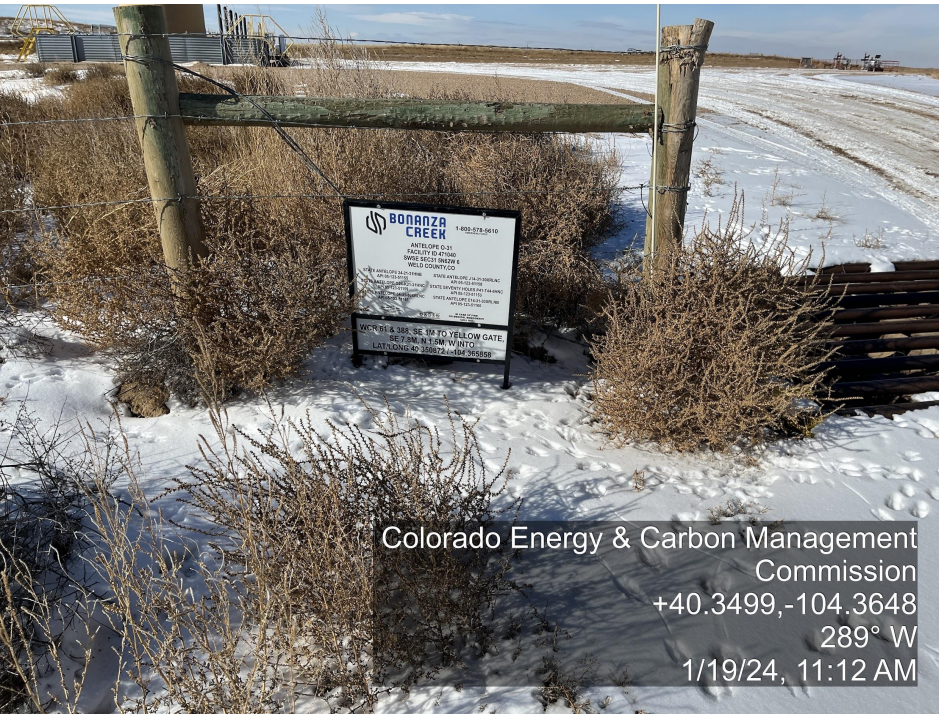
Photo 1. The photo was taken at the well location facing West. The photo illustrates the operator location sign.