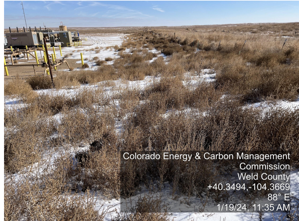
Photo 6. The photo was taken at the well location facing East. Refer to the comment for photo 2.