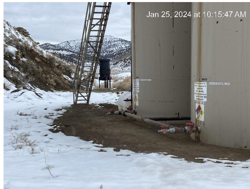
Tank battery from Southeast corner