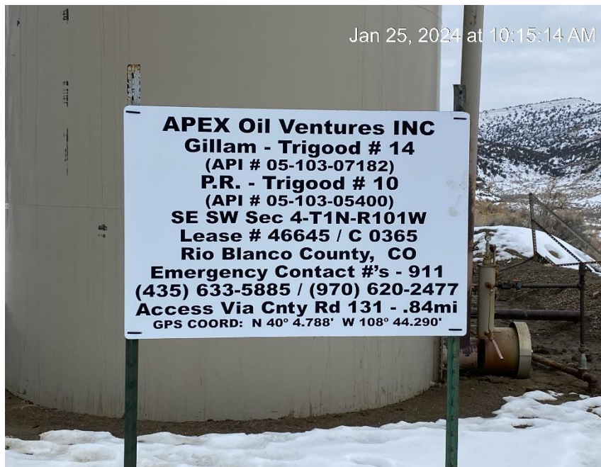
Sign at tank battery