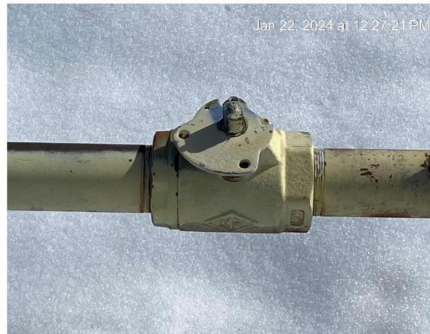
Valve cracked open from #10 well on 1/22/24