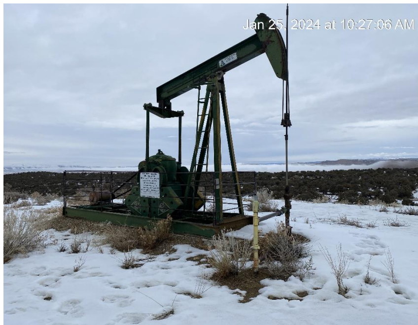
Unused equipment since 8/19/23