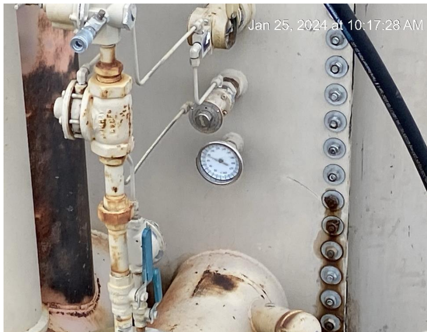
Burner on West tank operating