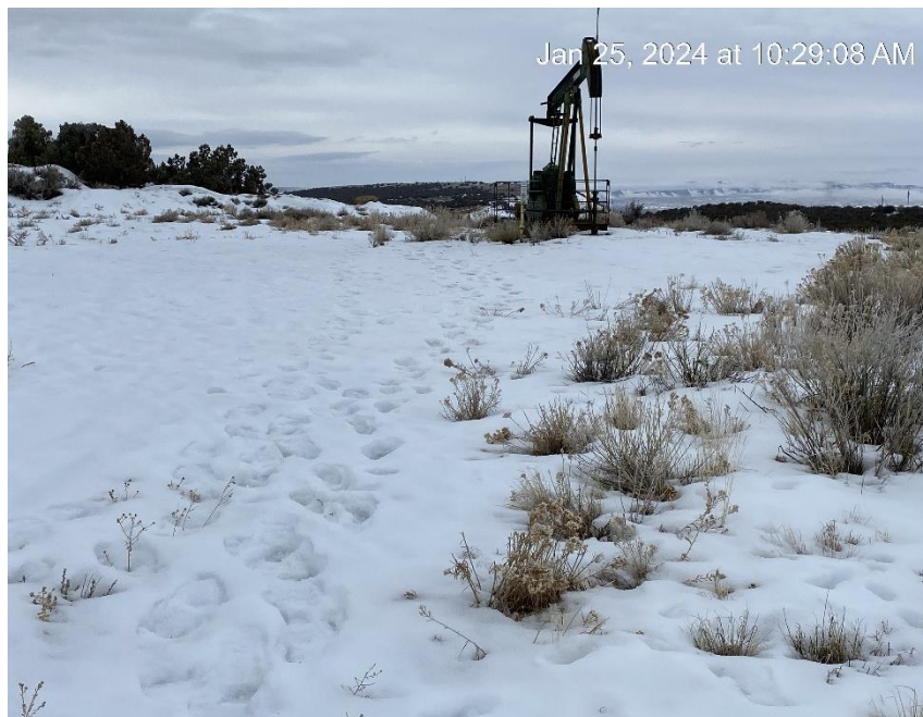
Entrance to location