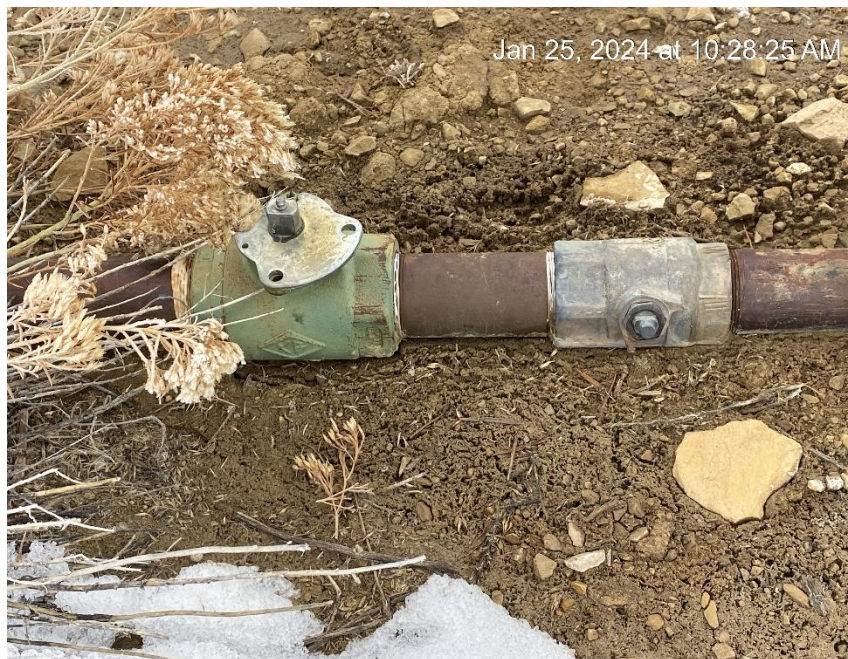
Casing valve still open from 1/18/24 to 1/25/24