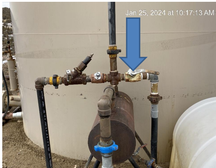
Valve open from #10 well