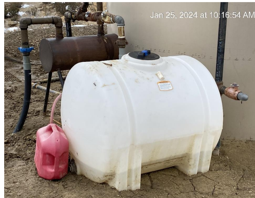
Debris since 8/23/23