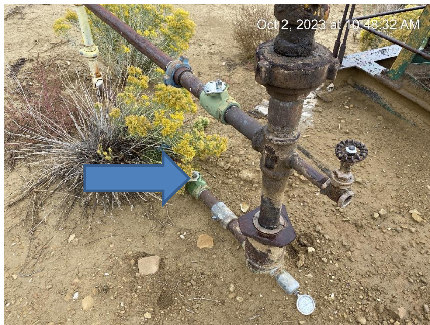
Casing valve to tank battery closed on 10/2/24