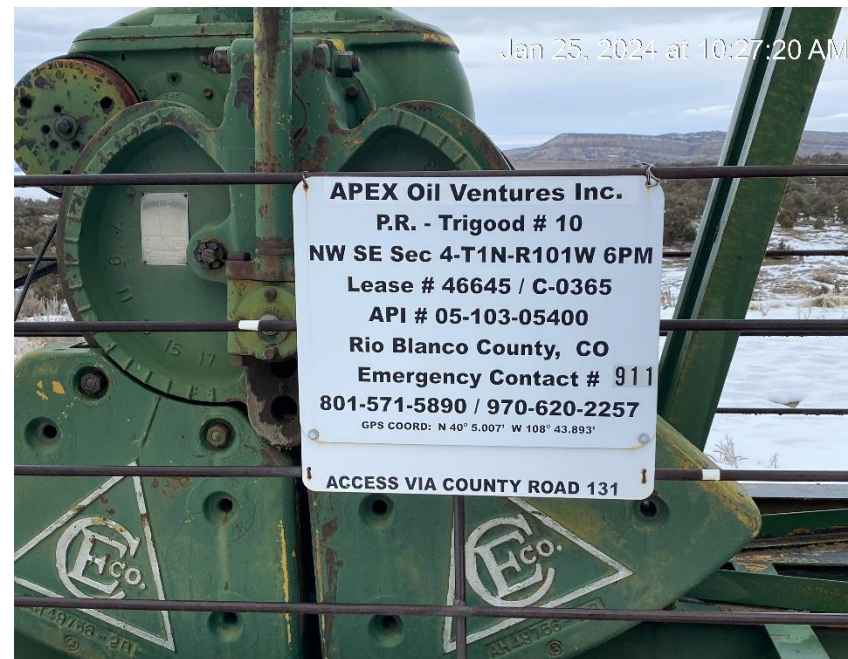
Sign at well pad