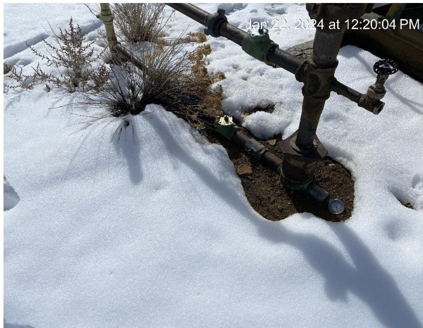
Flow line to tank battery