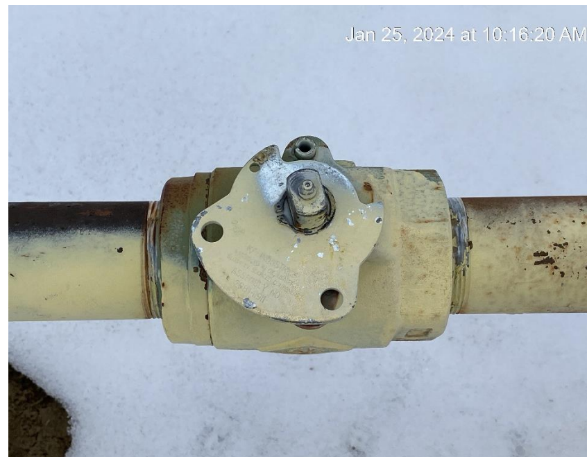
Valve cracked open on #10 flowline on 1/25/24