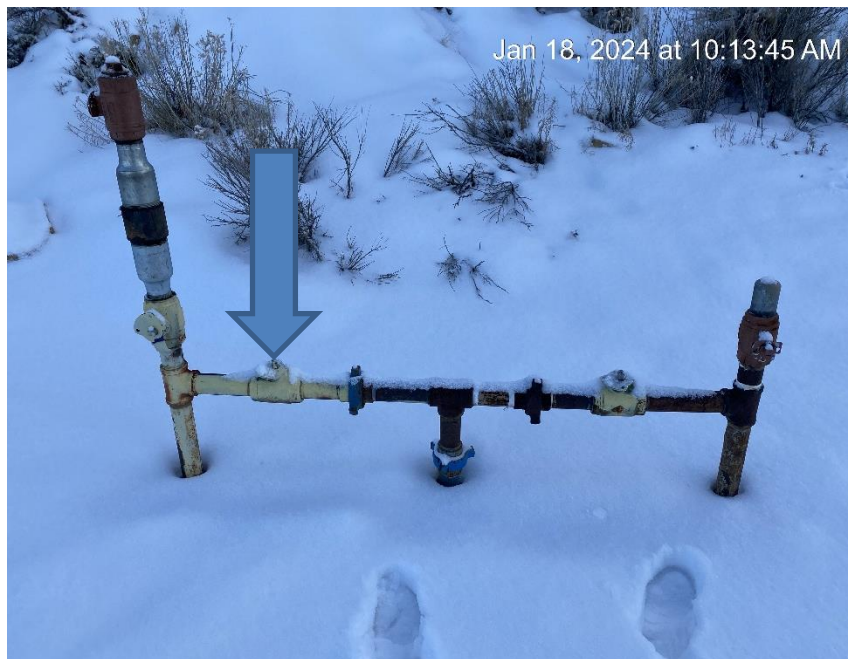
Valve cracked open from #10 well on 1/18/24