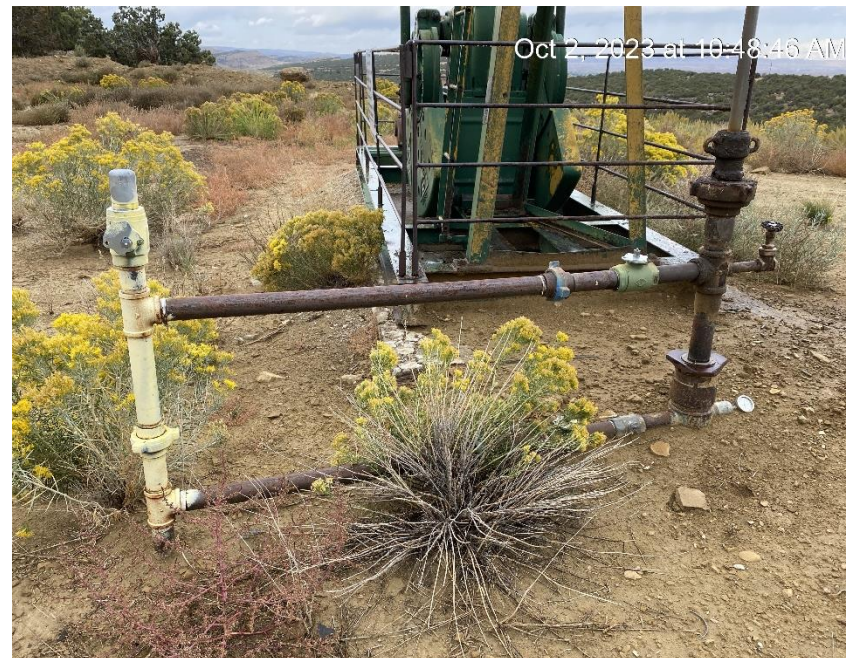
#10 flow line to offsite tank battery in October