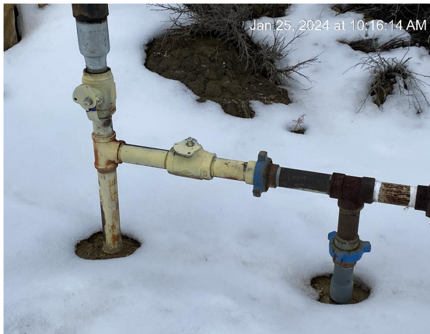
Flowline from #10 well