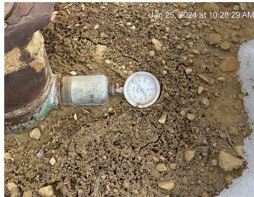
Casing gauge on #10 wellhead on 1/25/24