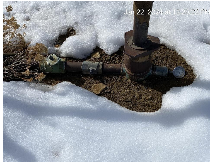
Casing valve open to offsite tank battery