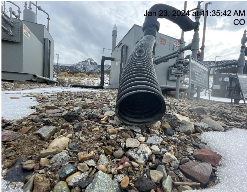
Photo # 3518 Flowline heating insulation open ended /wildlife hazard/available for entry by wildlife