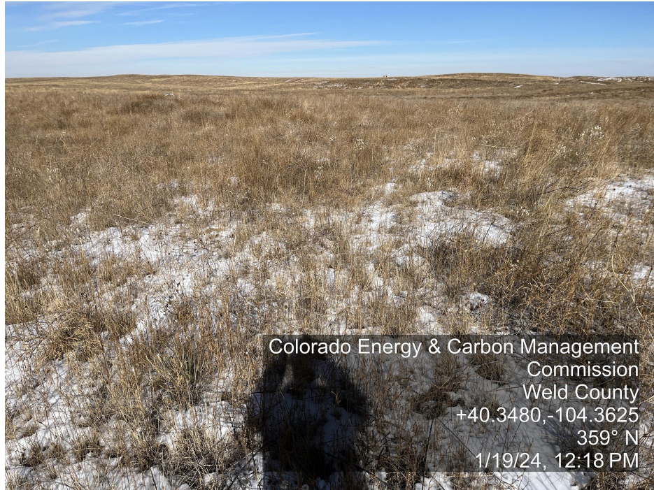
Photo 1. The photo was taken at the abandoned well location facing North. The photo illustrates the location has not been built.