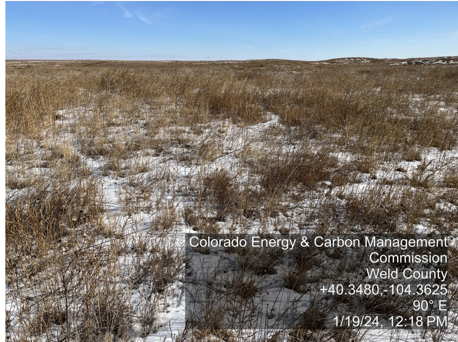
Photo 2. The photo was taken at the abandoned well location facing East. Refer to the comment for photo 1.