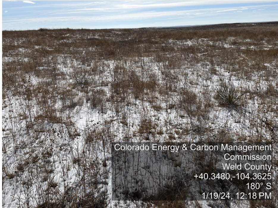
Photo 3. The photo was taken at the abandoned well location facing South. Refer to the comment for photo 1.