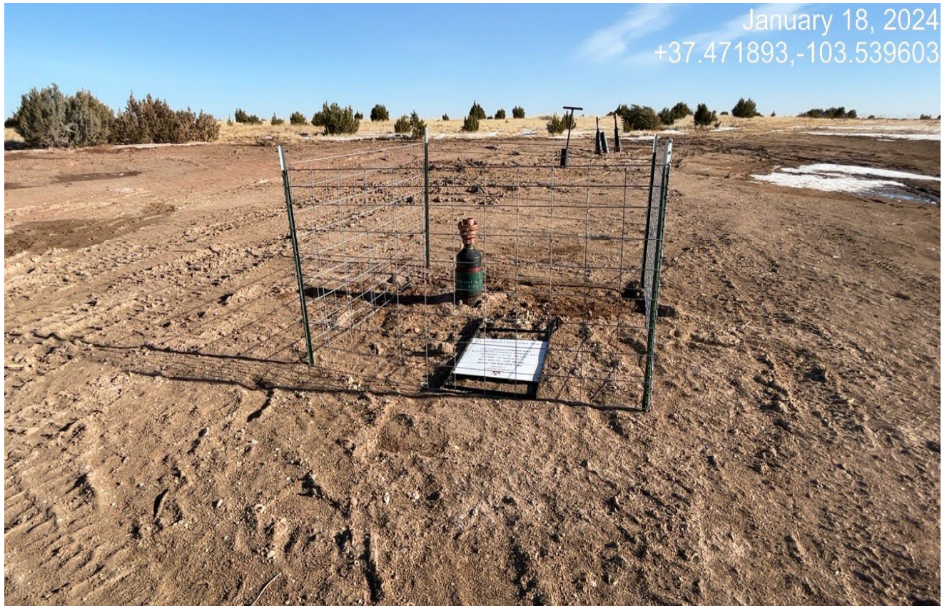
Photo 4. Facing southeast toward the well. The sign is laying on the ground not installed.