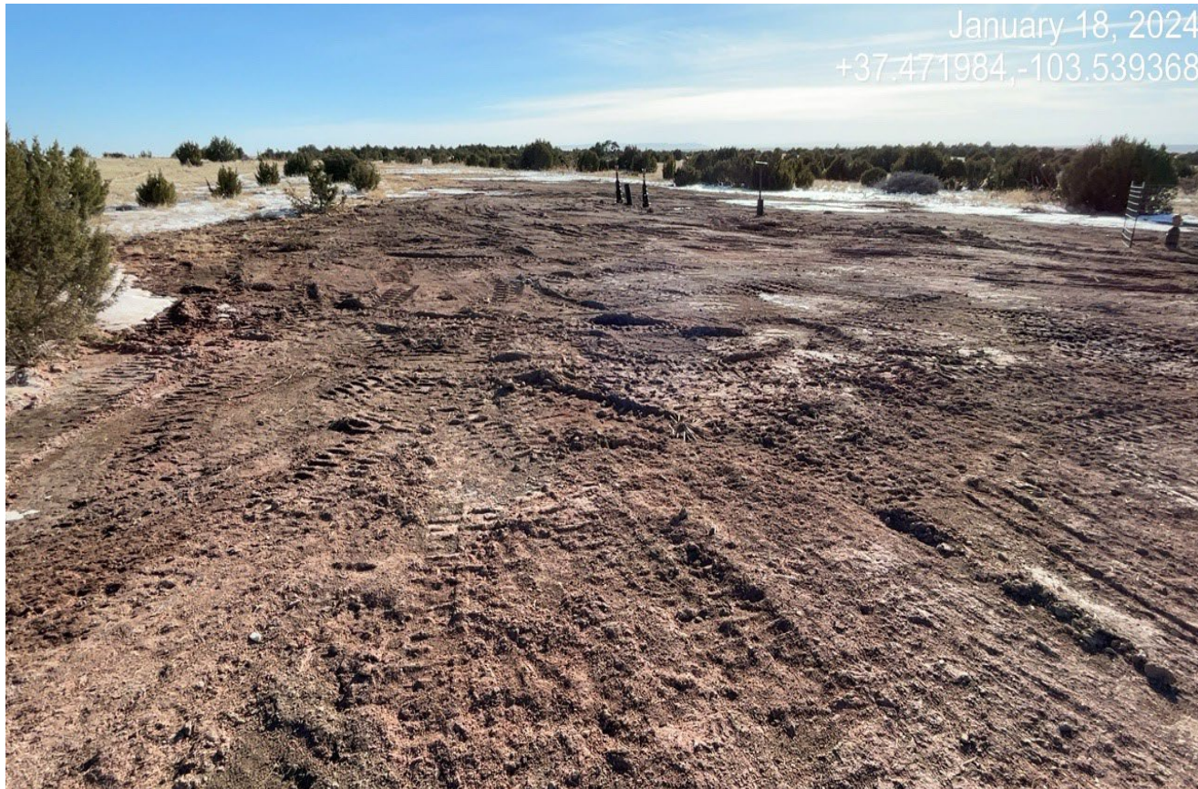
Photo 5. Facing south at the east side of the location. The drill cuttings have been removed but there is still a reddish color in this area that remains which is indicative of the drill cuttings.