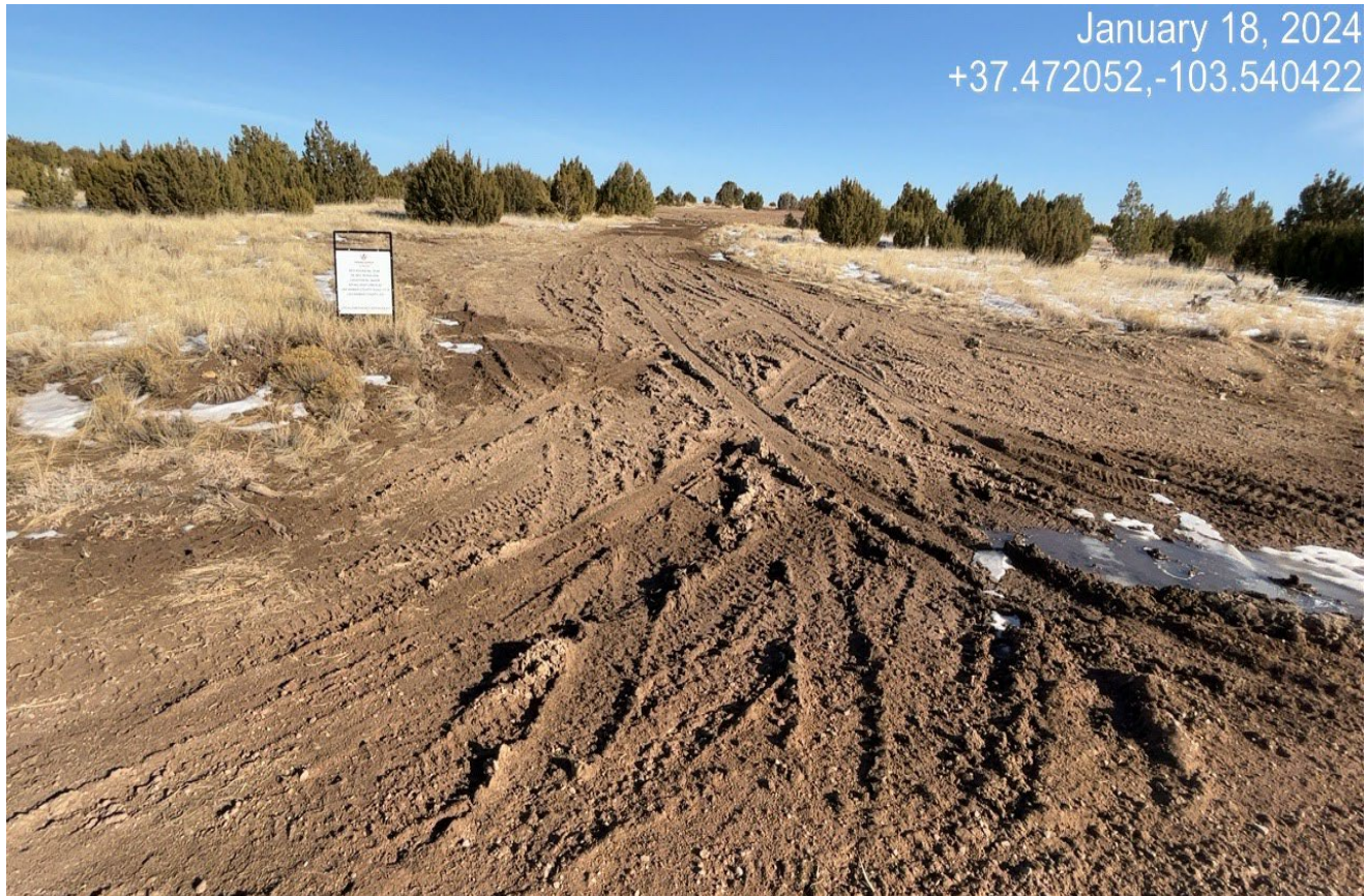
Photo 1. Facing east toward the access road standing on County Road 177. There is vehicle rutting and tracking of sediment onto the County Road. BMP's must installed to prevent sediment tracking and road degradation.