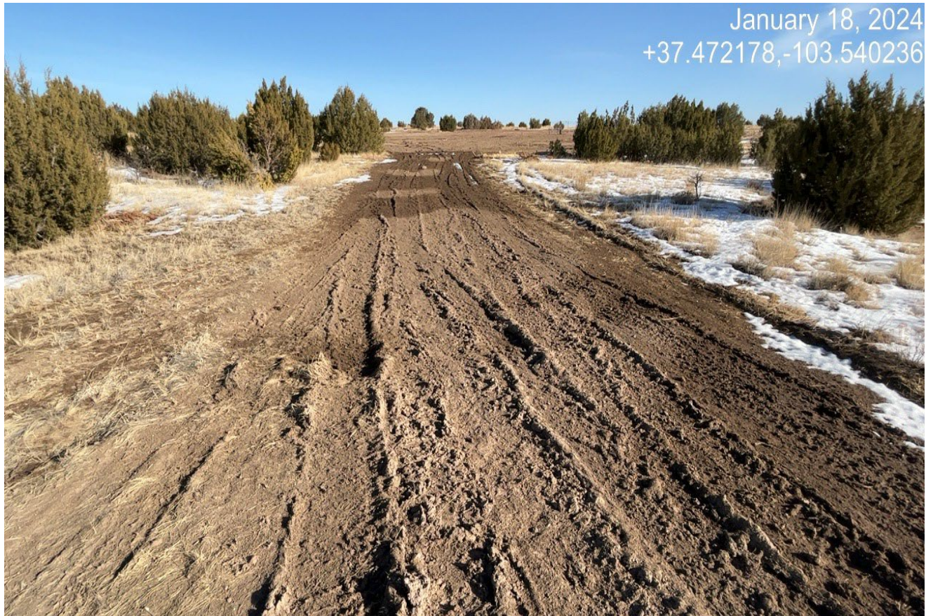
Photo 2. Facing east along the access road which is not stabilized. The topsoil of the road is not being protected from degradation. The access road should be seeded and reclaimed.