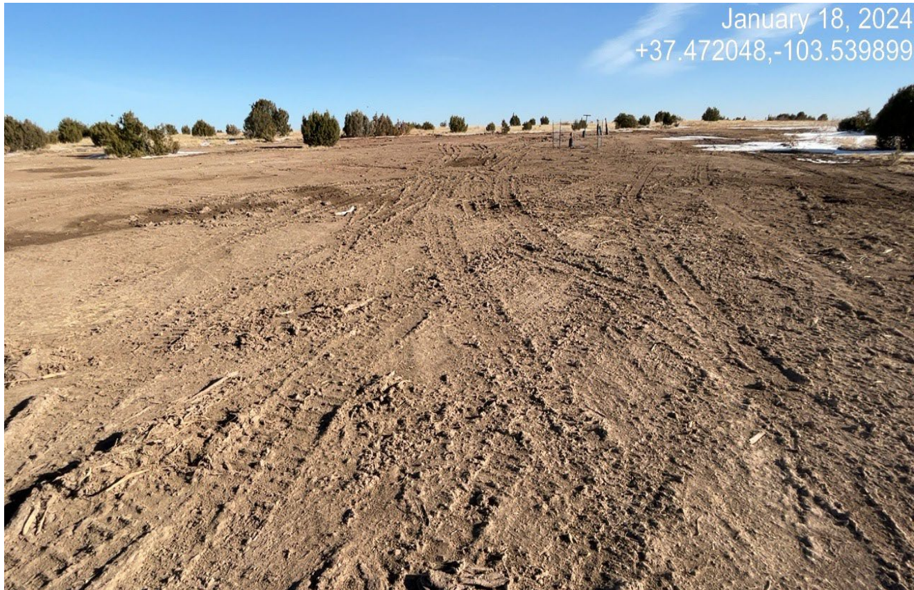
Photo 3. Facing southeast toward the location. All disturbed areas of the location will need to be decompacted and seeded prior to the upcoming growing season.