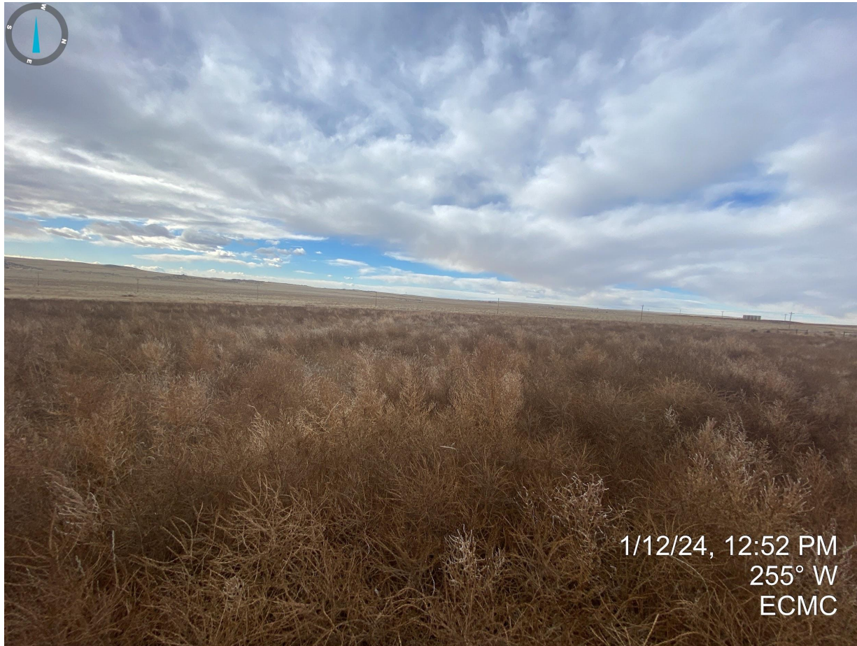
Photo 2. Eastern interim areas, facing west. See comments in Photo 1.