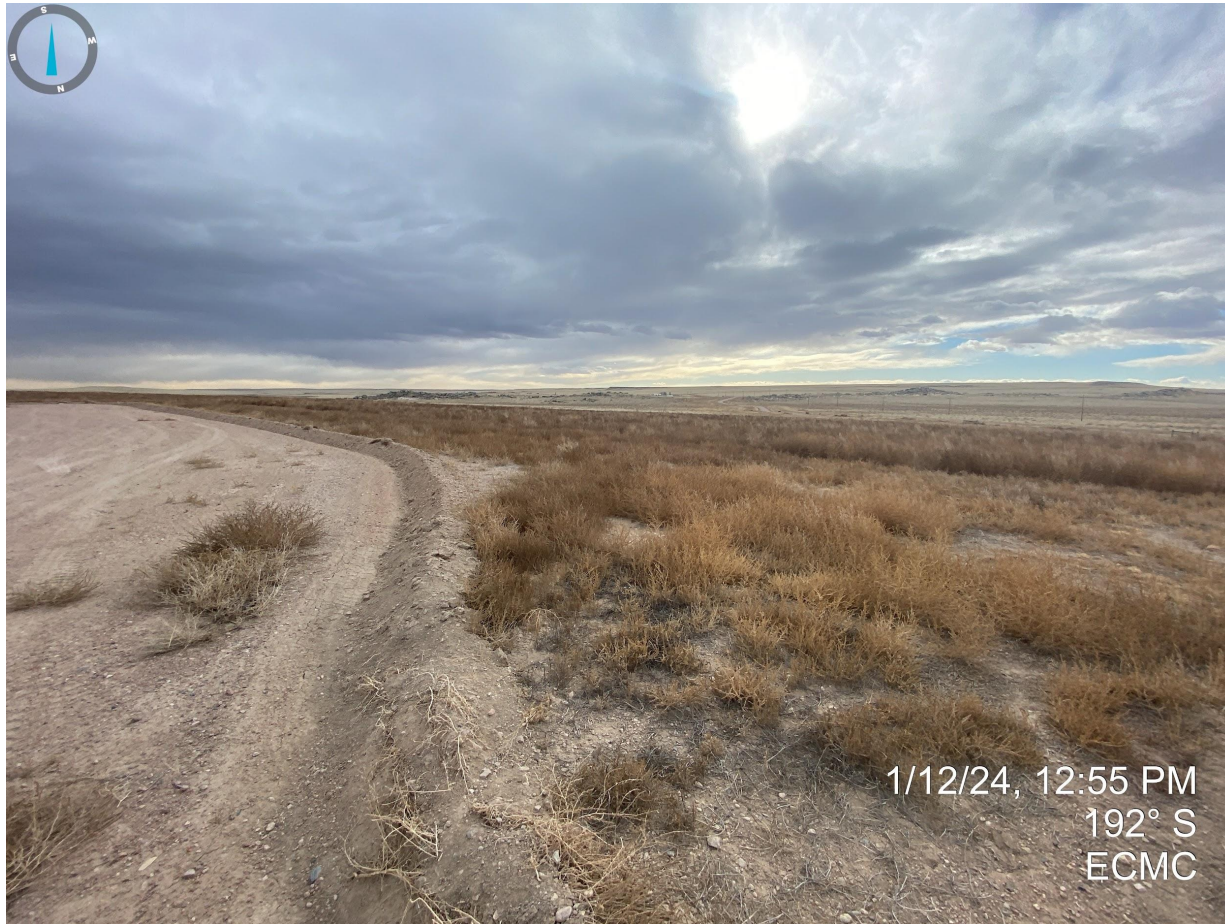
Photo 5. Southwest interim areas, near the entrance. See comments in Photo 1.