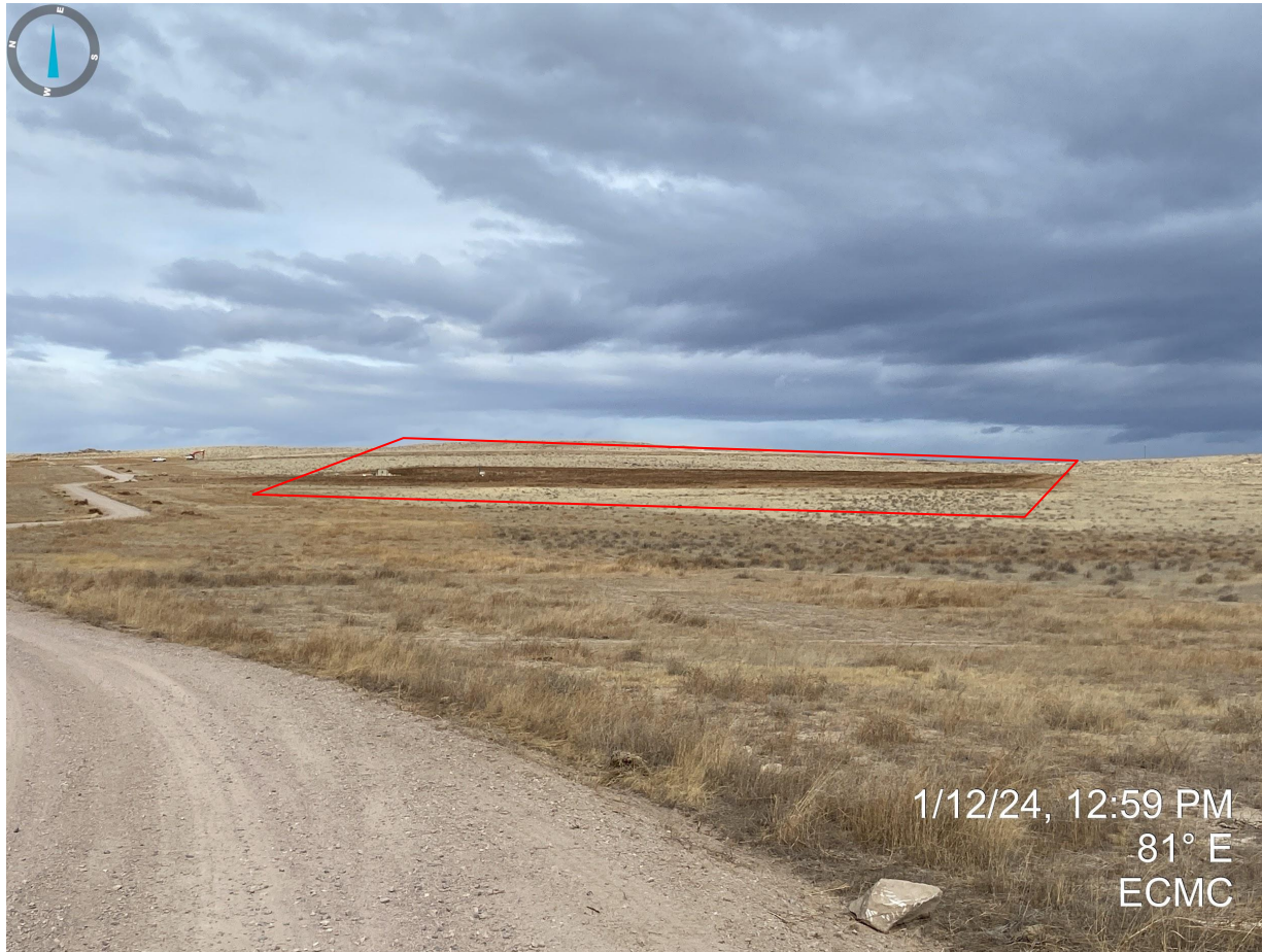
Photo 7. Taken south of the location. The red polygon illustrates the location and predominant weedy vegetation cover (darker vegetation).