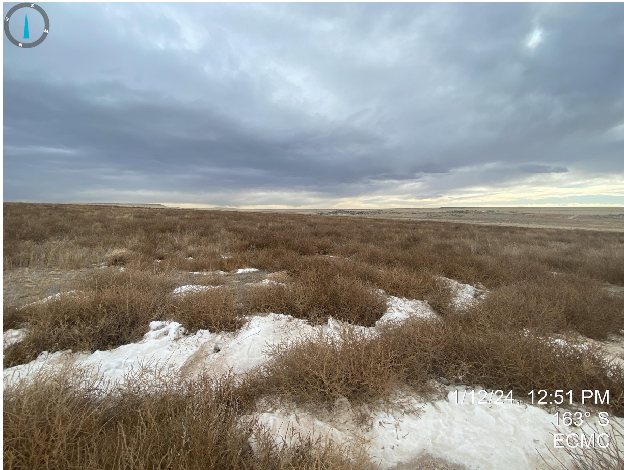
Photo 1. Southern interim areas, facing south. The interim areas are predominantly undesirable vegetation (e.g. russian thistle and kochia). It does not appear the location has been actively managed for weed control during the previous growing season. Additional reclamation activities are required.