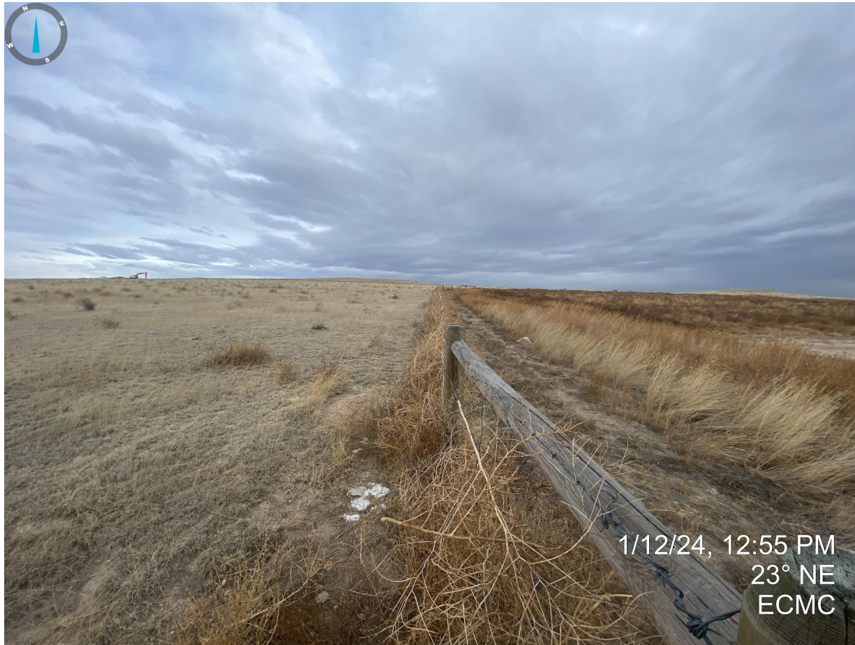
Photo 6. Taken from the western side of the location. The left side of the fence is undisturbed reference area with native, perennial vegetation. The right side of the fence is the location with undesirable vegetation that is not reflective of the reference areas.