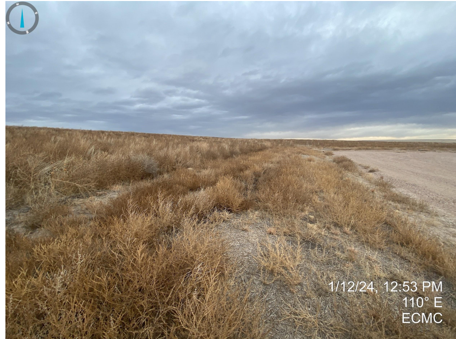
Photos 3 & 4. Northern interim areas, facing northwest and east. See comments in Photo 1.