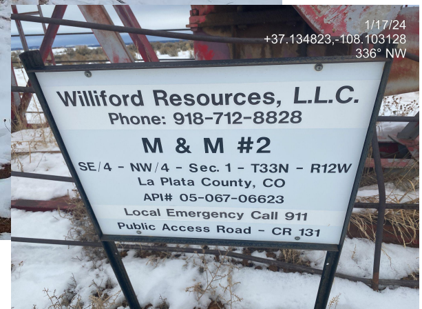
Photo 1. View of the disturbance from the entrance facing center.