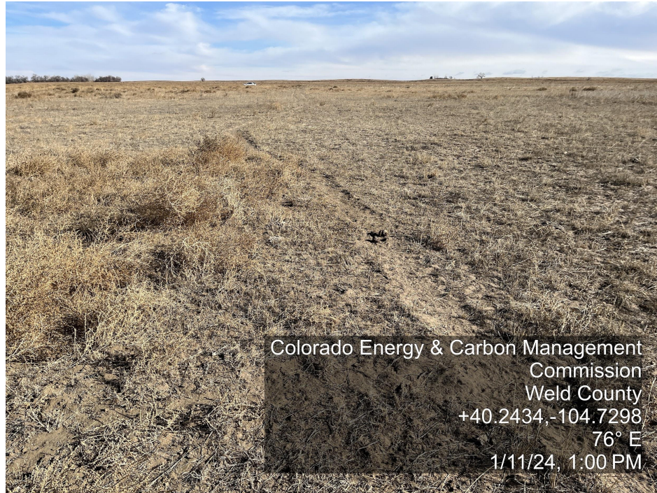
Photo 4. The photo was taken at the well location facing East. Refer to the comment for photo 2.