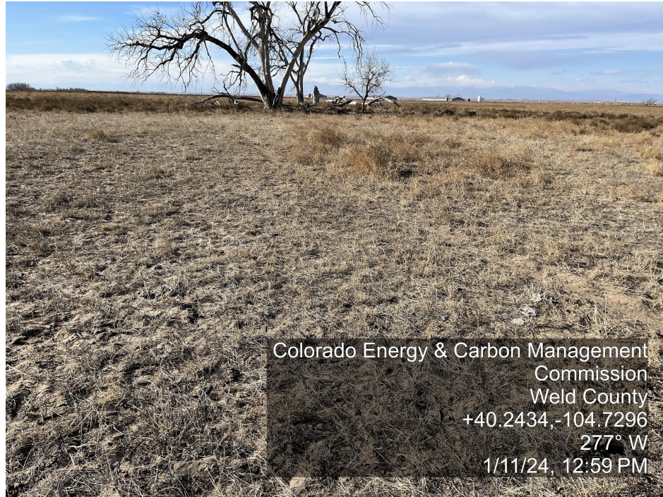
Photo 2. The photo was taken at the well location facing West. The photo illustrates the well location is dominated by cereal rye, russian thistle and curly cup gumweed.