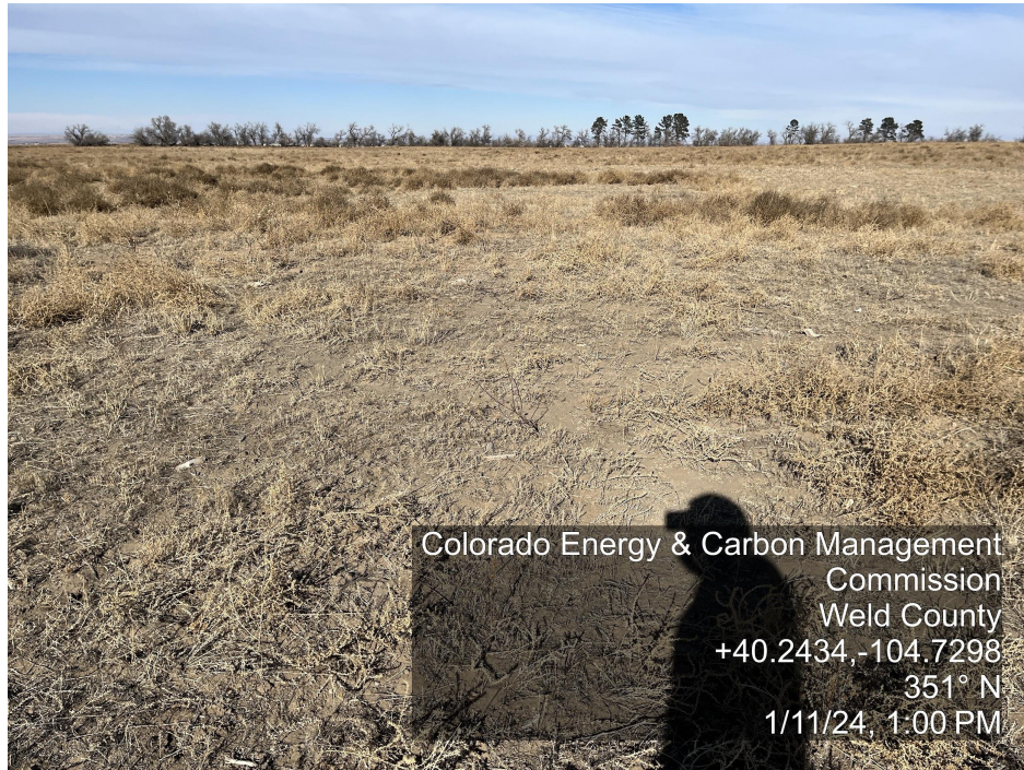
Photo 3. The photo was taken at the well location facing North. Refer to the comment for photo 2.