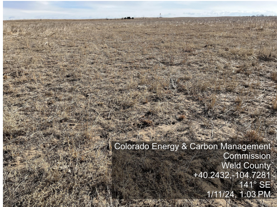
Photo 6. The reference photo was taken near the well location facing Southeast.