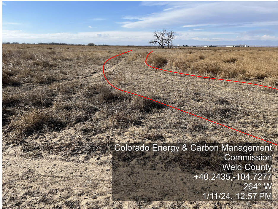
Photo 1. The photo was taken at the well location facing West. The photo illustrates the access road to the well location.