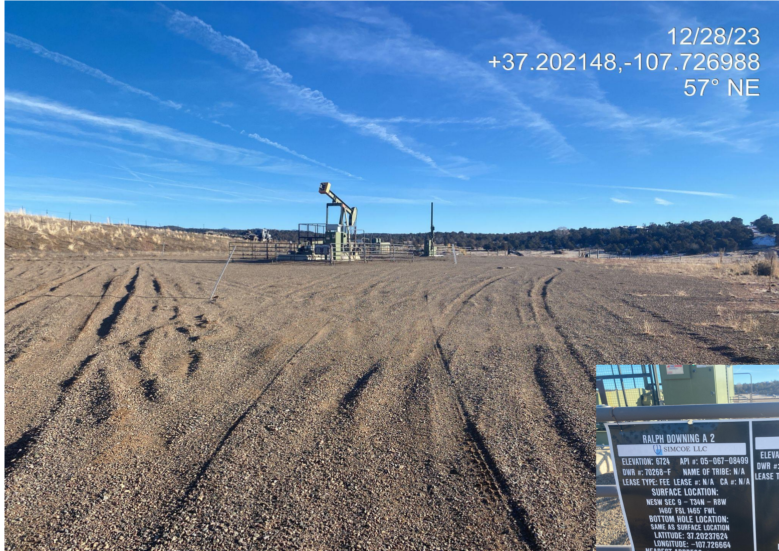
Photo 1. View of the well disturbance from the entrance facing center.