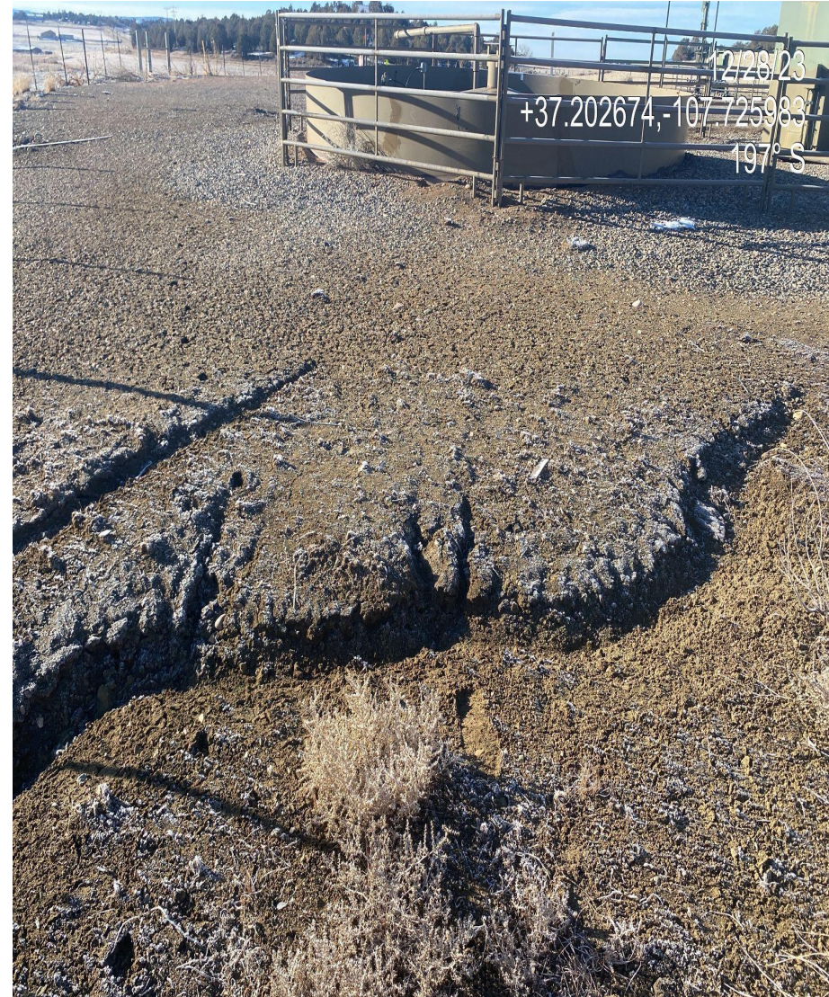
Photo 3. View of additional rill/gully erosion forming on the eastern edge of the disturbance.