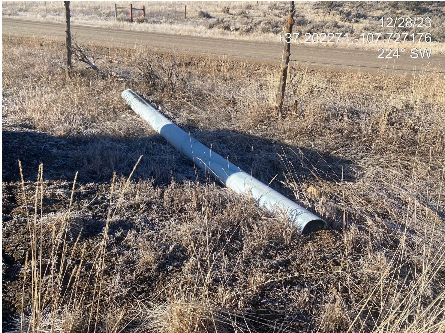
Photo 4. View of unused equipment/debris observed in the western interim reclamation area.