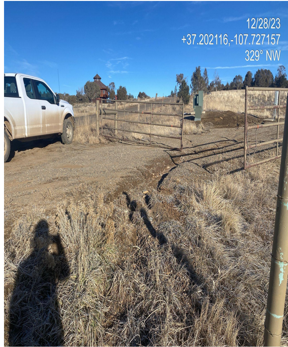
Photo 2. View of rill/gully erosion forming at the access point.