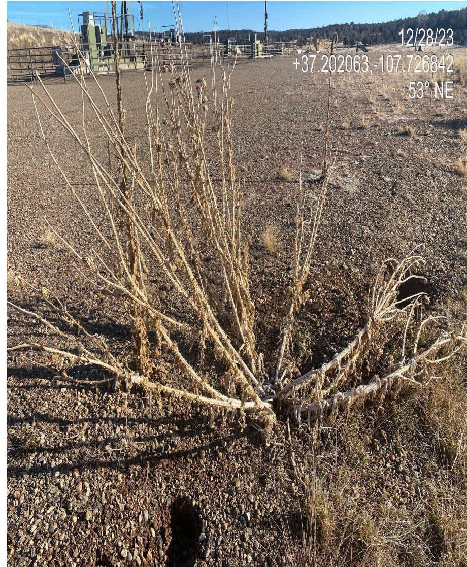
Photo 5. View of musk thistles observed in various locations throughout the disturbance.