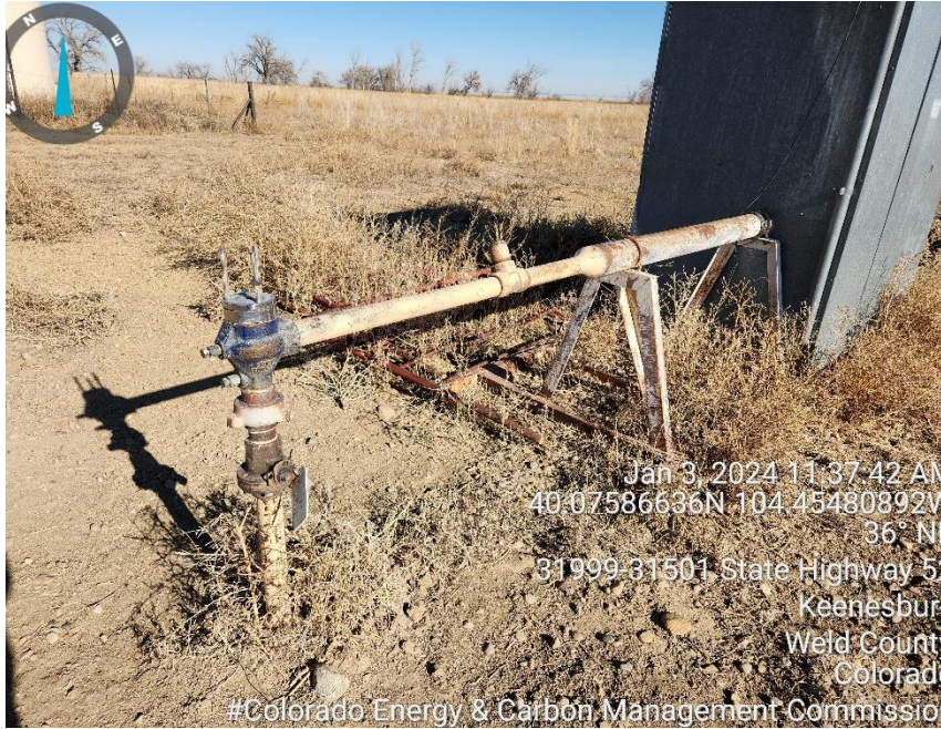
Photo 9 Meter tube LOTO and pined pulled.