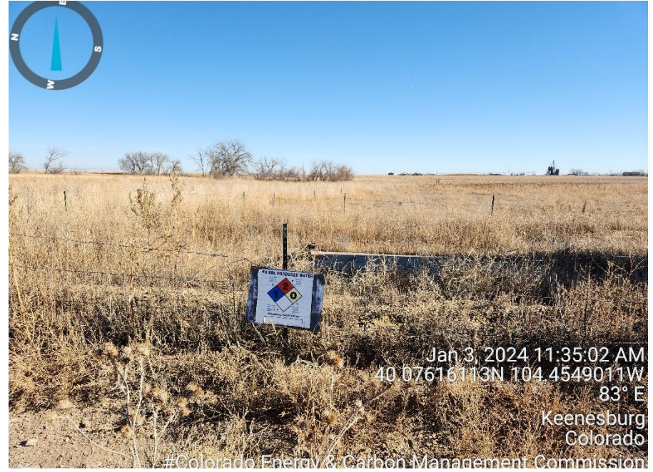
Photo 4 Produced water vault.