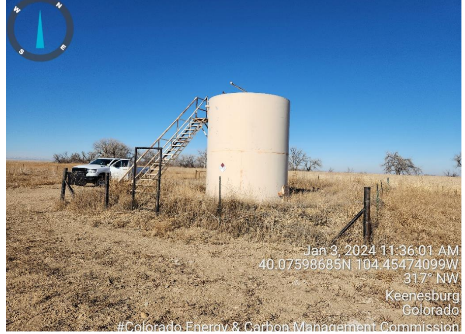
Photo 6 DEAD WEEDS DEBRIS