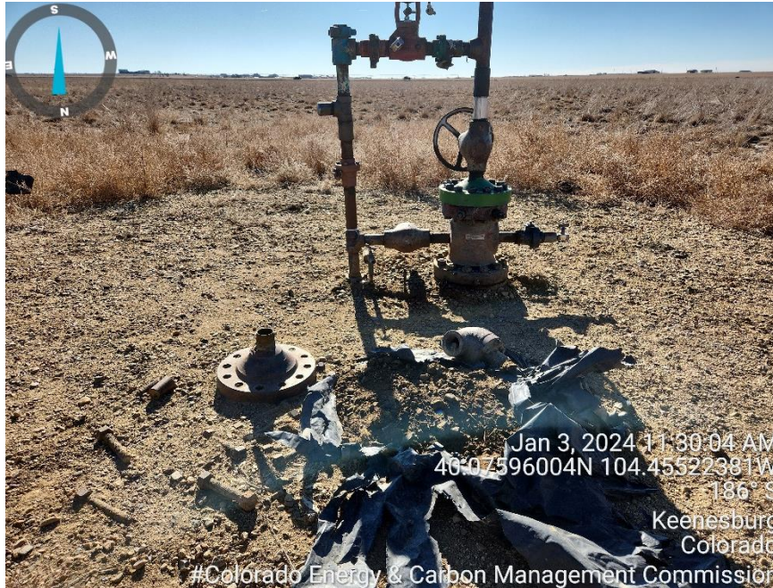
Photo 3 What appears to be contaminated soil and unused equipment