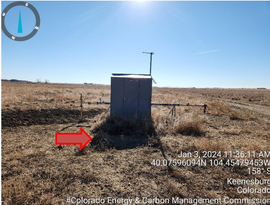
Photo 7 Meter house DEAD WEEDS DEBRIS. Unused equipment (cattle panels), Meter tube has been LOTO since 2020 and pined pulled house considered unused equipment.