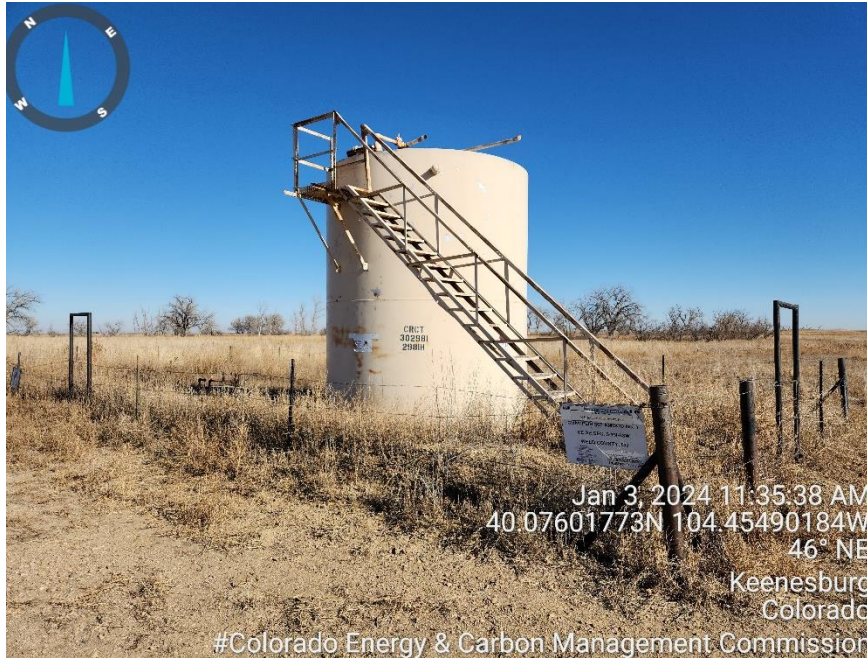
Photo 5 TNK BTRY Battery sign peeling need to be replaced along with NFPA placards DEAD WEEDS DEBRIS