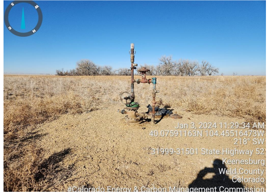
Photo 2 Well head. No sign DEAD WEEDS DEBRIS