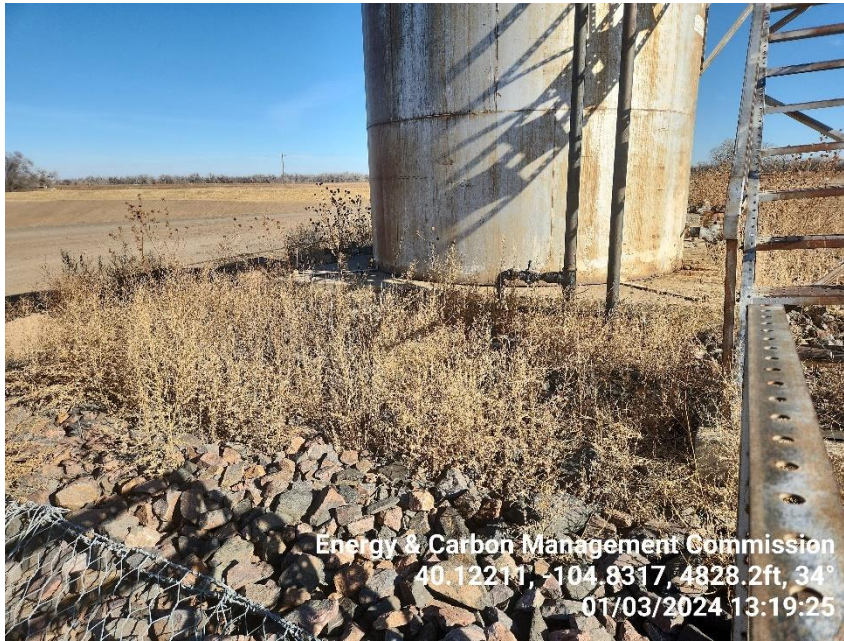
Photo 17 TB berm is overrun with dead undesirable vegetation.