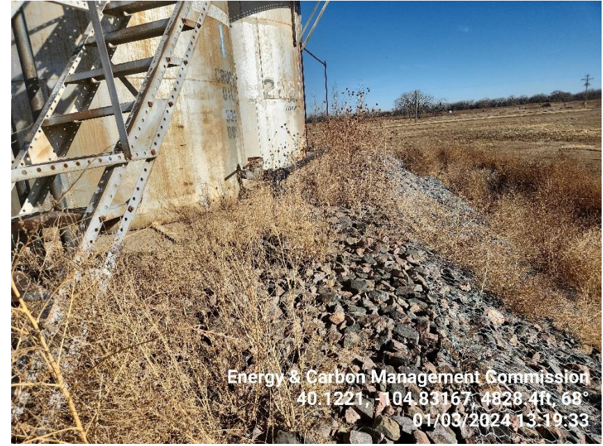
Photo 18 TB overrun with dead undesirable vegetation.