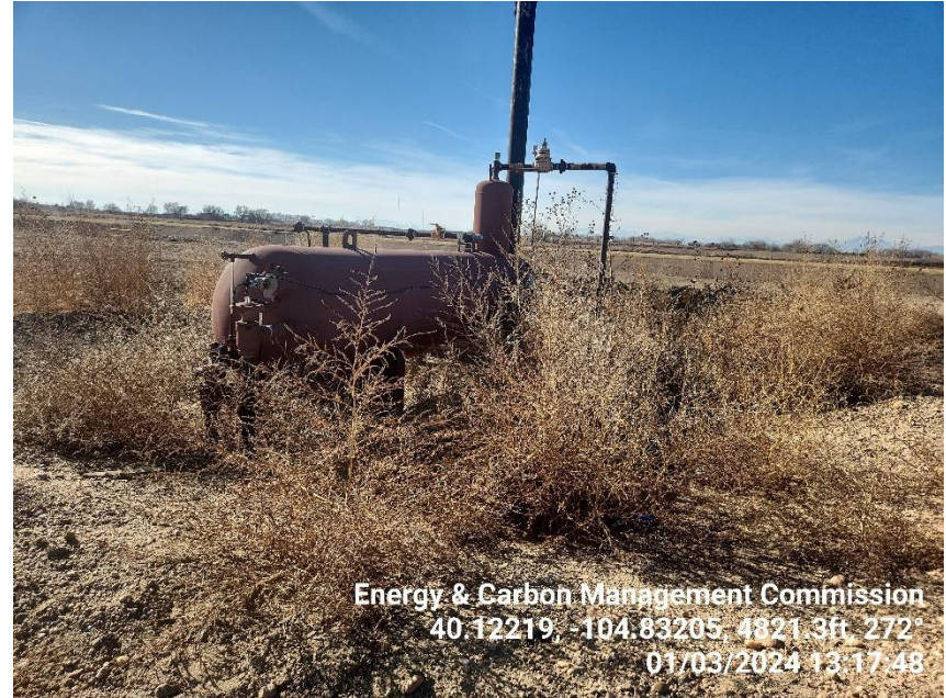
Photo 12 Horizontal Heated Separator overrun with dead undesirable vegetation.