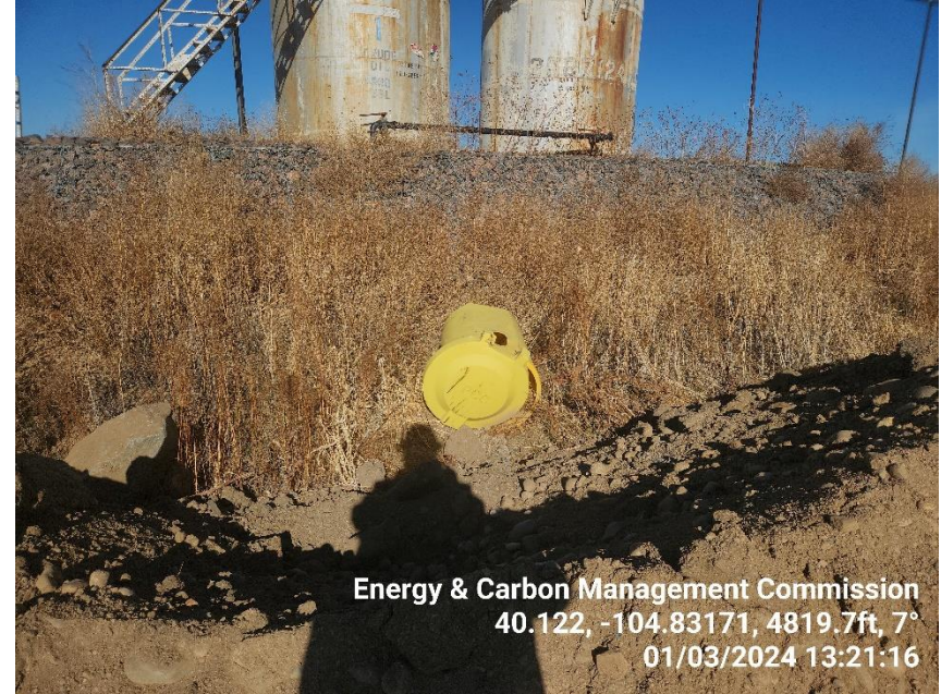
Photo 22 TB overrun with dead undesirable vegetation & trash.