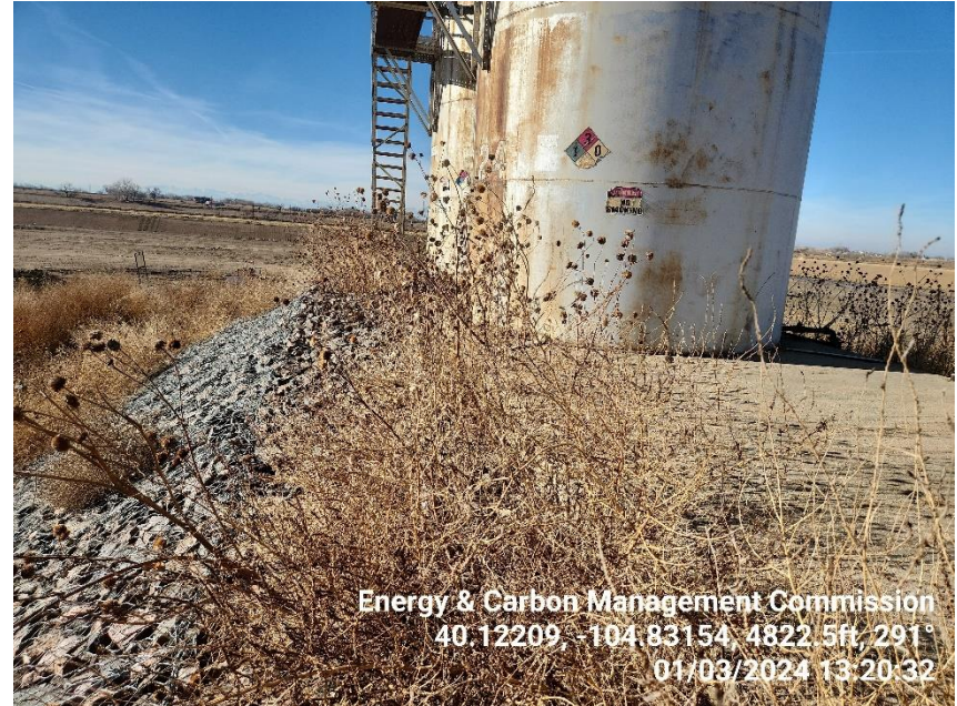
Photo 20 TB overrun with dead undesirable vegetation.