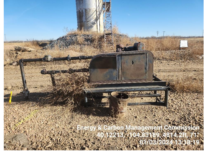
Photo 14 Unused aux pump overrun with dead undesirable vegetation & trash.