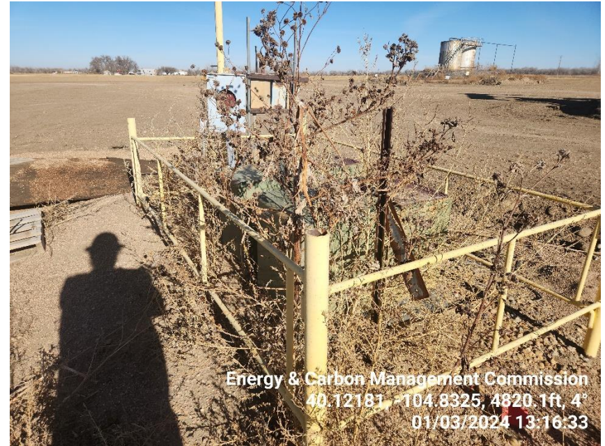
Photo 8 Unused Ancillary equip. overrun with dead undesirable vegetation.