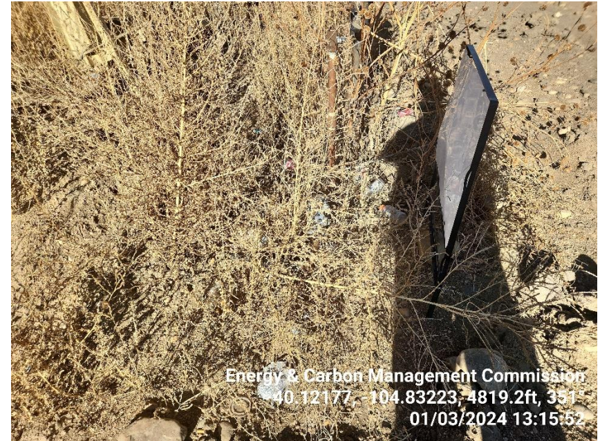
Photo 4 Wellhead overrun with dead undesirable vegetation and trash.