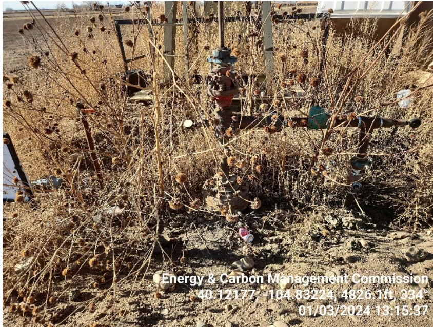
Photo 3 Wellhead overrun with dead undesirable vegetation and trash.