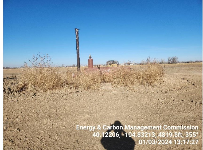
Photo 10 Horizontal Heated Separator overrun with dead undesirable vegetation.