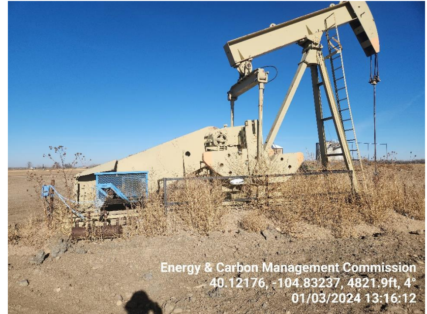
Photo 6 Wellsite overrun with dead undesirable vegetation and trash.