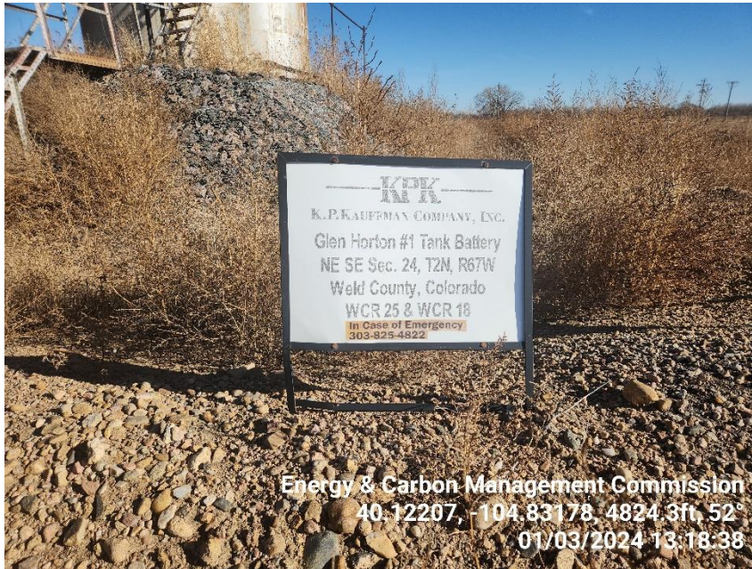
Photo 15 TB sign, TB berm is overrun with dead undesirable vegetation & trash.