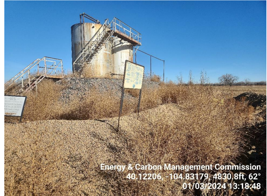
Photo 16 TB overrun with dead undesirable vegetation & trash.