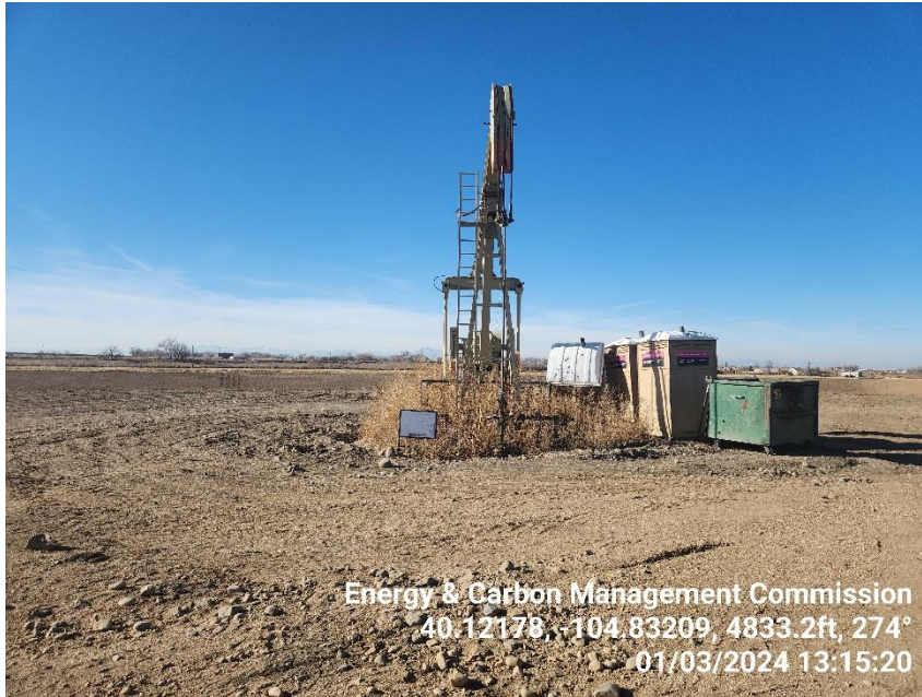
Photo 1 Wellsite.