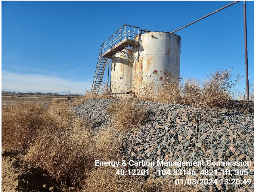
Photo 21 TB berm is overrun with dead undesirable vegetation.