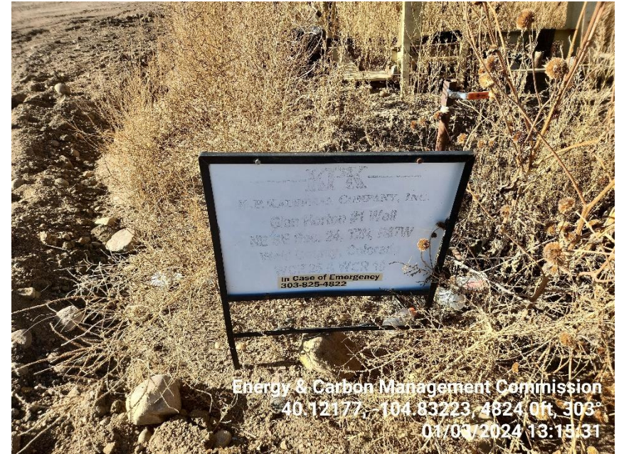
Photo 2 WH sign faded and needs replaced.