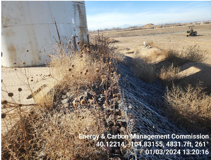
Photo 19 TB berm is overrun with dead undesirable vegetation.