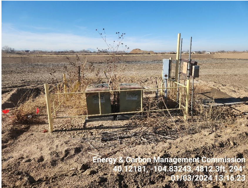
Photo 7 Unused Ancillary equip. overrun with dead undesirable vegetation.