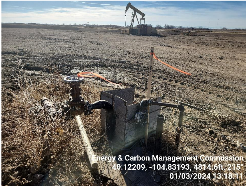
Photo 13 Valved Flow line overrun with dead undesirable vegetation & trash.