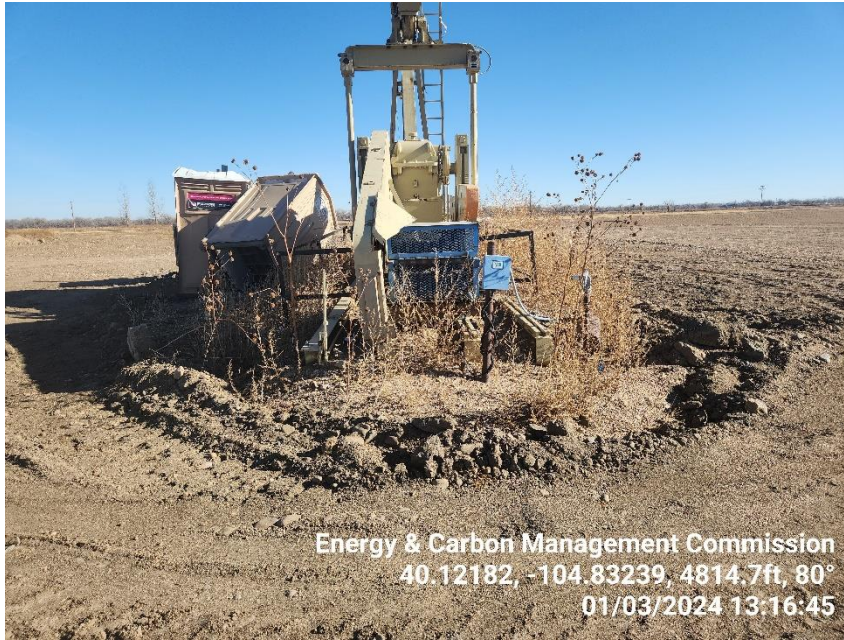
Photo 9 Wellsite overrun with dead undesirable vegetation & trash.