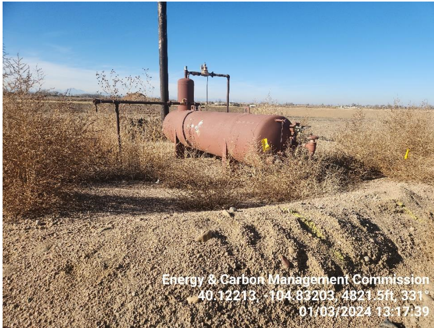
Photo 11 Horizontal Heated Separator overrun with dead undesirable vegetation & trash.