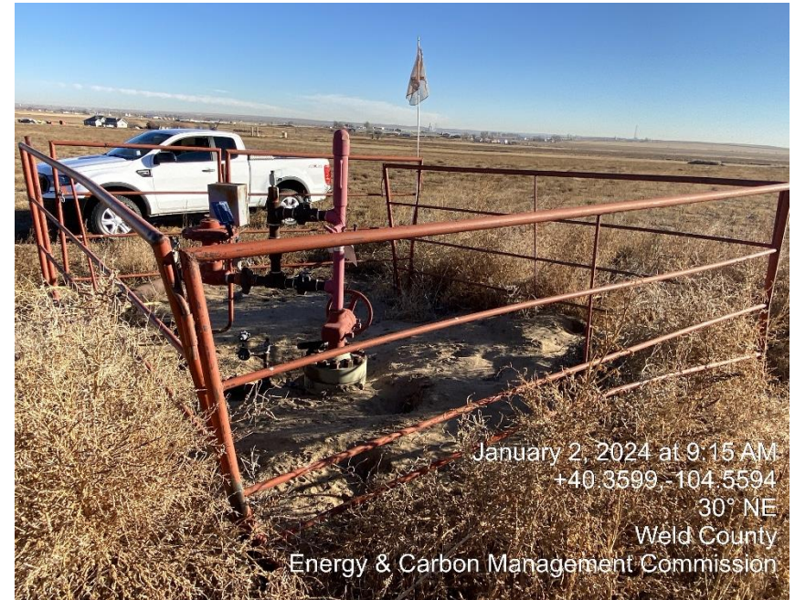
Missing Well Sign