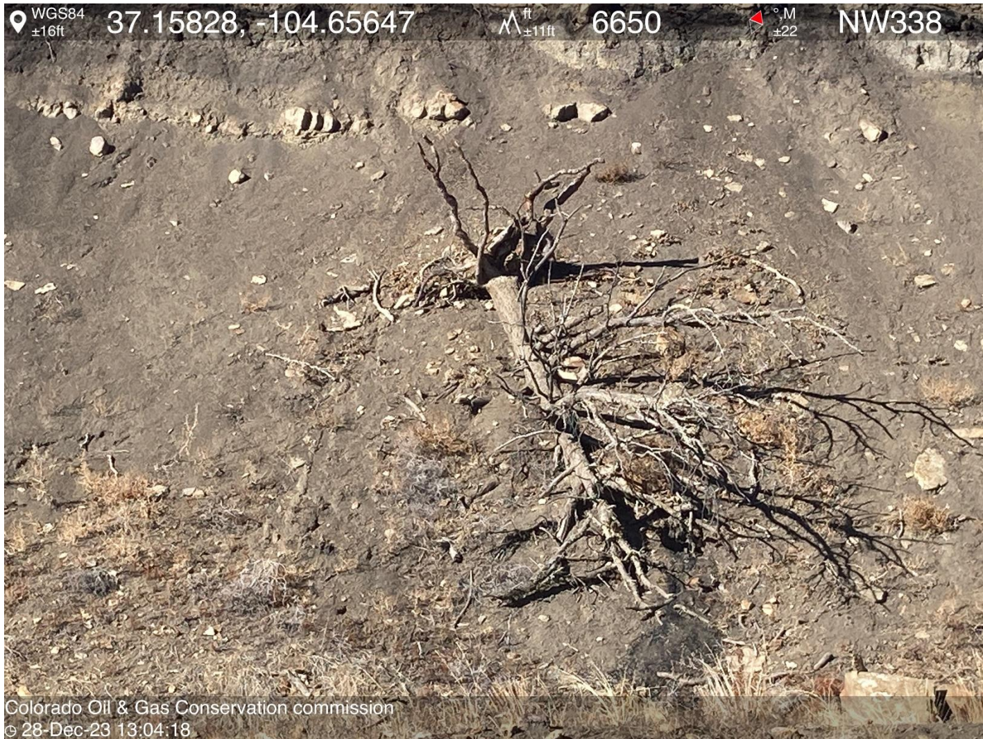
PHOTO 4: TRASH/DEBRIS ON NORTH SIDE OF LOCATION (DEAD TREES HAVE FROM TOP OF CUT). REMOVE TRASH/DEBRIS PER RULE 606. CA DATE 1-28-2024.