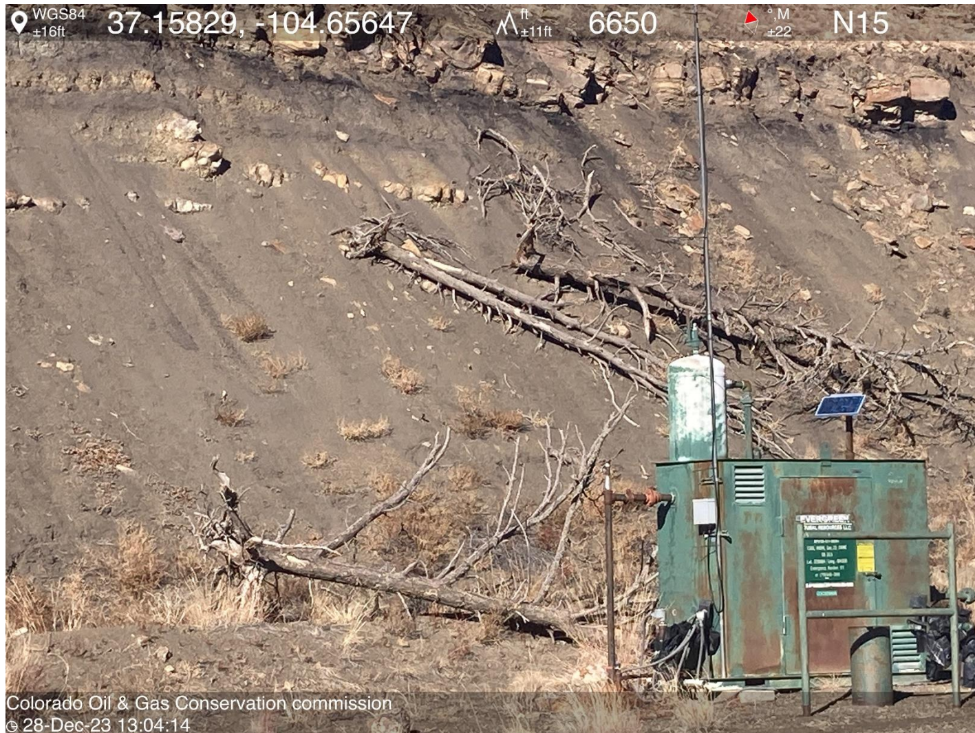
PHOTO 5: TRASH/DEBRIS ON NORTH SIDE OF LOCATION (DEAD TREES HAVE FROM TOP OF CUT). REMOVE TRASH/DEBRIS PER RULE 606. CA DATE 1-28-2024.