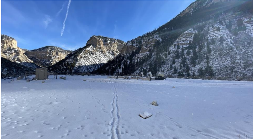
North West corner of location.