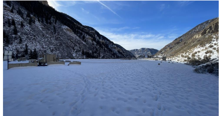
North East corner of location.