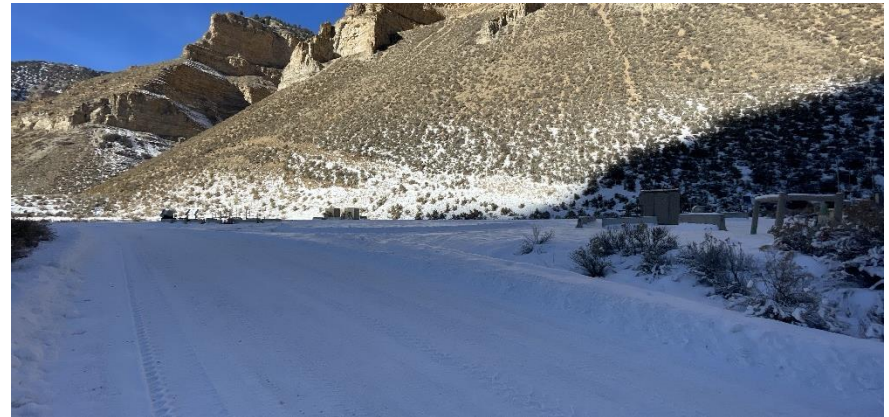
South East corner of location.