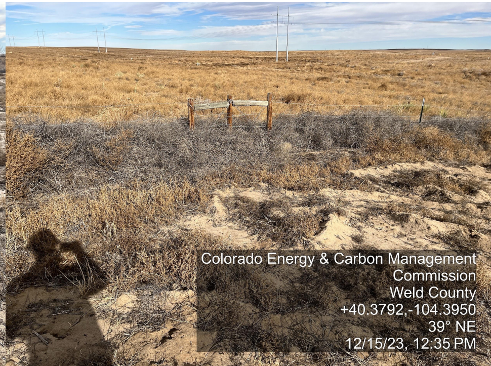
Photo 9. The photo was taken from the East side of the well location facing Southeast. The photo illustrates the differences between the interim area and outside of the perimeter fence. The interim is dominated by russian thistle and outside has more perennial diversity.

Photo 10. The photo was taken at the Northeast side of the well location facing Northeast. The photo illustrates large amounts of tumbleweeds stuck on either side of the perimeter fencing..