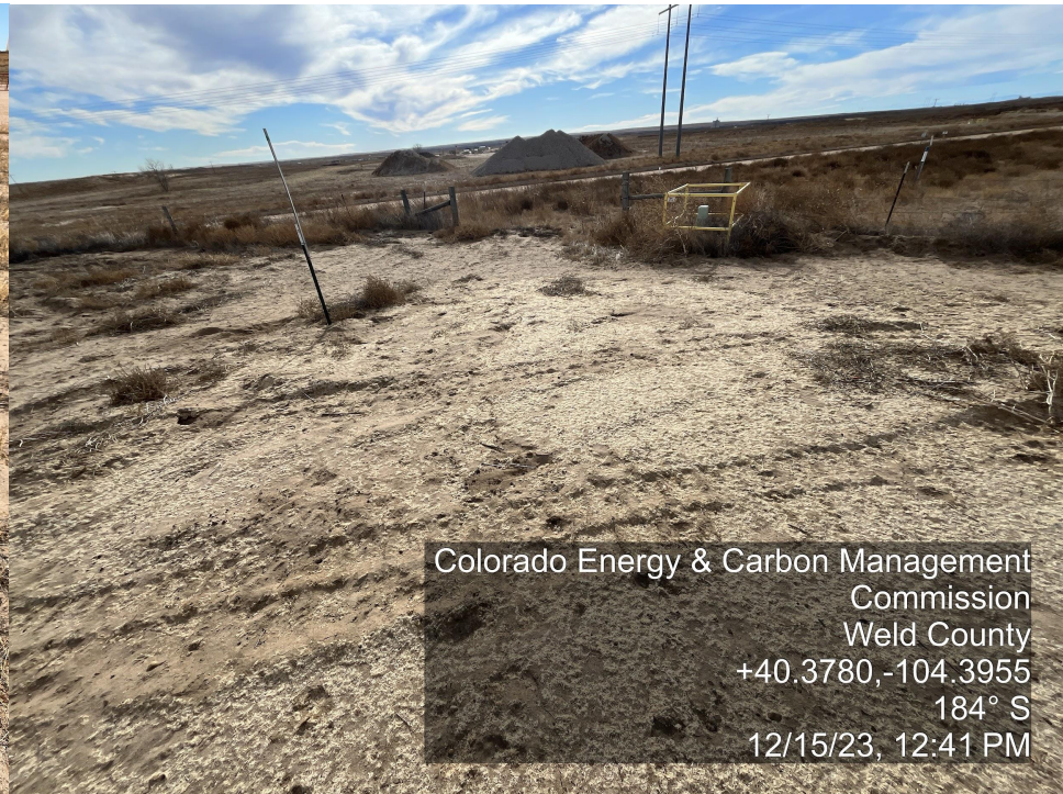
Photo 3. The photo was taken at the South side of the well location facing West. The photo illustrates the interim areas are dominated by russian thistle and bare soil.

Photo 4. The photo was taken at the South side of the well location facing South. Refer to the comment for photo 3.