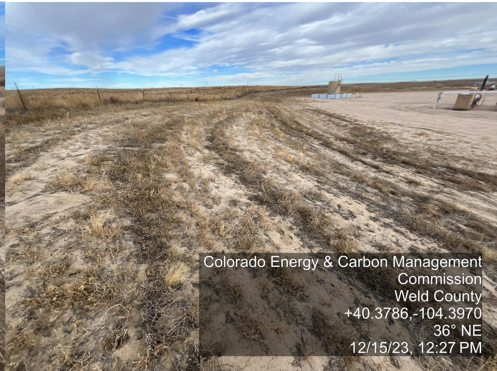
Photo 7. The photo was taken at the South side of the well location facing Southwest. The photo illustrates the corner fencing has been buried by sedimentation from the slope above..

Photo 8. The photo was taken at the Northwest side of the well location facing Northeast. Refer to the comment for photo 3.