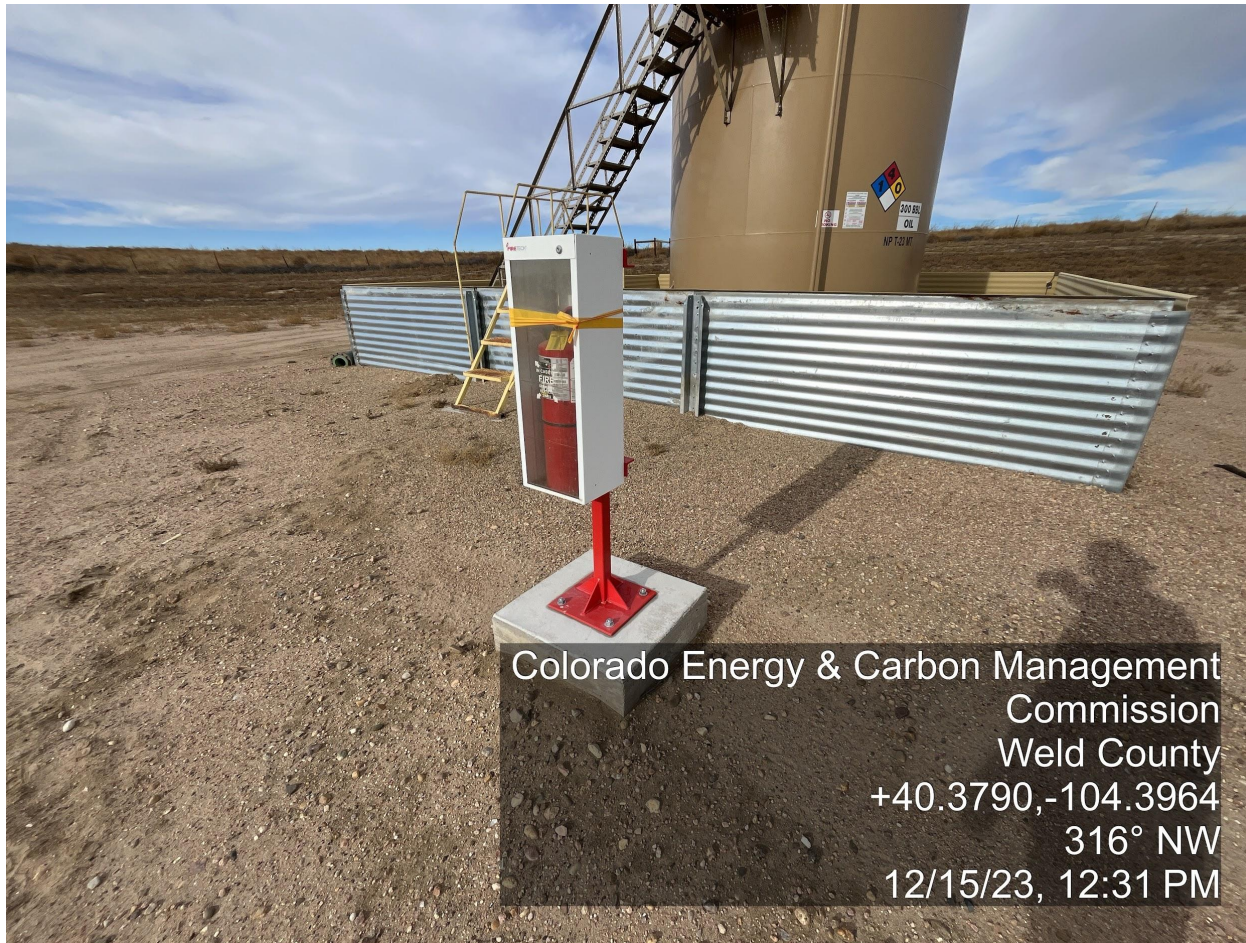
Photo 11. The photo was taken at the North side of the well location facing Northwest. The photo illustrates an oil tank that is not noted in the location paperwork.