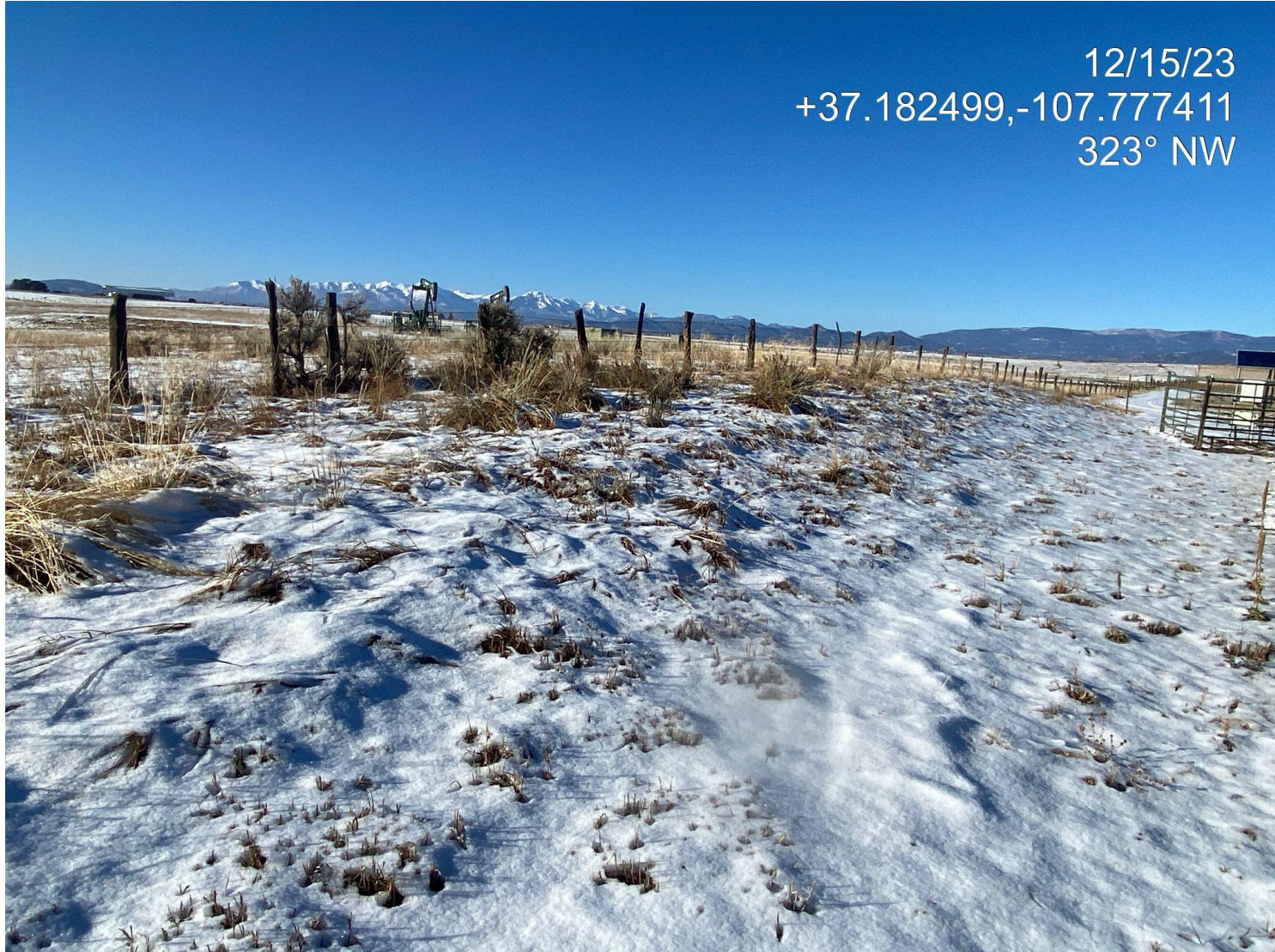
Photo 3. Interim vegetation was not fully assessed due to snowy conditions.