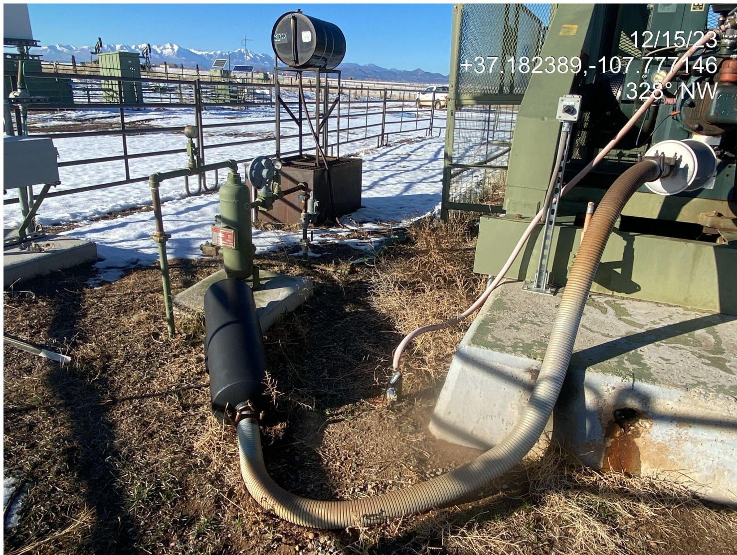
Photo 2. View of weedy debris at the pump jack.