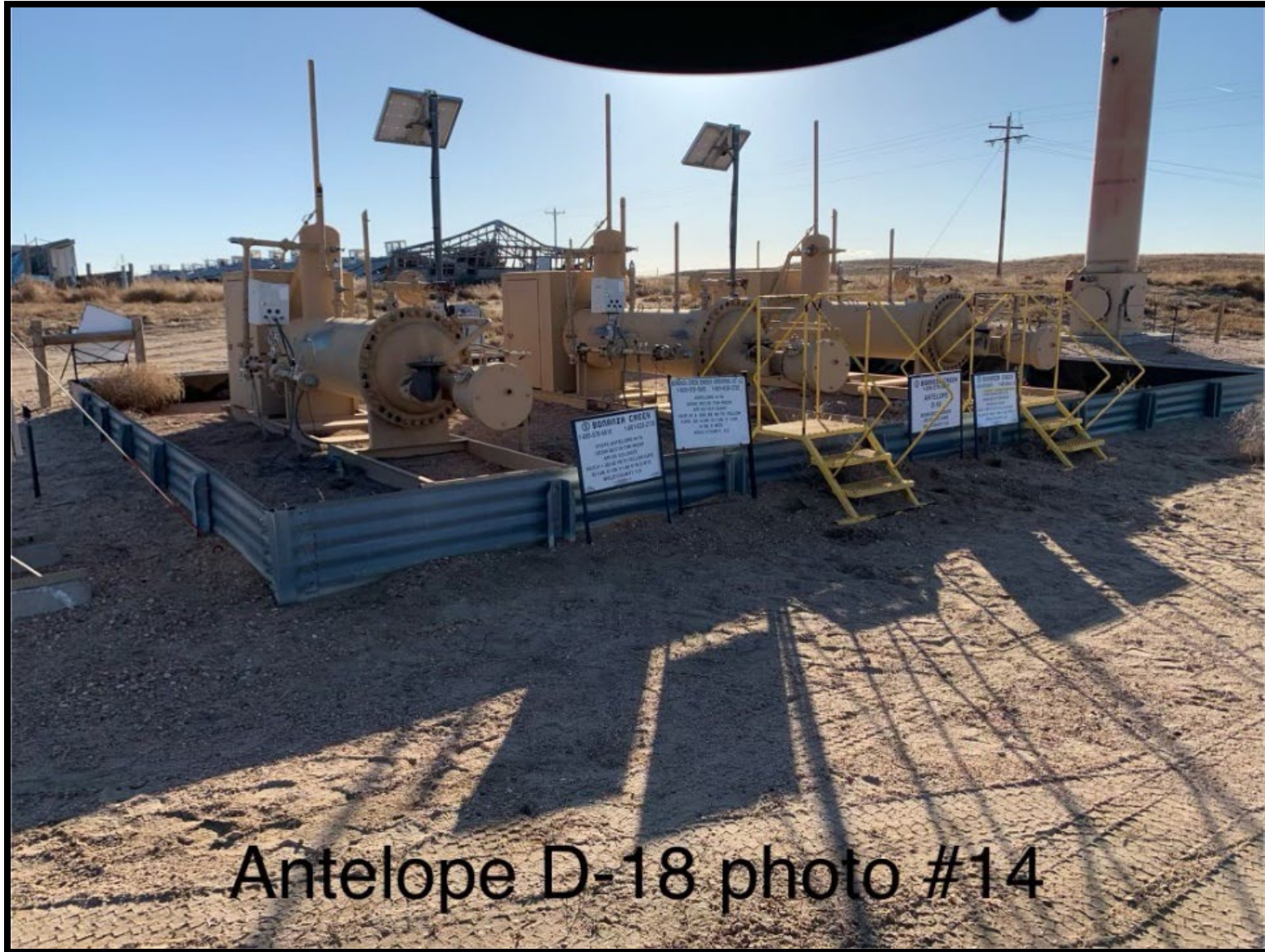
Antelope D-18 photo #14